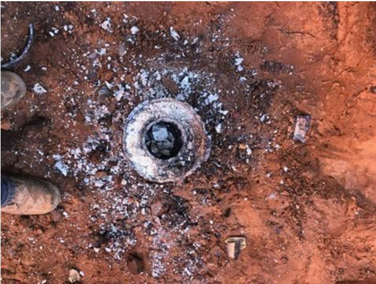
Figure 5: Marker III