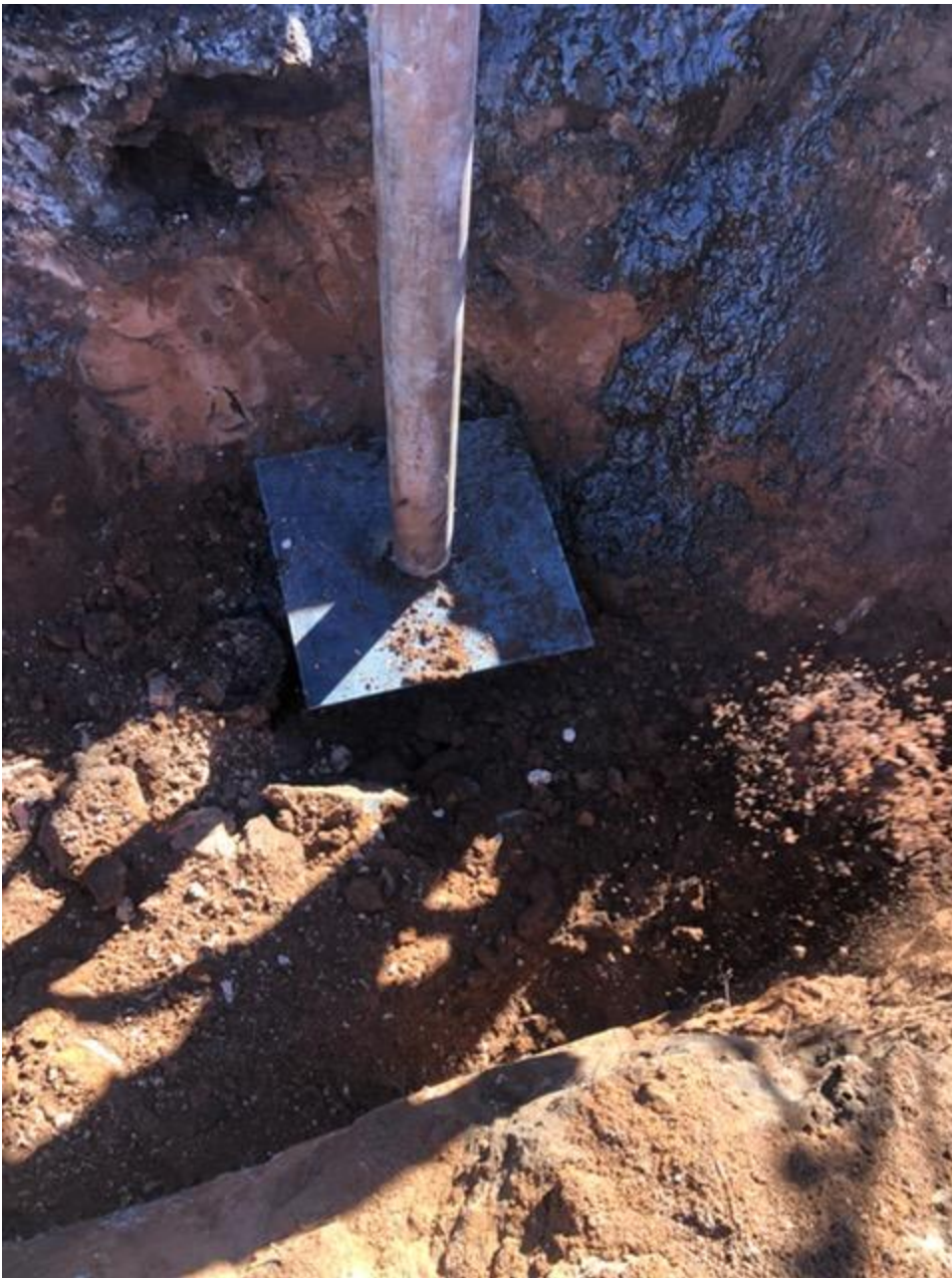
Figure 2: Marker