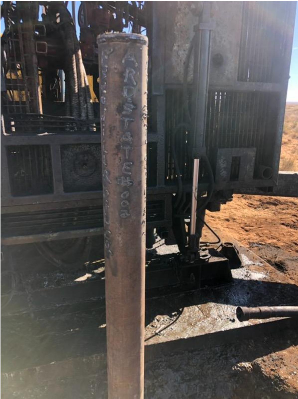
Figure 4: Marker II