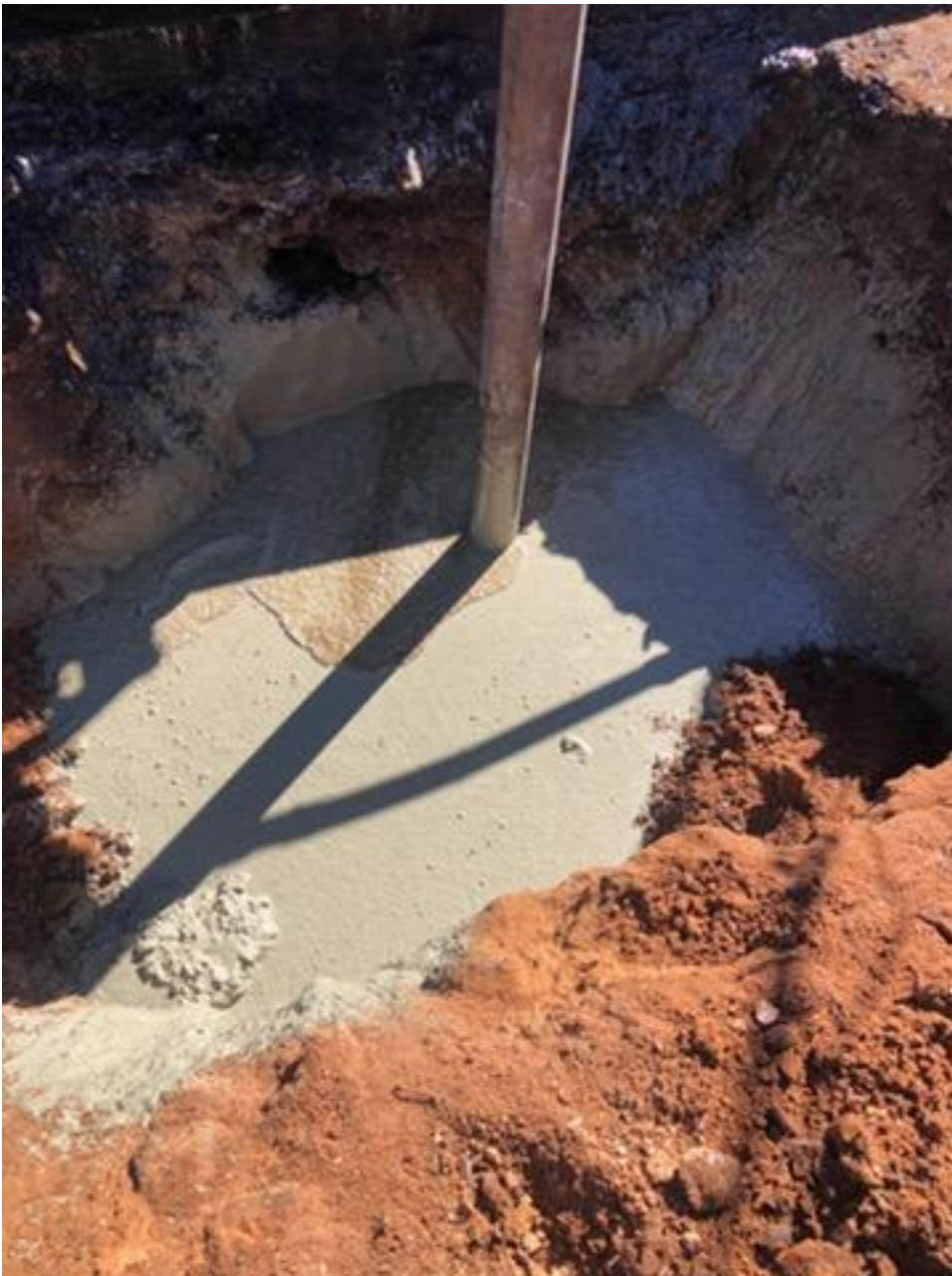
Figure 3: Top Off