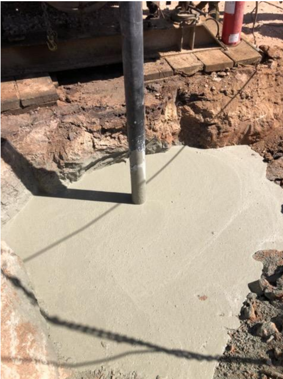
Figure 3: Top Off