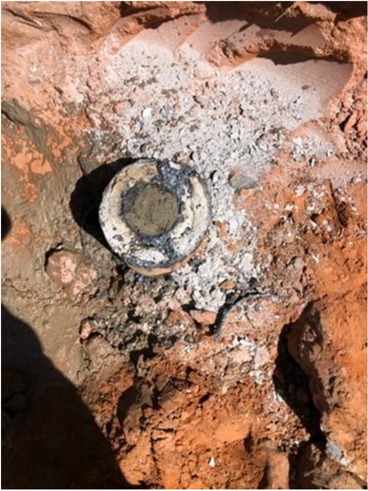
Figure 5: Cut Off