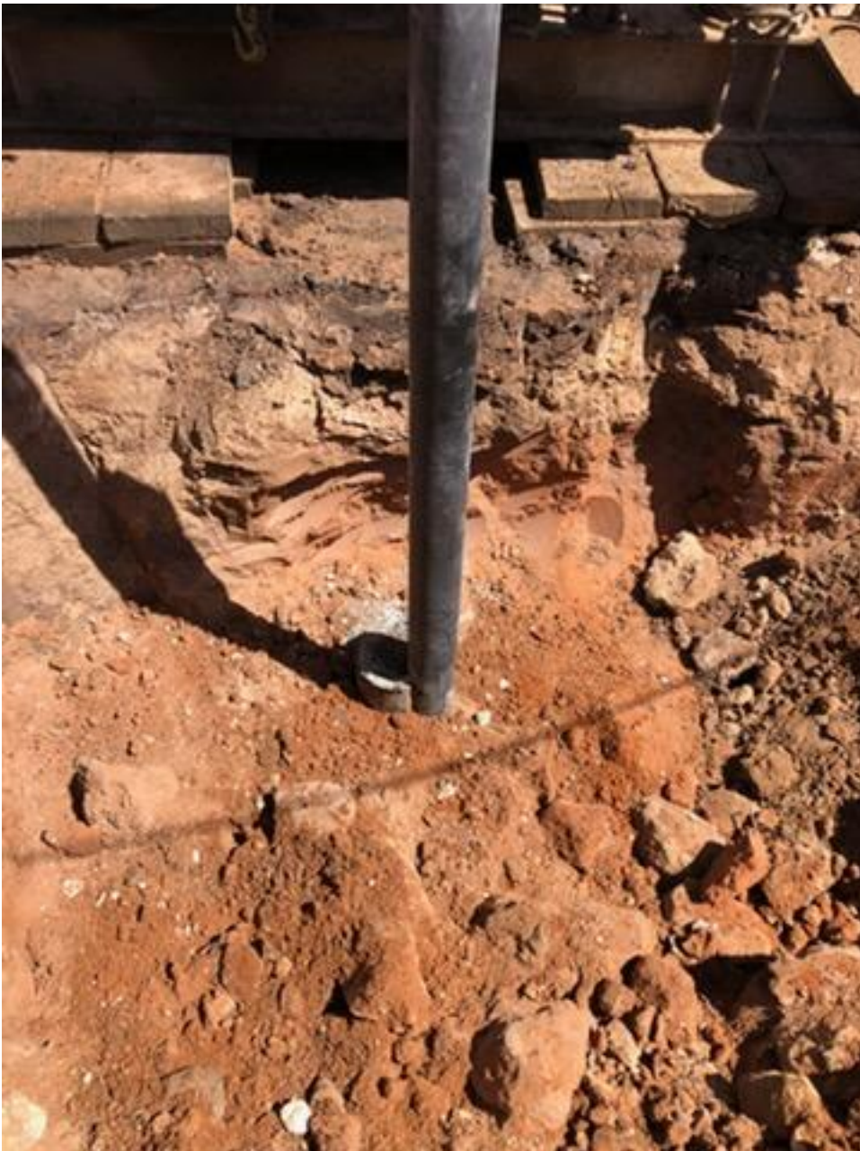
Figure 2: Marker