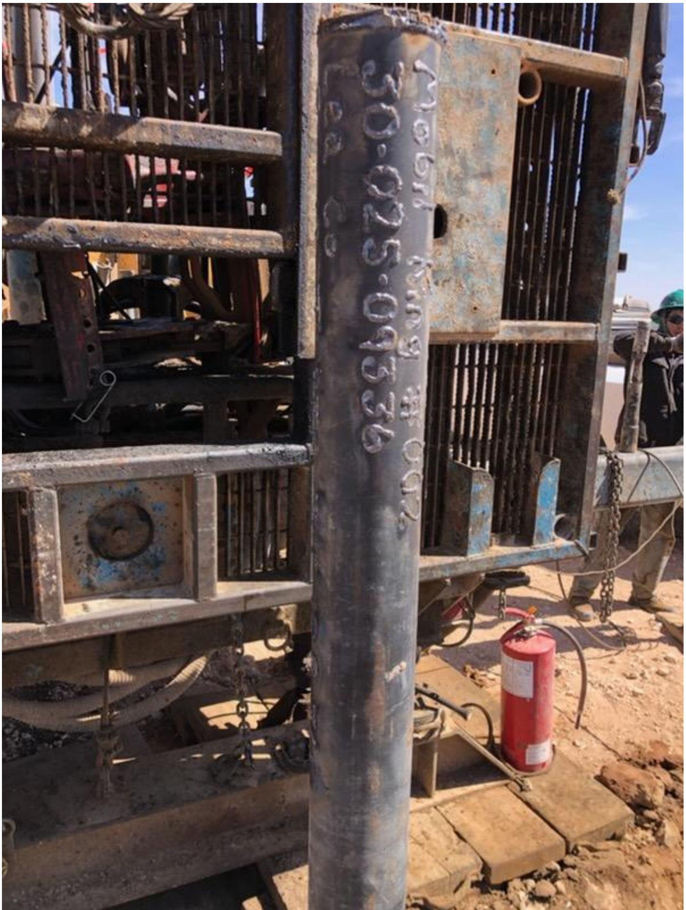
Figure 4: Marker II