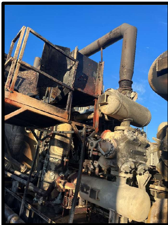
Big Lizard Unit C-103 Post-Fire