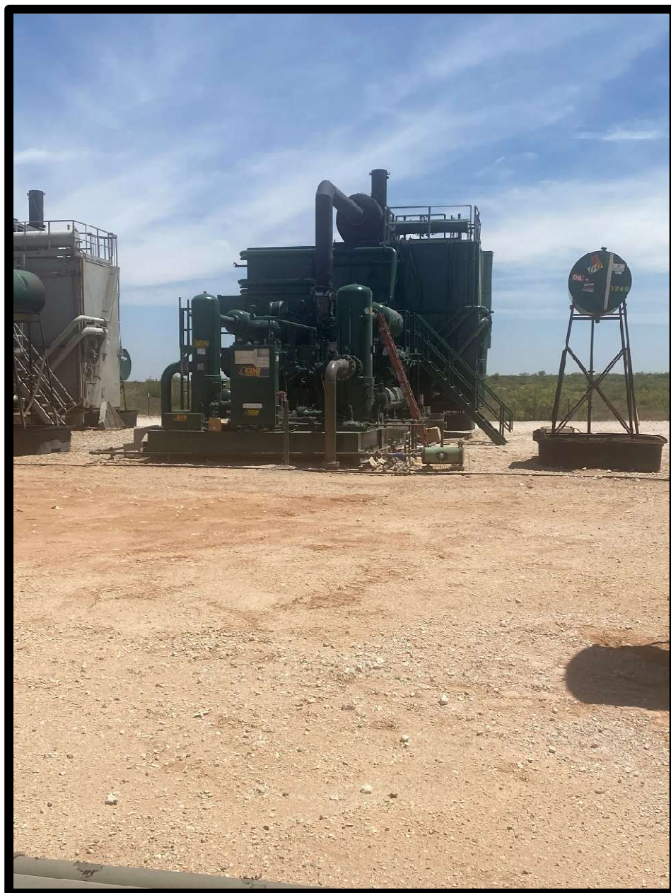
Big Lizard Unit C-103 Post-Fire, Replacement Unit Pictured