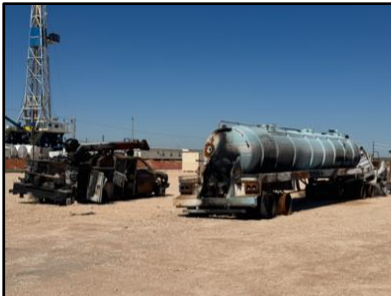
Photo of third party vacuum truck and mechanic truck