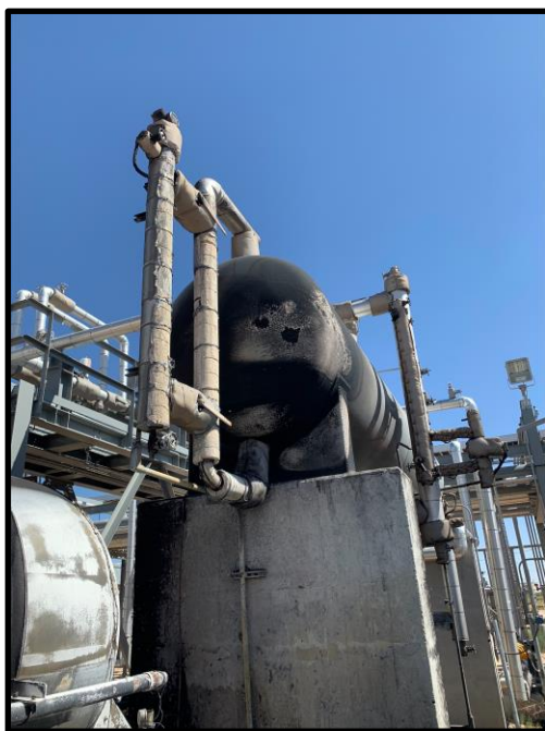
Photo of Property Damage to water flash tank and support