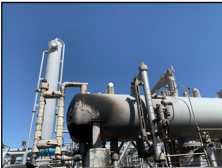
Photo of property damage to water flash tank and support