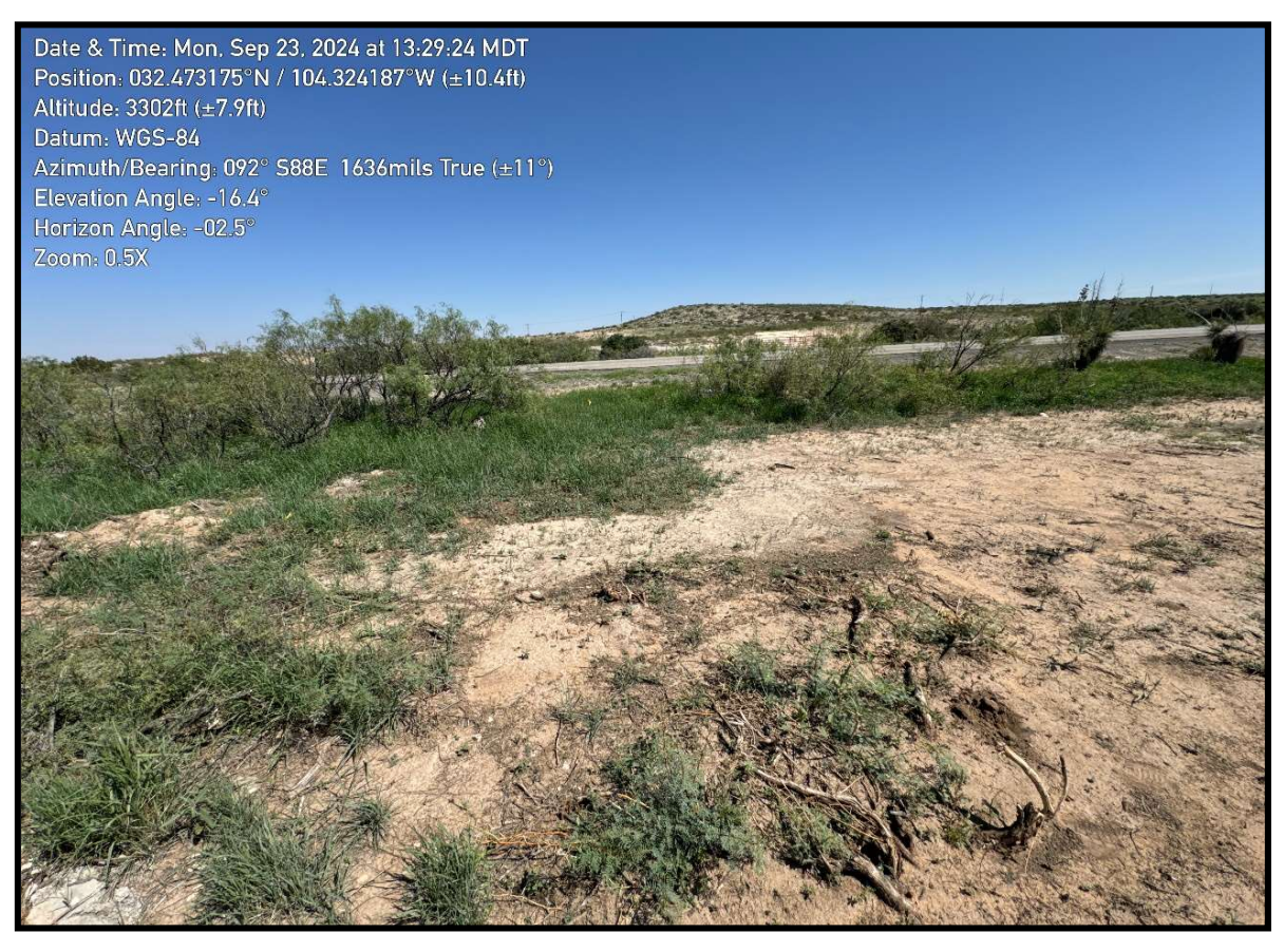
View of the impacted area during sampling activities, facing southeast (September 23, 2024).