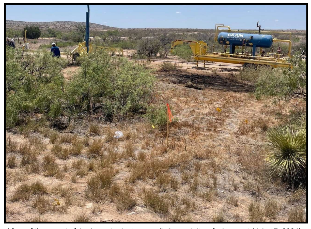
View of the extent of the impact prior to remediation activites, facing west (July 17, 2024).