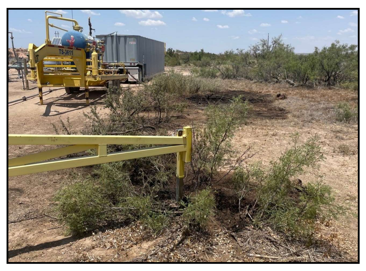
View of the extent of the impact prior to remediation activites, facing north (July 17, 2024).