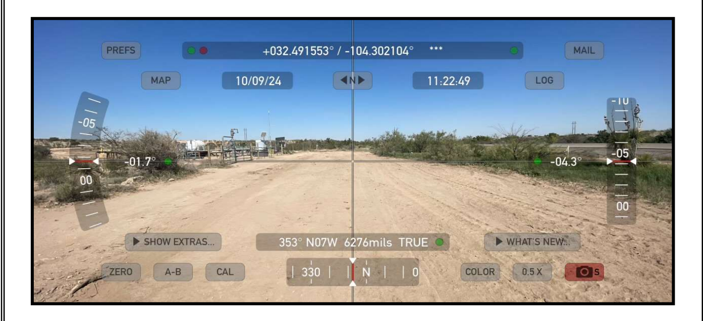
View of scraped impacted area, facing north (October 9, 2024).