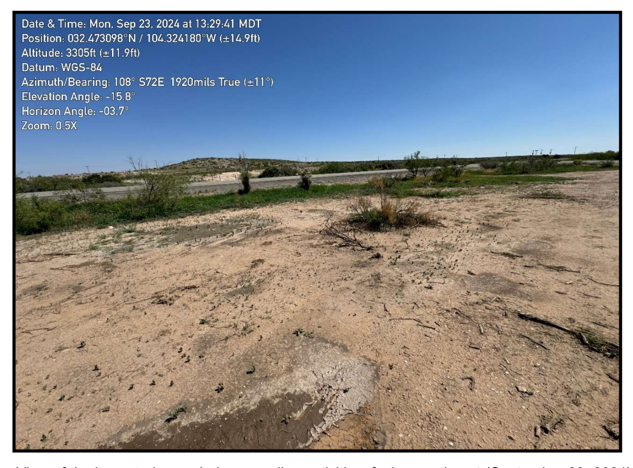
View of the impacted area during sampling activities, facing southeast (September 23, 2024).