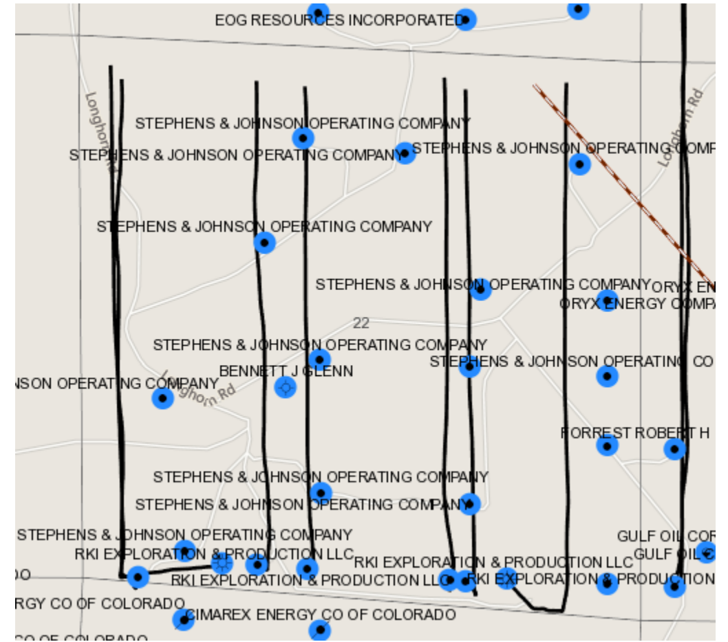
Sec 22: operators – RKI, Stephens & Johnson