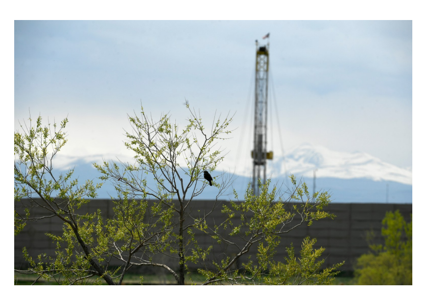
The Ivey Pad site in Adams County is operated by Great Western Petroleum. The company calls it their very first "GREEN platinum facility." The site opened in November 2020. "GREEN" stands for Globally Reduced Emissions and Extraction Network.