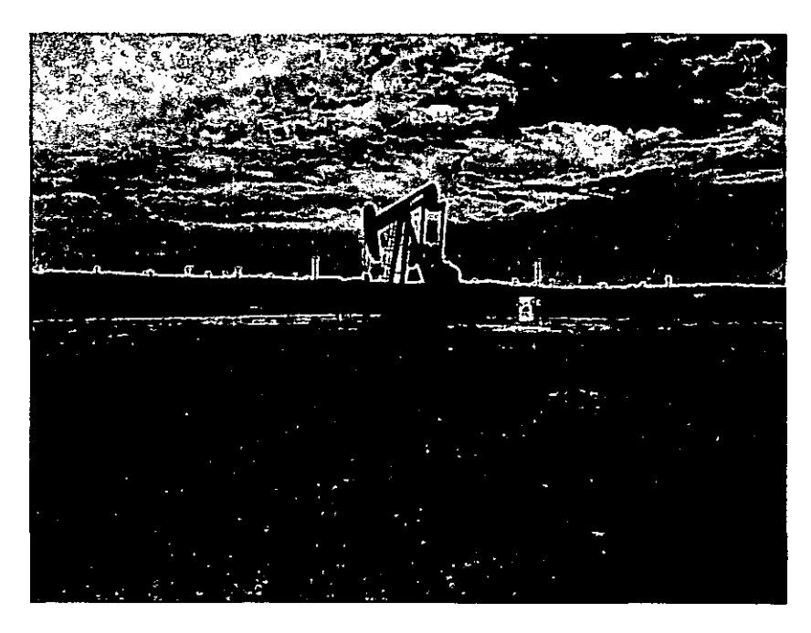
OVERVIEW OF WELL PAD LOOKING NW

TONY FEDERAL #45; S.18,T17S,R31E; 990' FSL & 330' FEL; 30-015-40390; NMLC-029395A