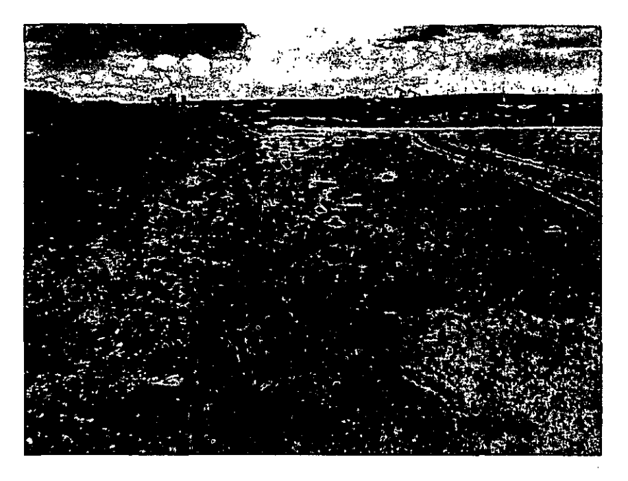
SOUTH EDGE OF WELL PAD WITH CUT RECONTOURED AND RECLAIMED