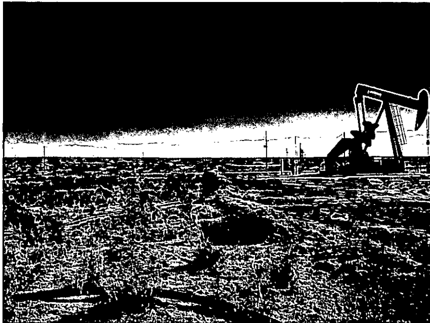
Back of well pad showing berming of pad

Remaining surface needed for daily operations is 198' x 152' or 0.69 acres.