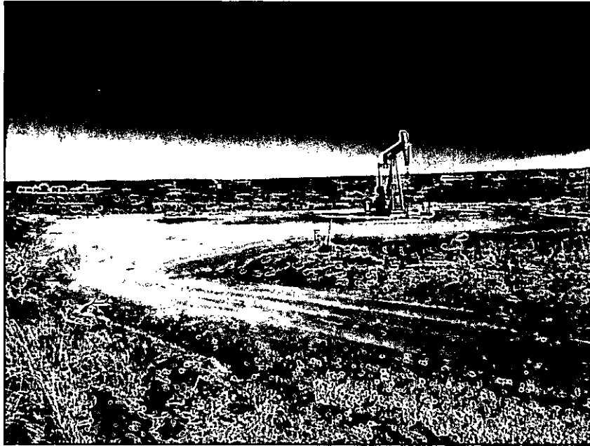
Overview of well pad

Coffee Federal #13; B. Sec.18, T17S, R31E; 980' FNL & 2180' FEL; 30-015-40958 ; NMLC-089548A