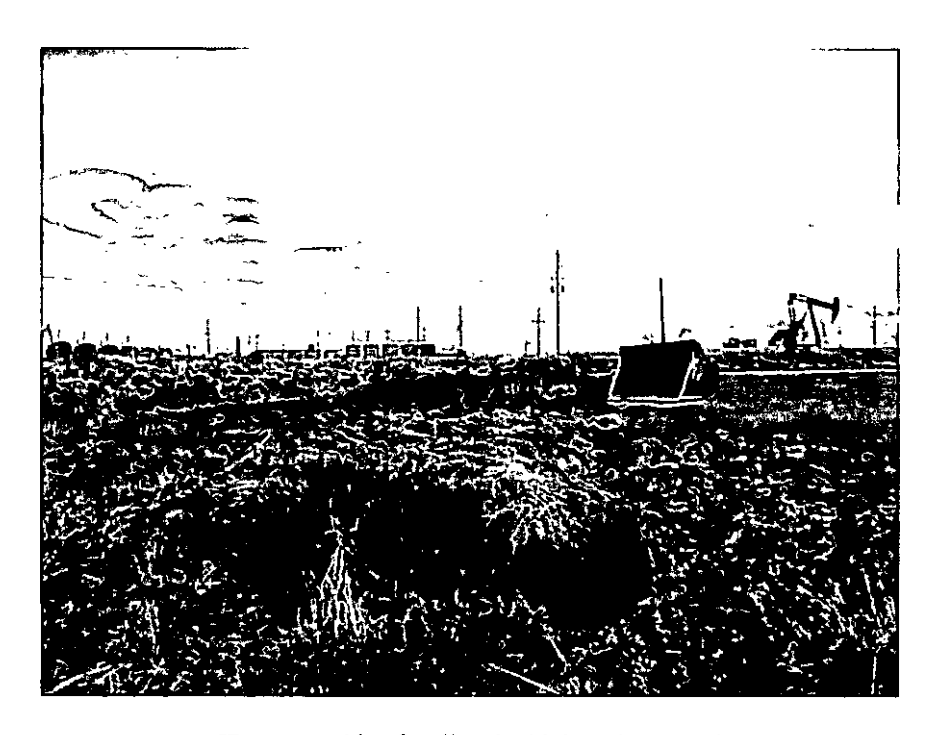
IR on east side of well pad with berming at pad