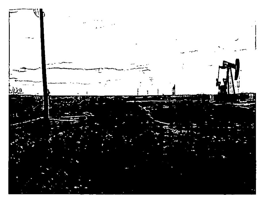
IR on the north side of well pad with berming around pad

Remaining surface needed for daily operations is 203' x 196' or 0.91 acres.