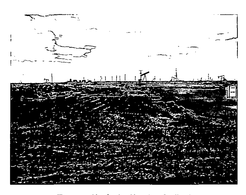
IR on west side of pad and berming of well pad