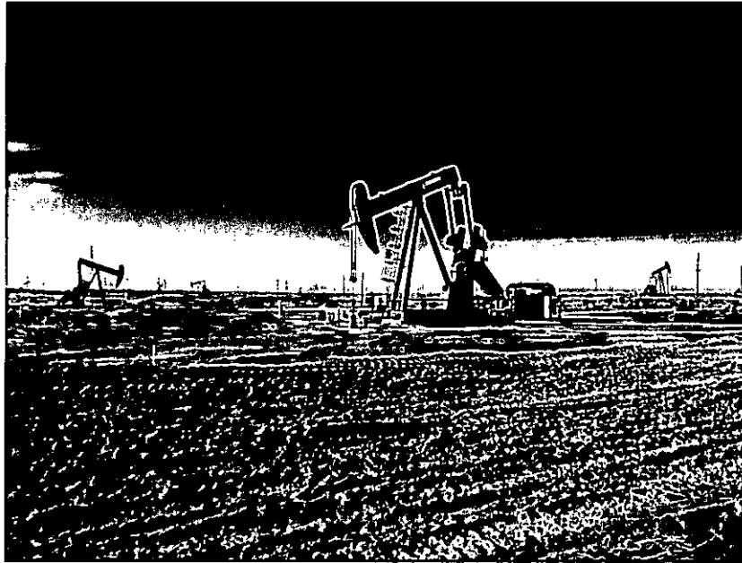
Overview of well pad

Coffee Federal #18; Sec.18, T17S, R31E; 1990' FNL & 1010' FWL; 30-015-42400; NMLC-029548A