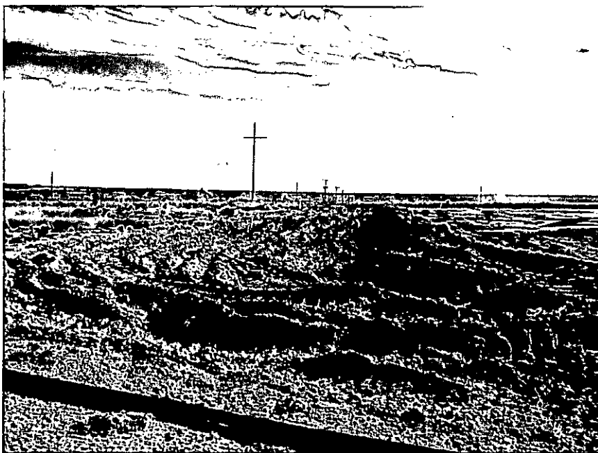
IR on north and berming at pad.

Remaining surface needed for daily operations is 213' x 210' or 1.03 acres.