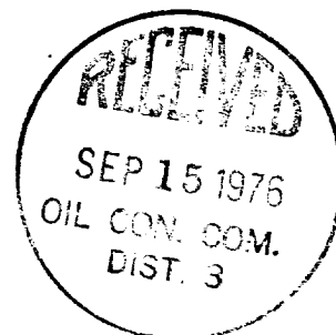
EXHIBIT D-4 OCTOBER 16, 1969