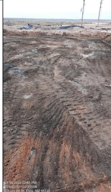
Photograph: 4 Date: 3/6/2024 Description: Containment after sludge removal View: North