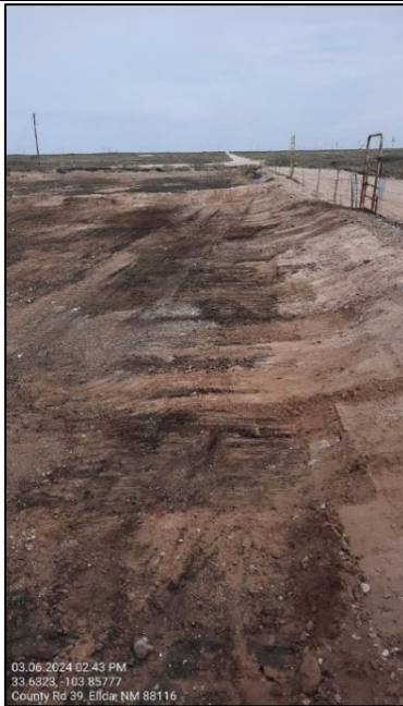
Photograph: 3 Date: 3/6/2024 Description: Containment after sludge removal View: East