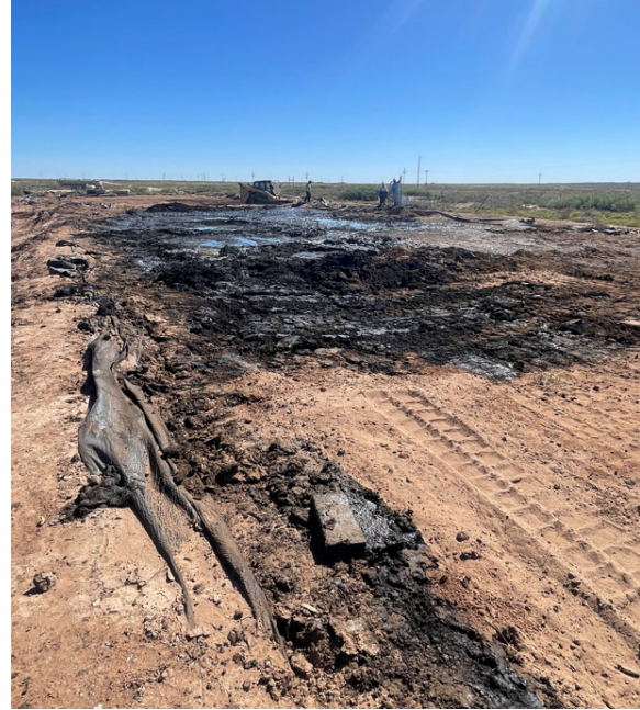
Photograph: 2 Date: Description: Containment area prior to excavation View: East