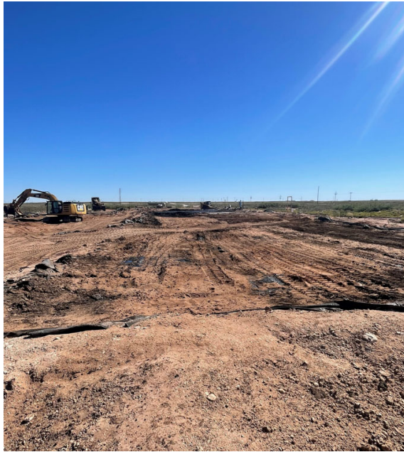
Photograph: 1 Date: Description: Containment area prior to excavation View: East