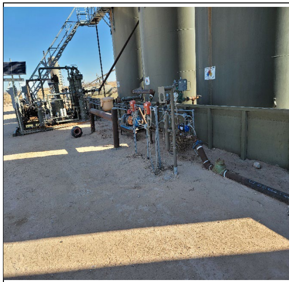
Photograph No.2 Description: