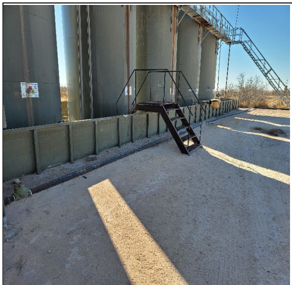
Photograph No.1 Description: