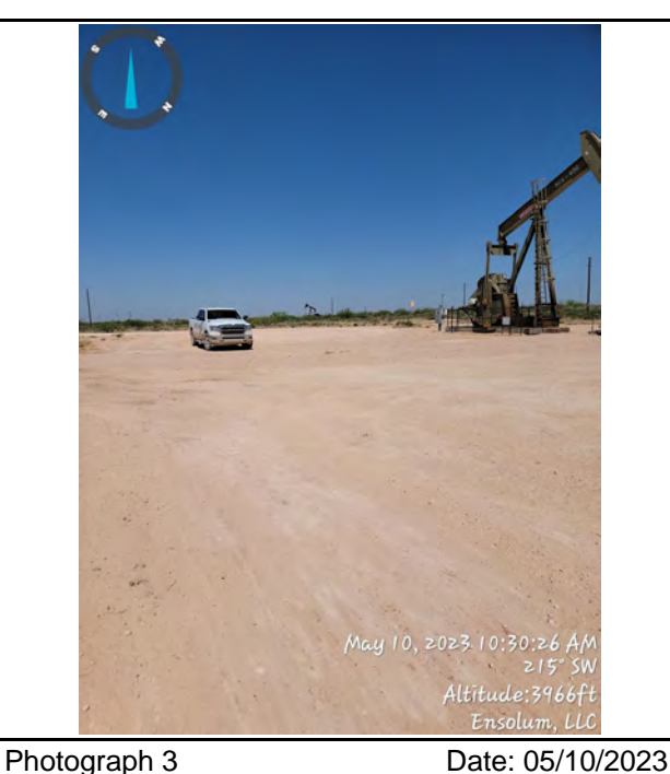
Photograph 3 Description: Release area