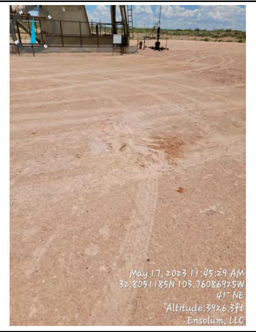
Photograph 4 Date: 05/17/2023 Description: Release area during delineation activities