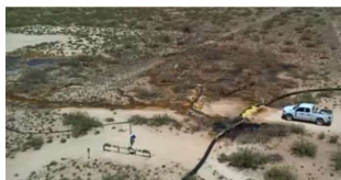
Ariel view of the release

☰ Rice shut in and the water got directed to the the Rice layflat causing the line to fail and releasing produced water