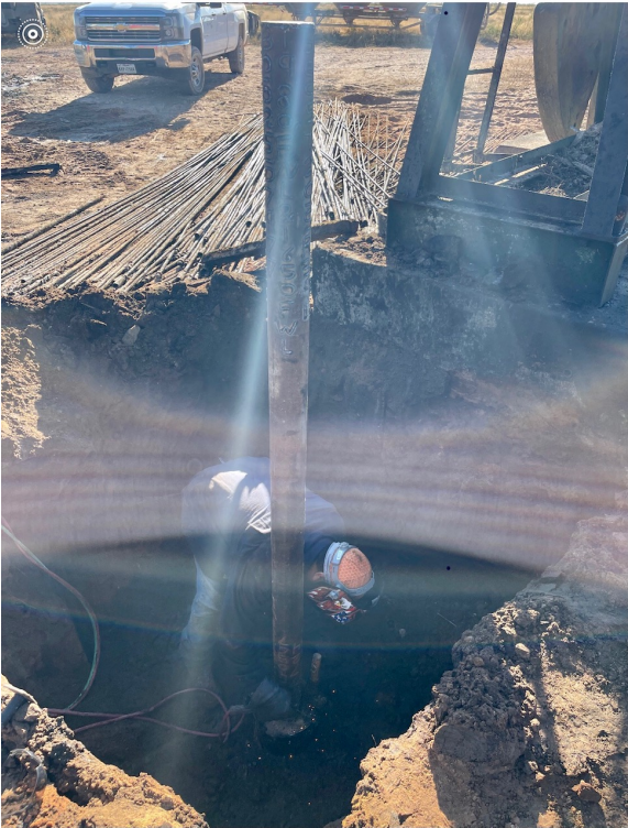
Dry Hole Marker 11/4/21