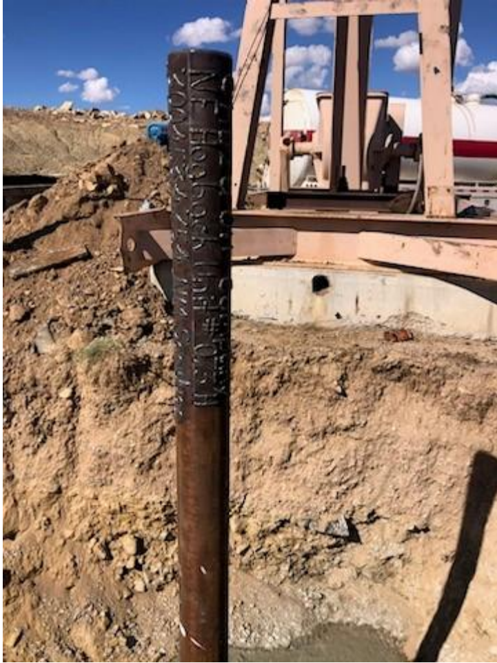
Figure 2: Marker