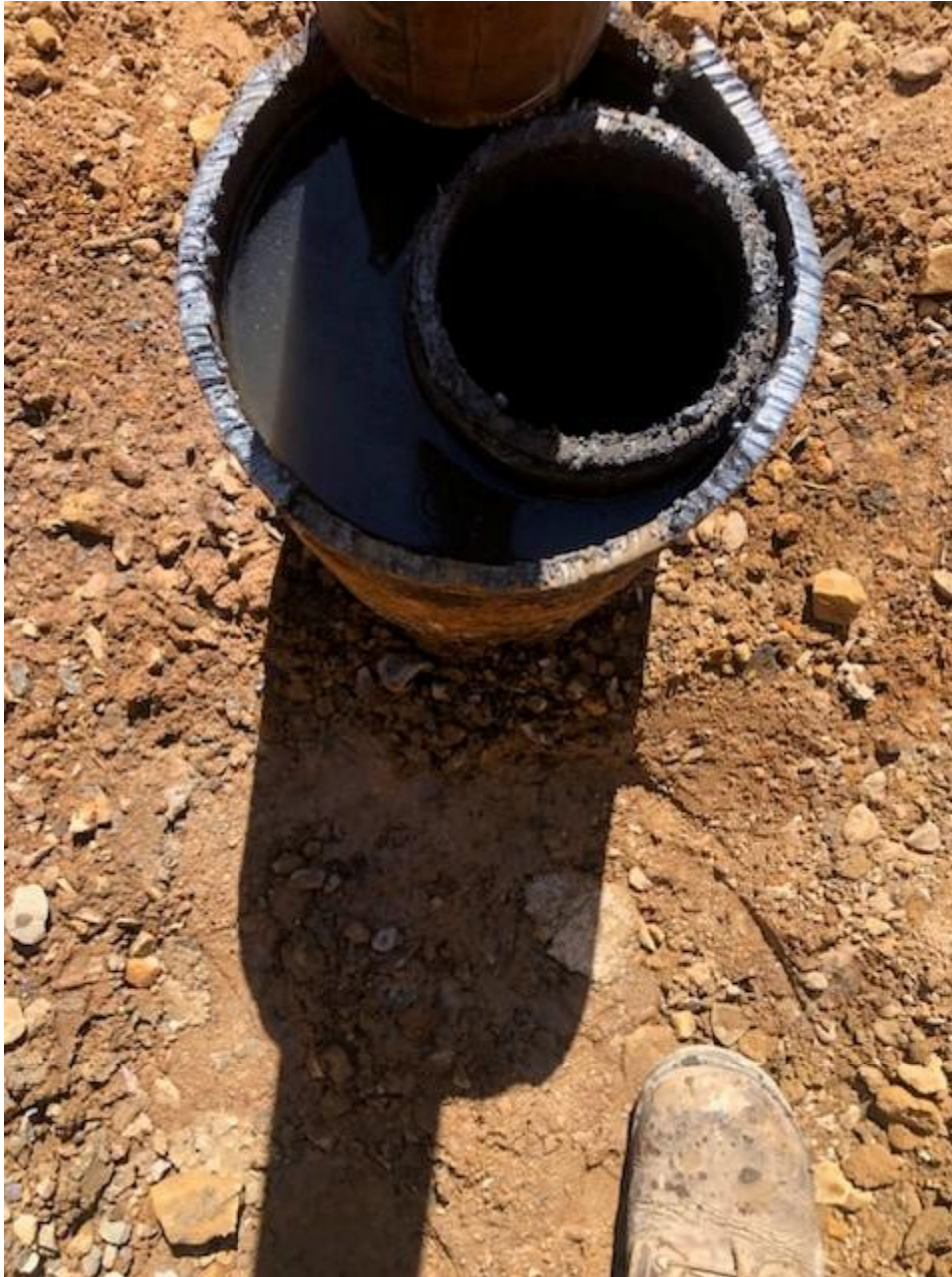
Figure 4: Cut Off