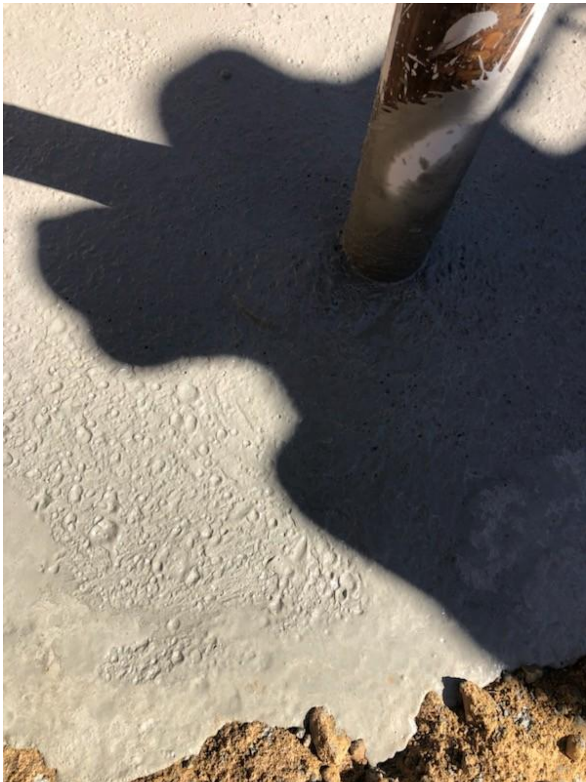
Figure 3: Top Off