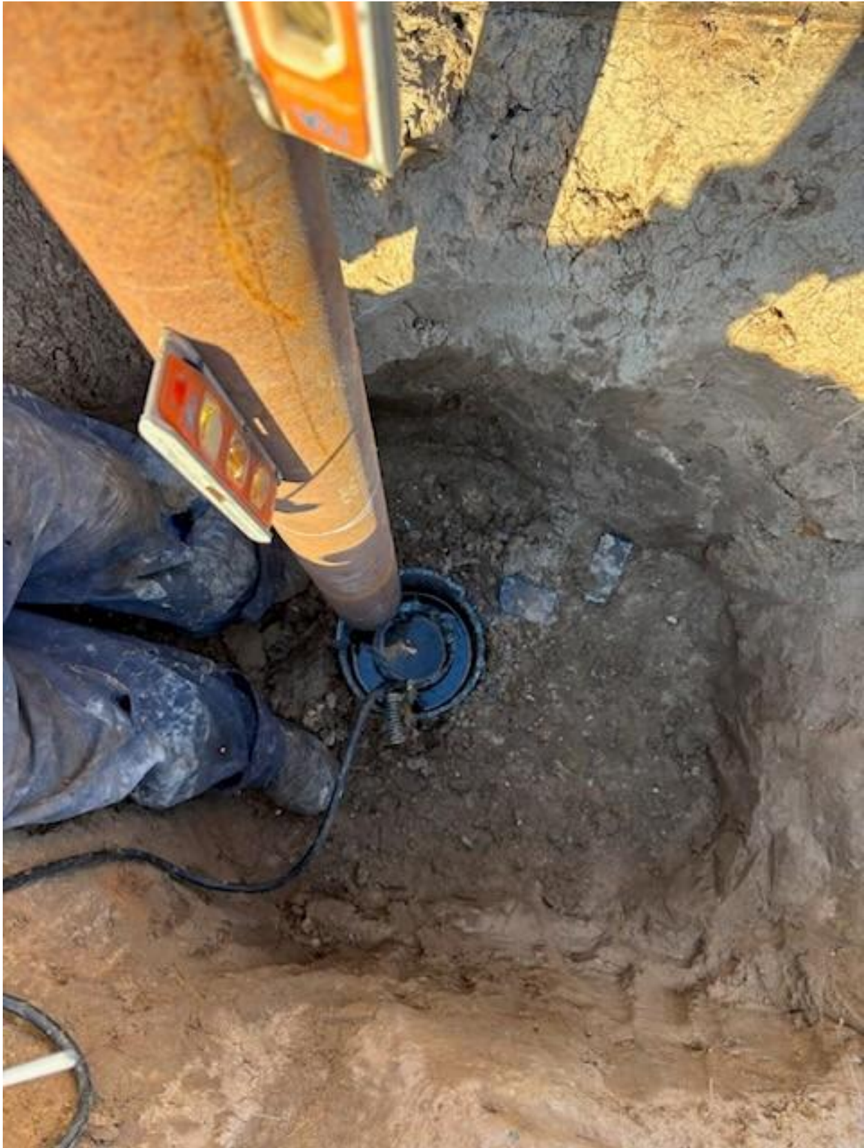
Figure 3: Marker Install