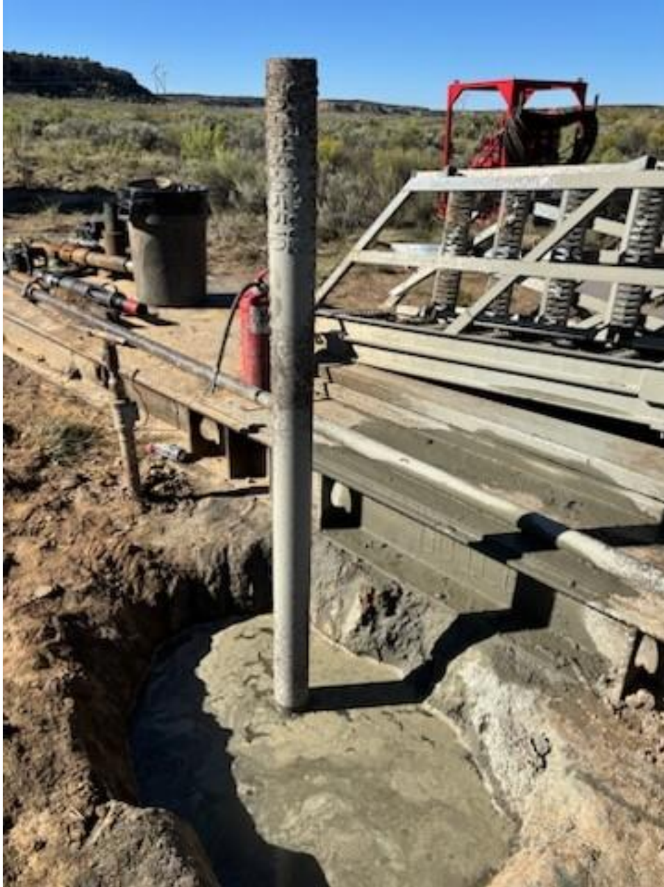
Figure 4: Marker