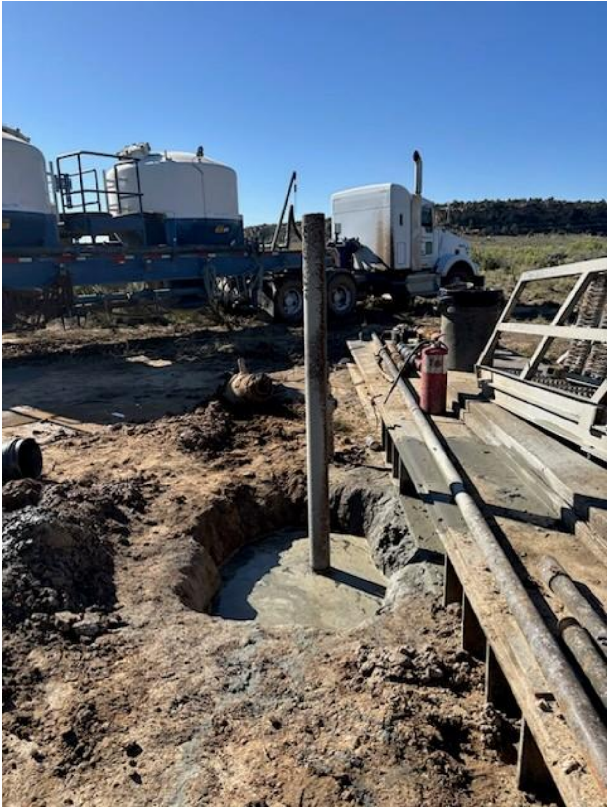
Figure 2: Top Off