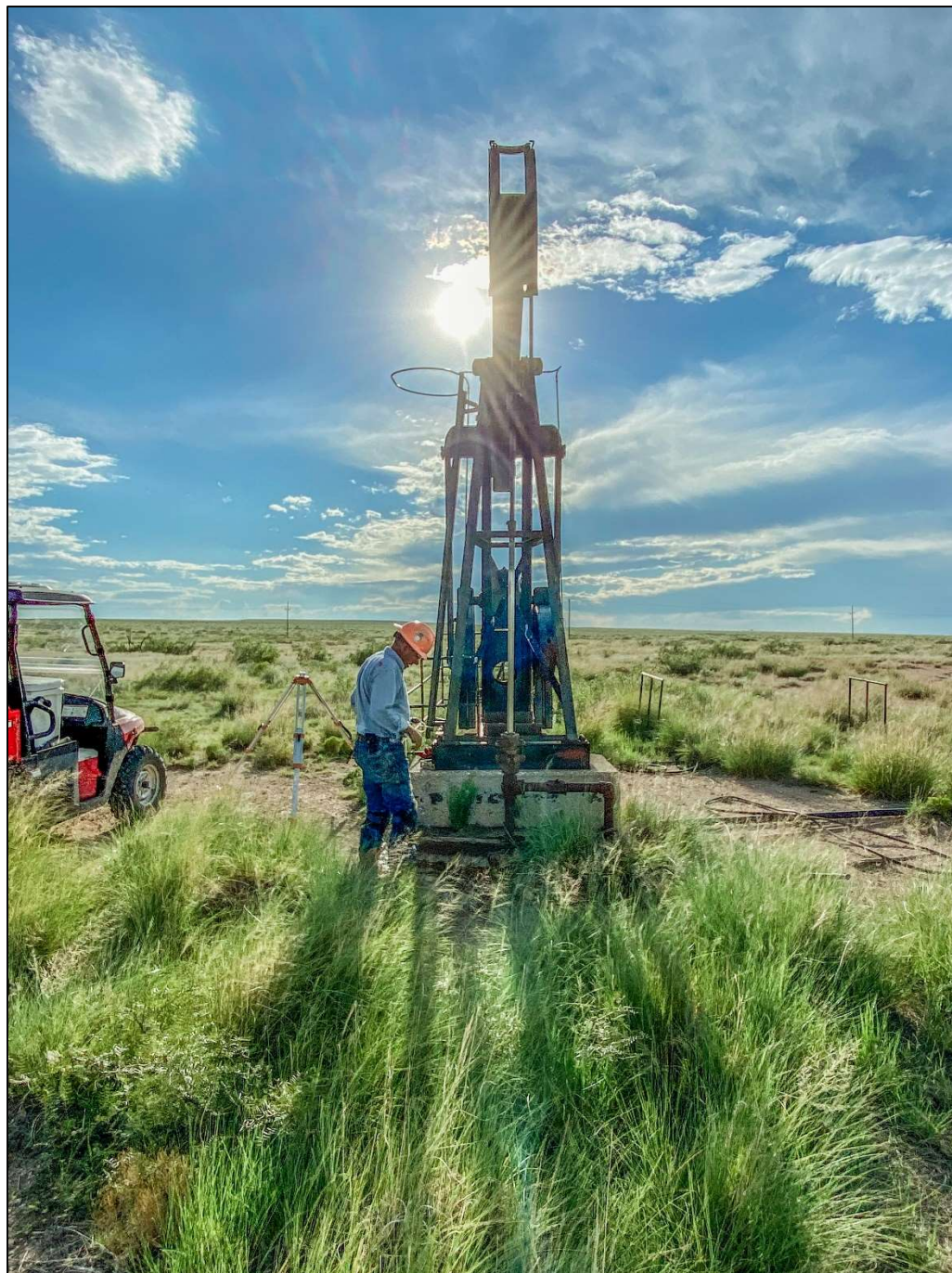
1) Double L Queen #010 (30-005-60138) – North Facing