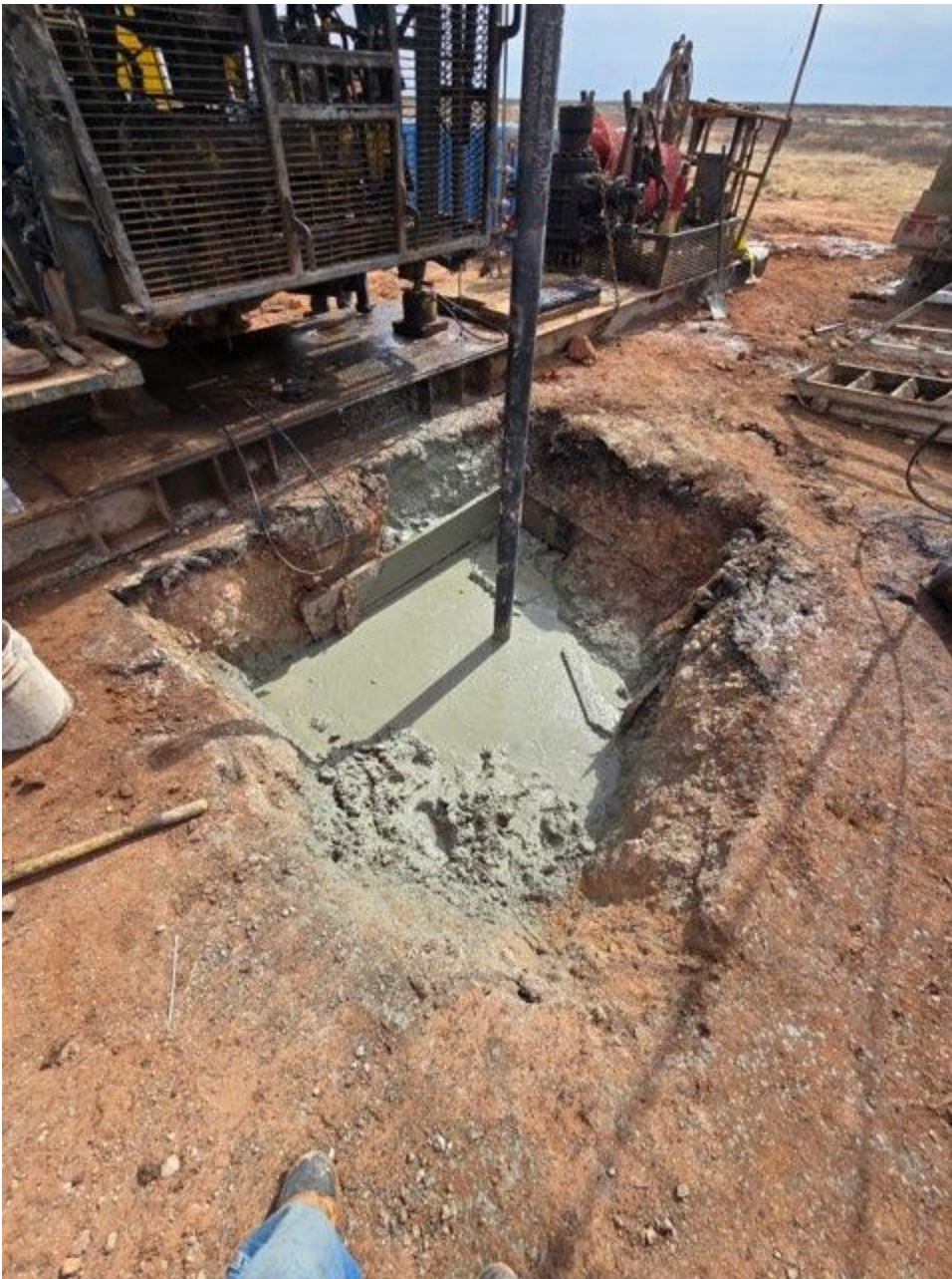
Figure 3: Top Off