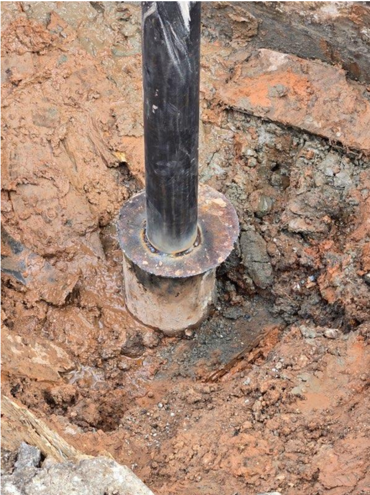
Figure 5: Marker