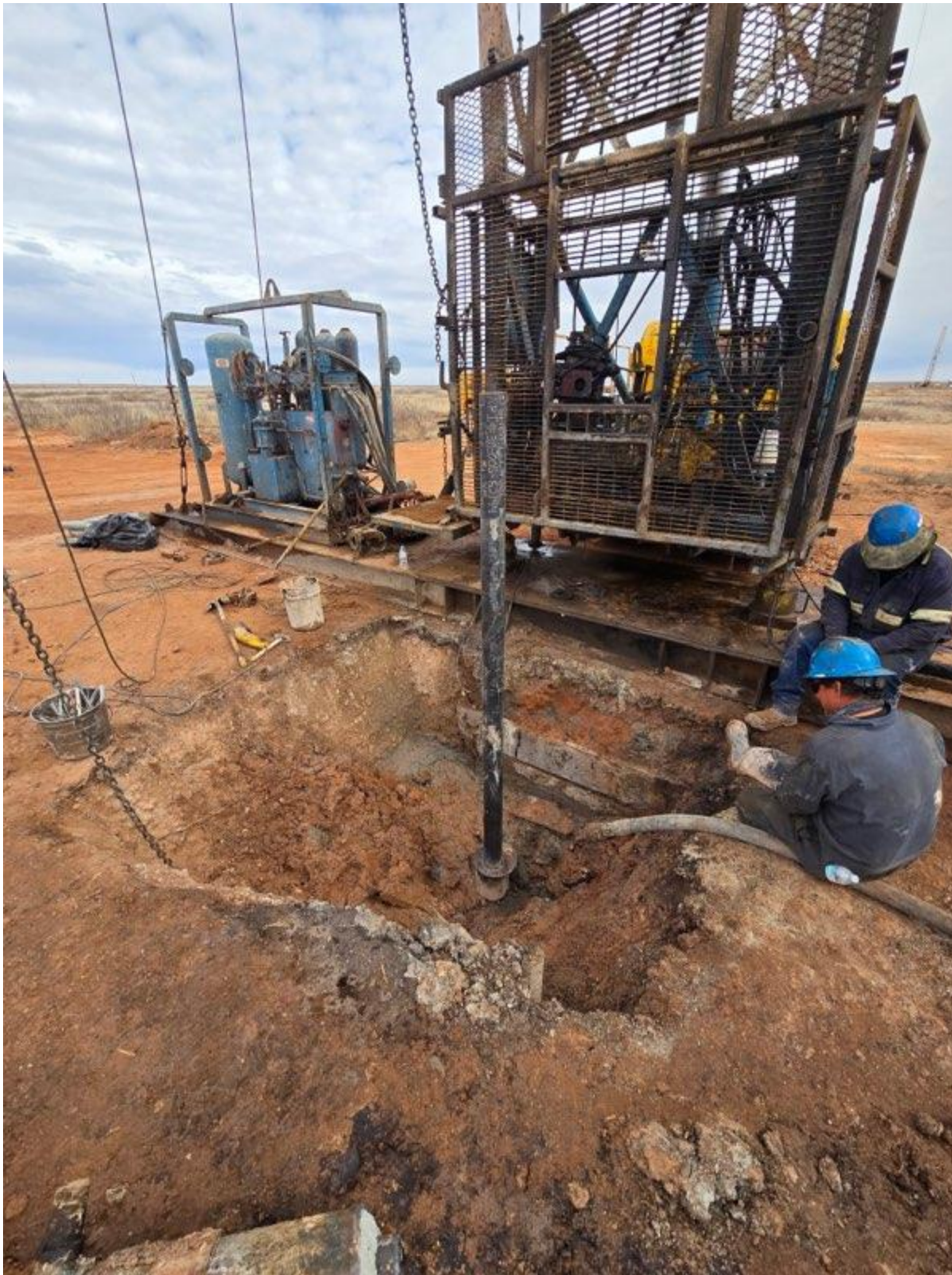
Figure 6: Marker II