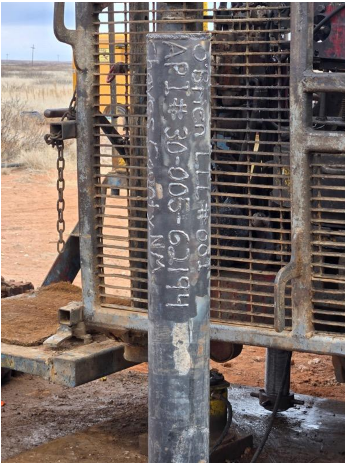
Figure 4: Marker Detail