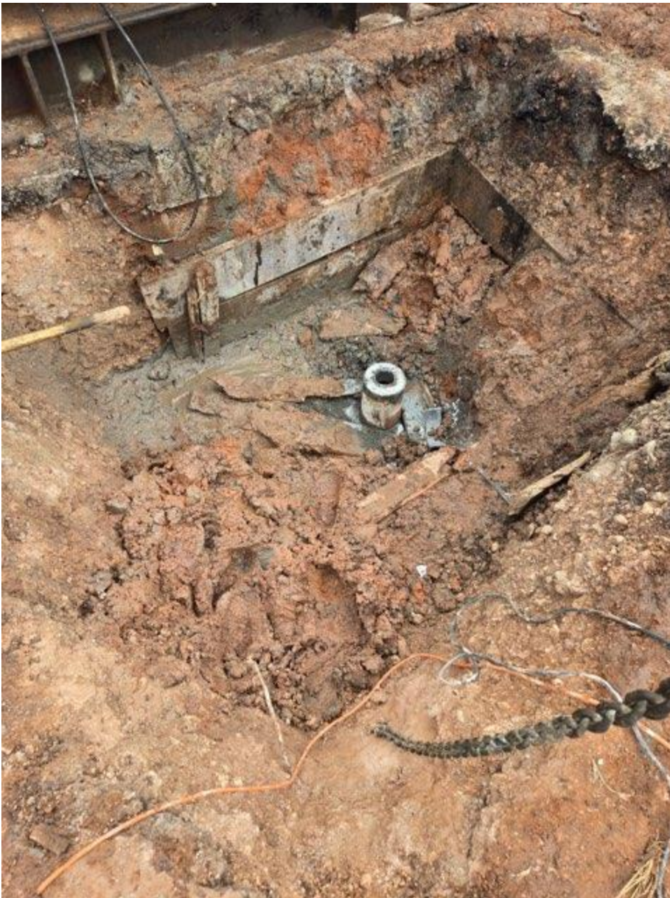
Figure 1: Cut Off