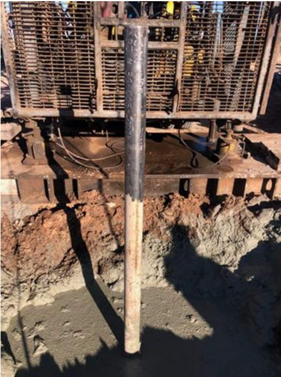
Figure 3: Marker II