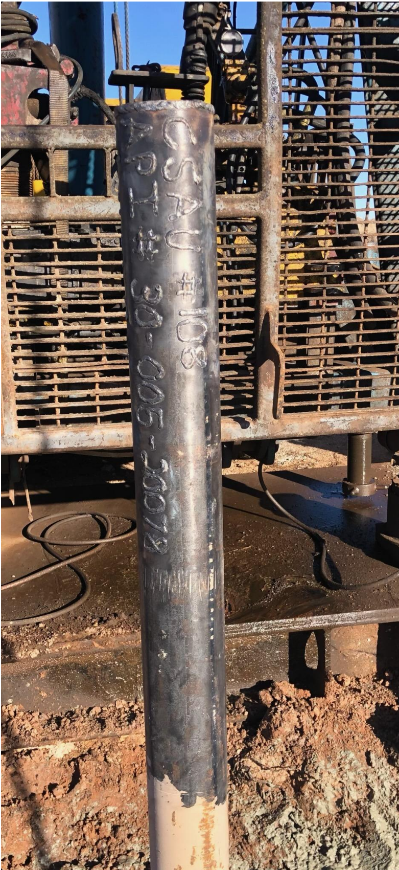
Figure 2: Marker