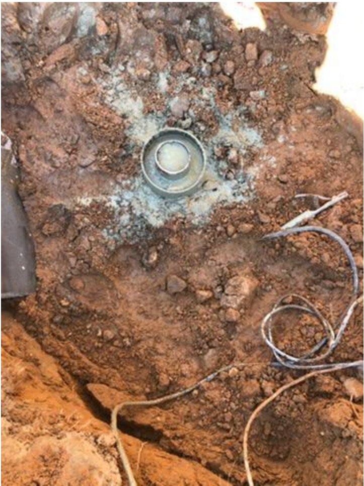
Figure 1: Top Off