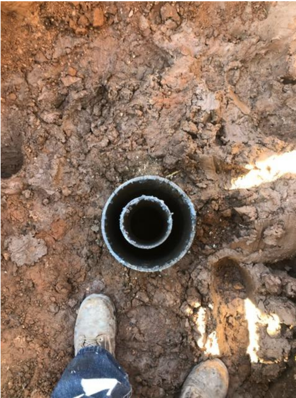
Figure 5: Cut Off