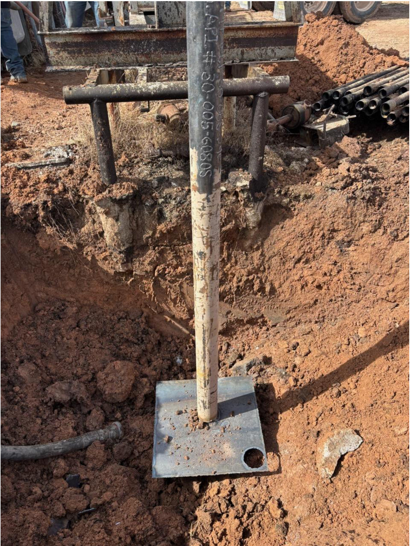
Figure 3: Marker I