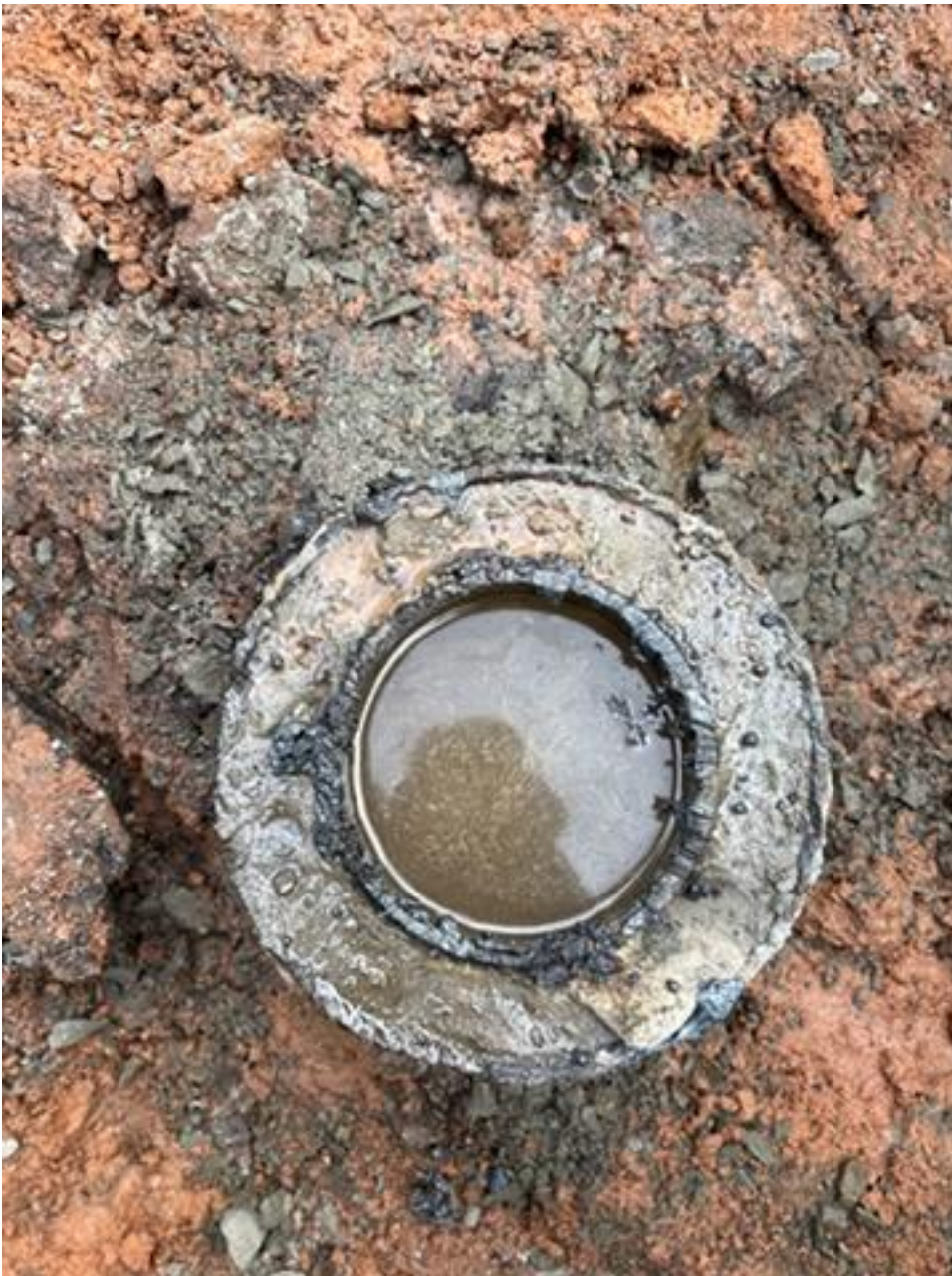
Figure 2: Cut Off