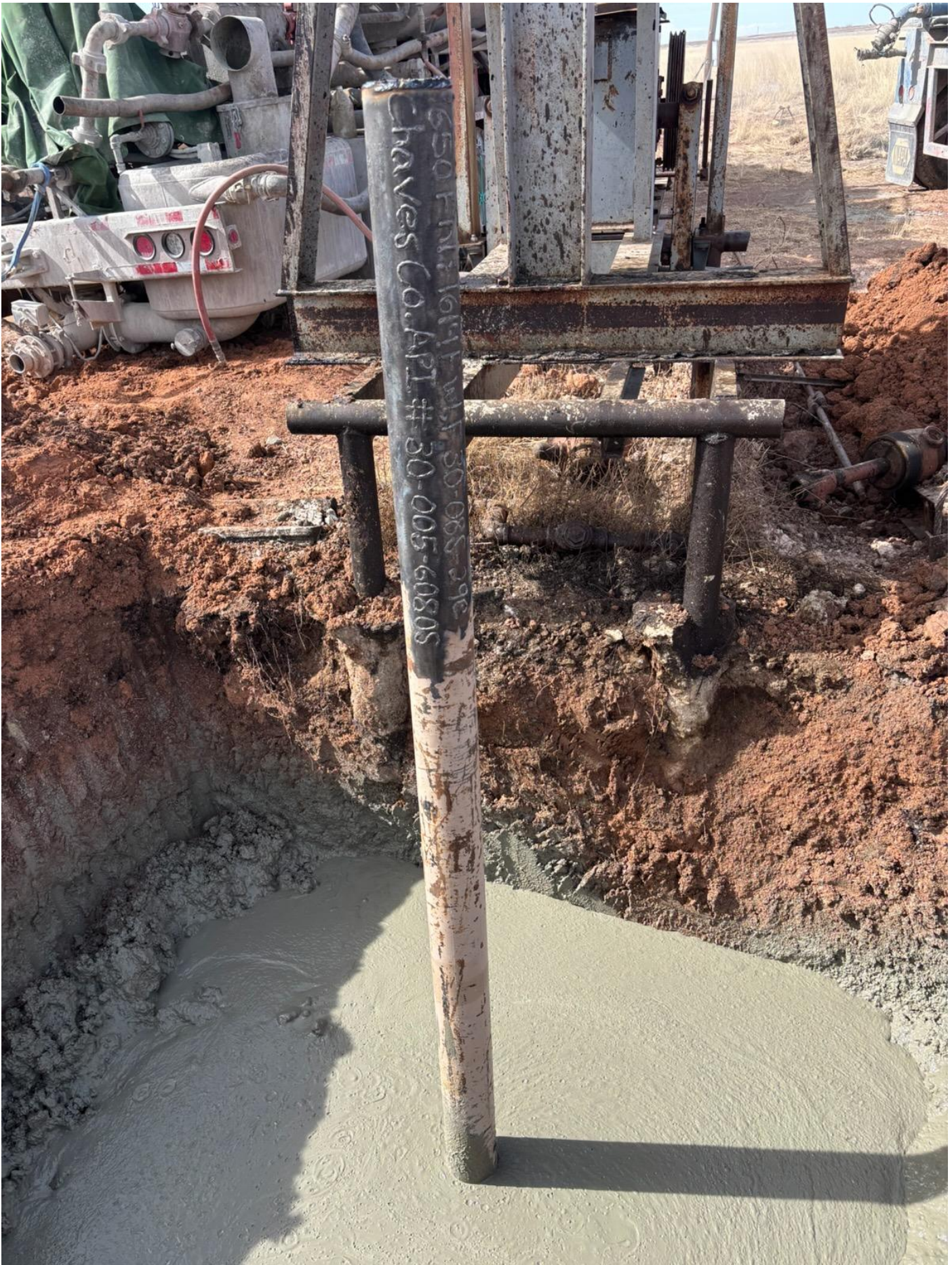
Figure 4: Marker II