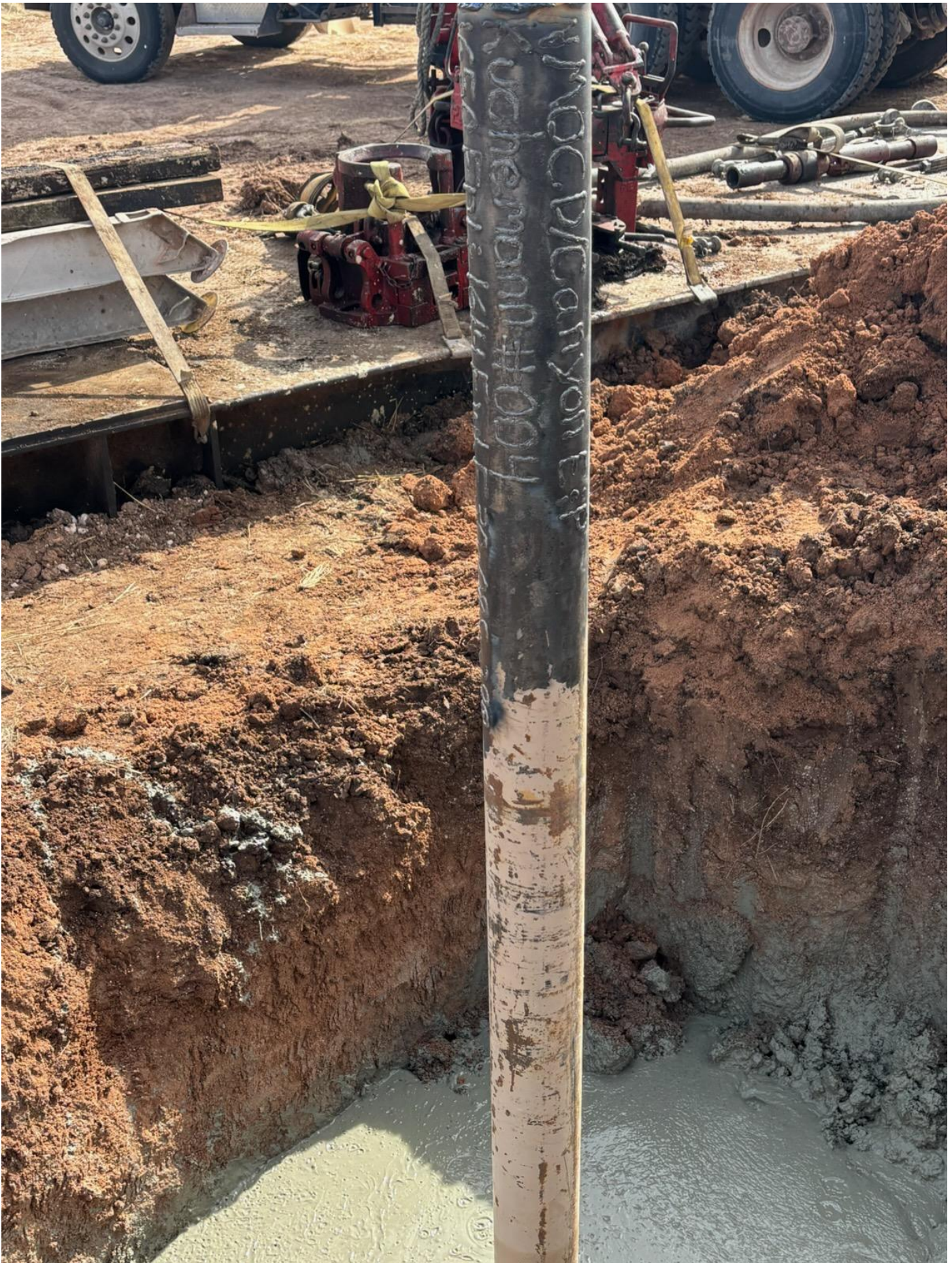
Figure 5: Marker III