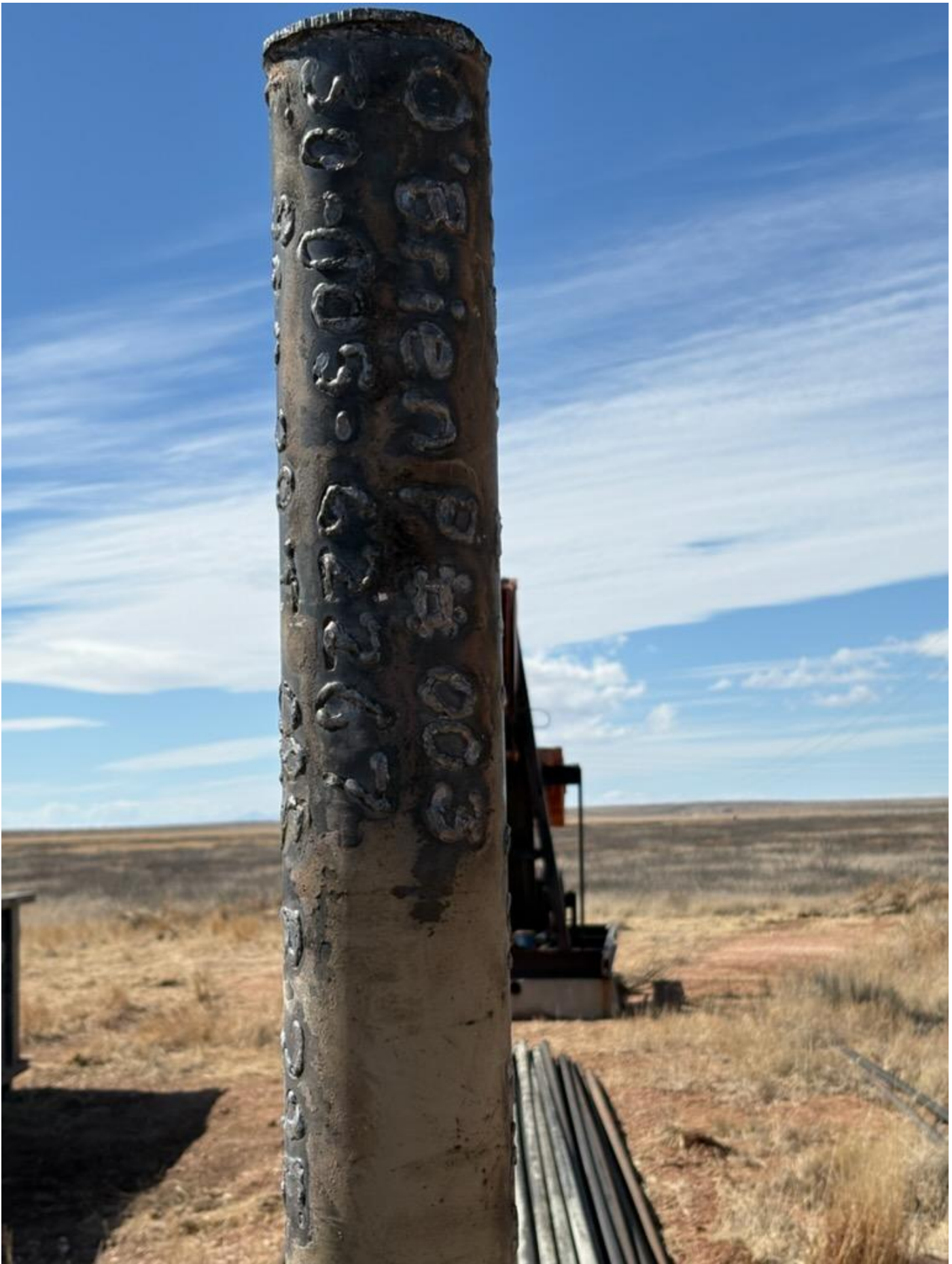
Figure 2: Marker