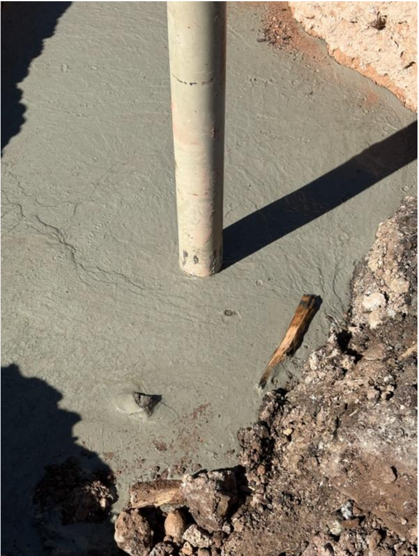
Figure 4: Top Off