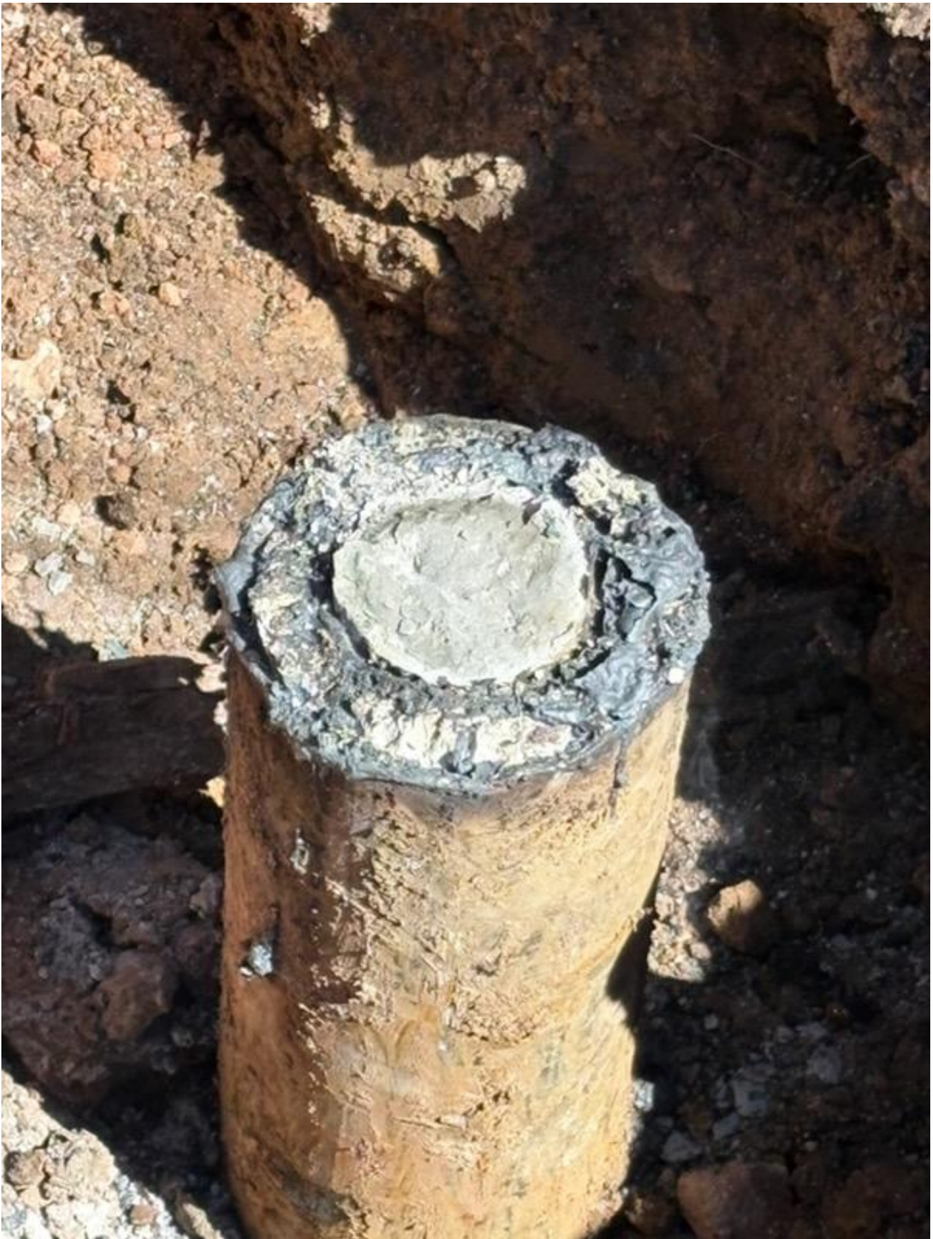
Figure 5: Cut Off