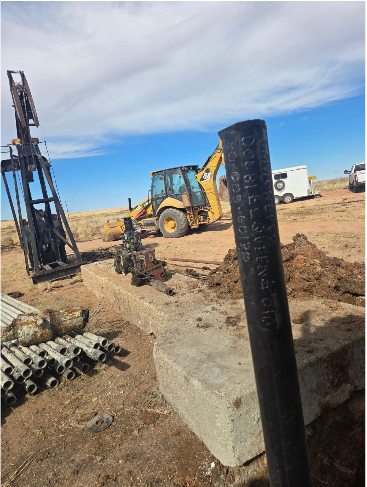
Figure 2: Marker II