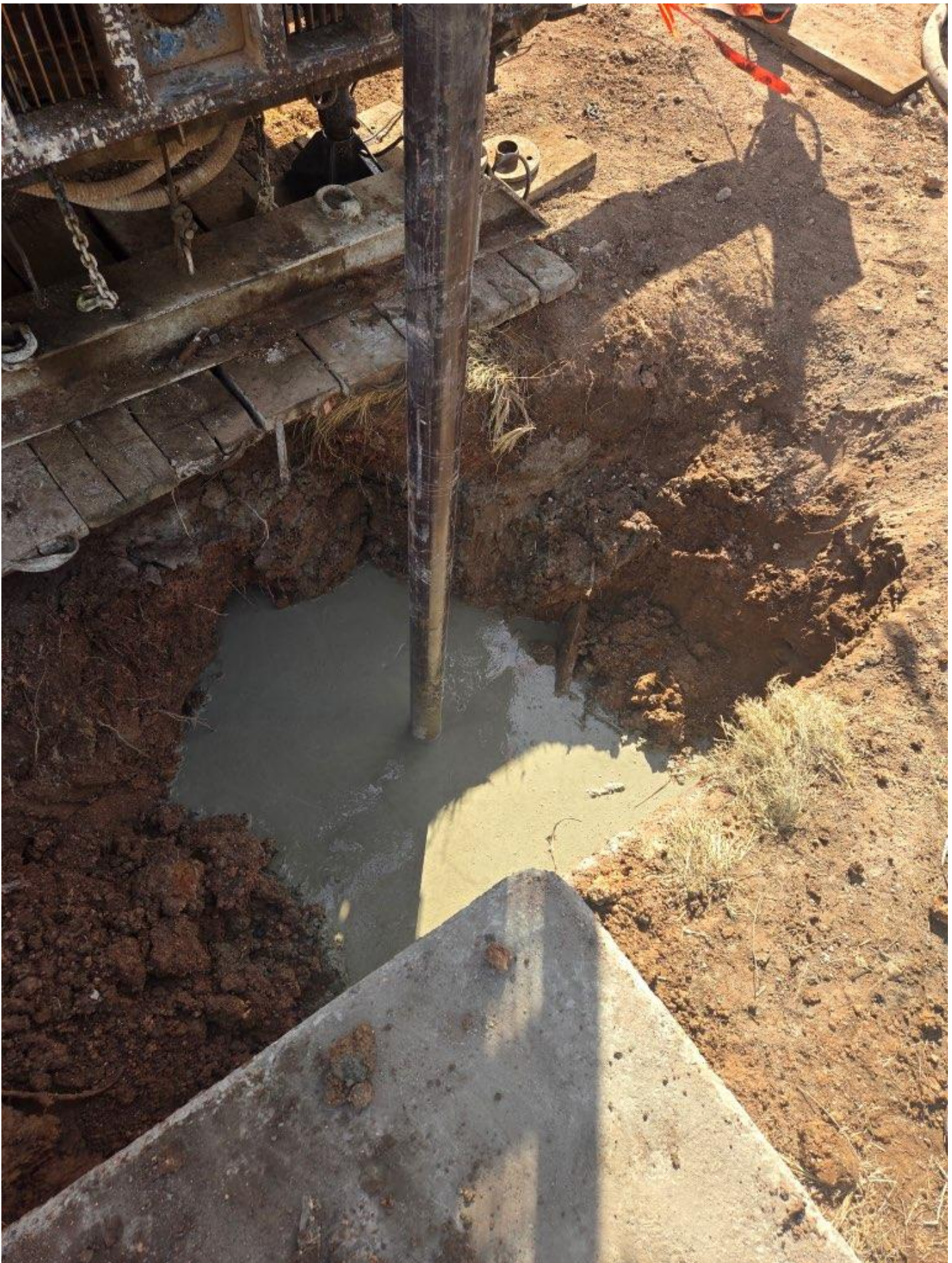
Figure 3: Cellar