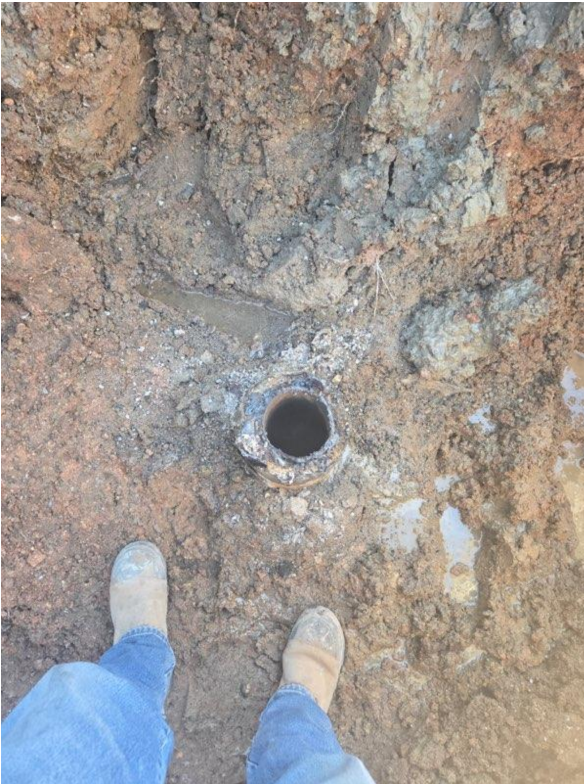
Figure 5: Cut Off