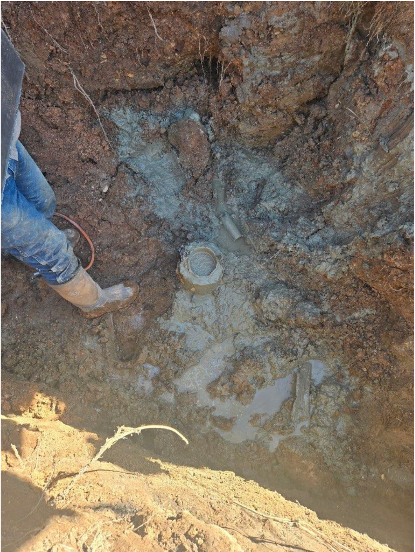
Figure 4: Top Off