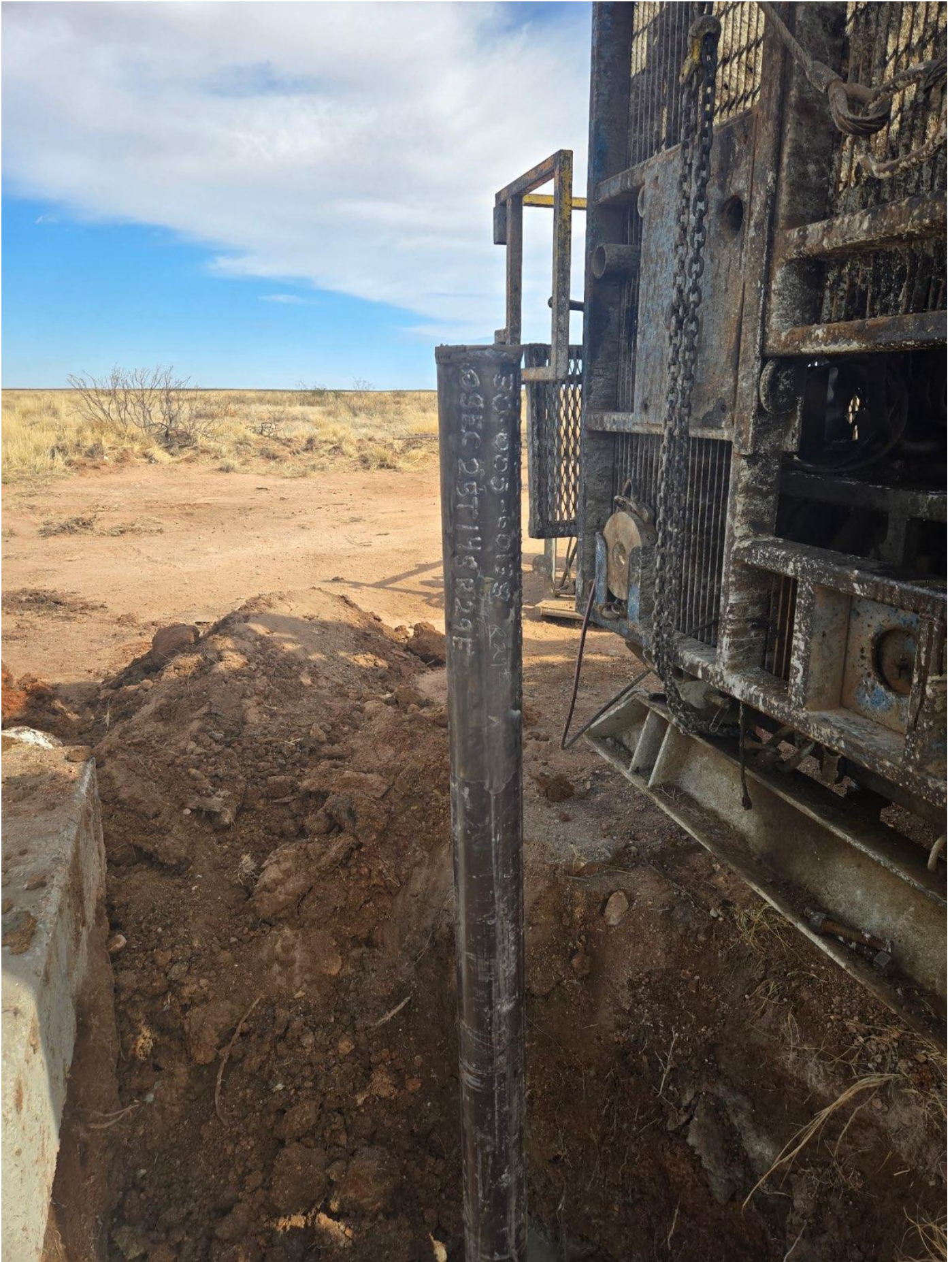
Figure 1: Marker