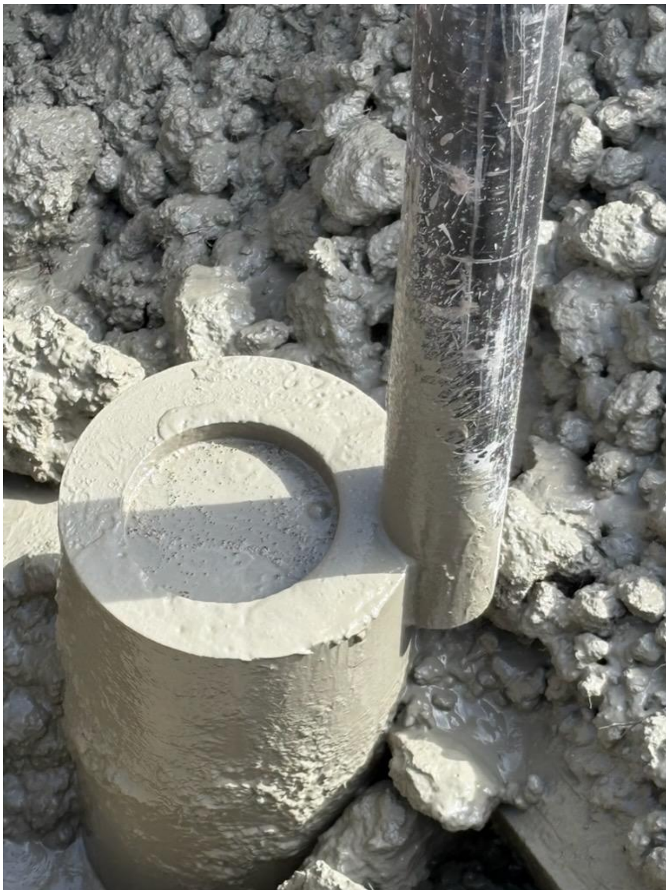
Figure 4: Marker Install