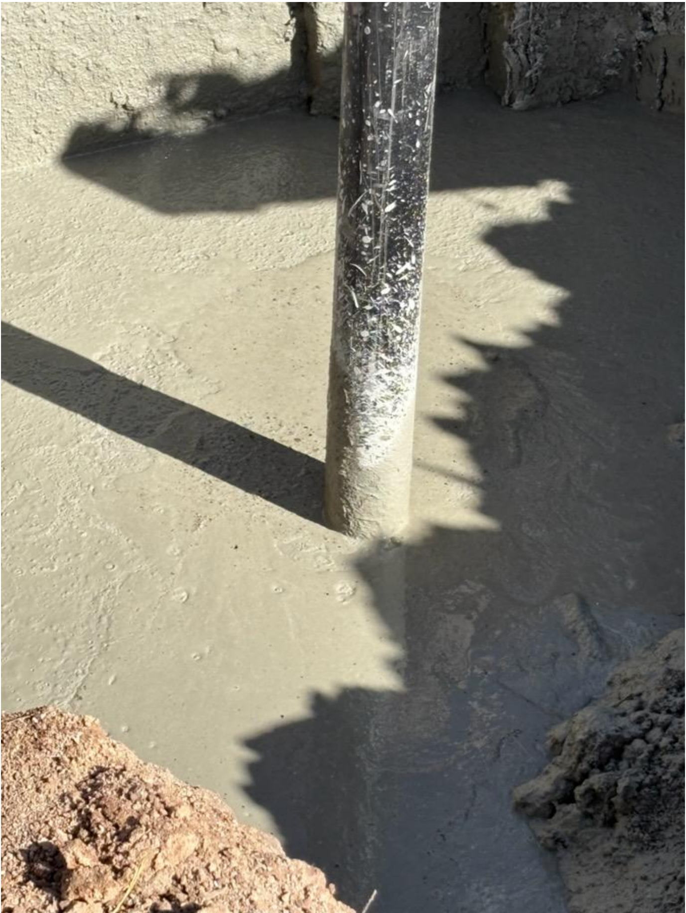
Figure 3: Top Off