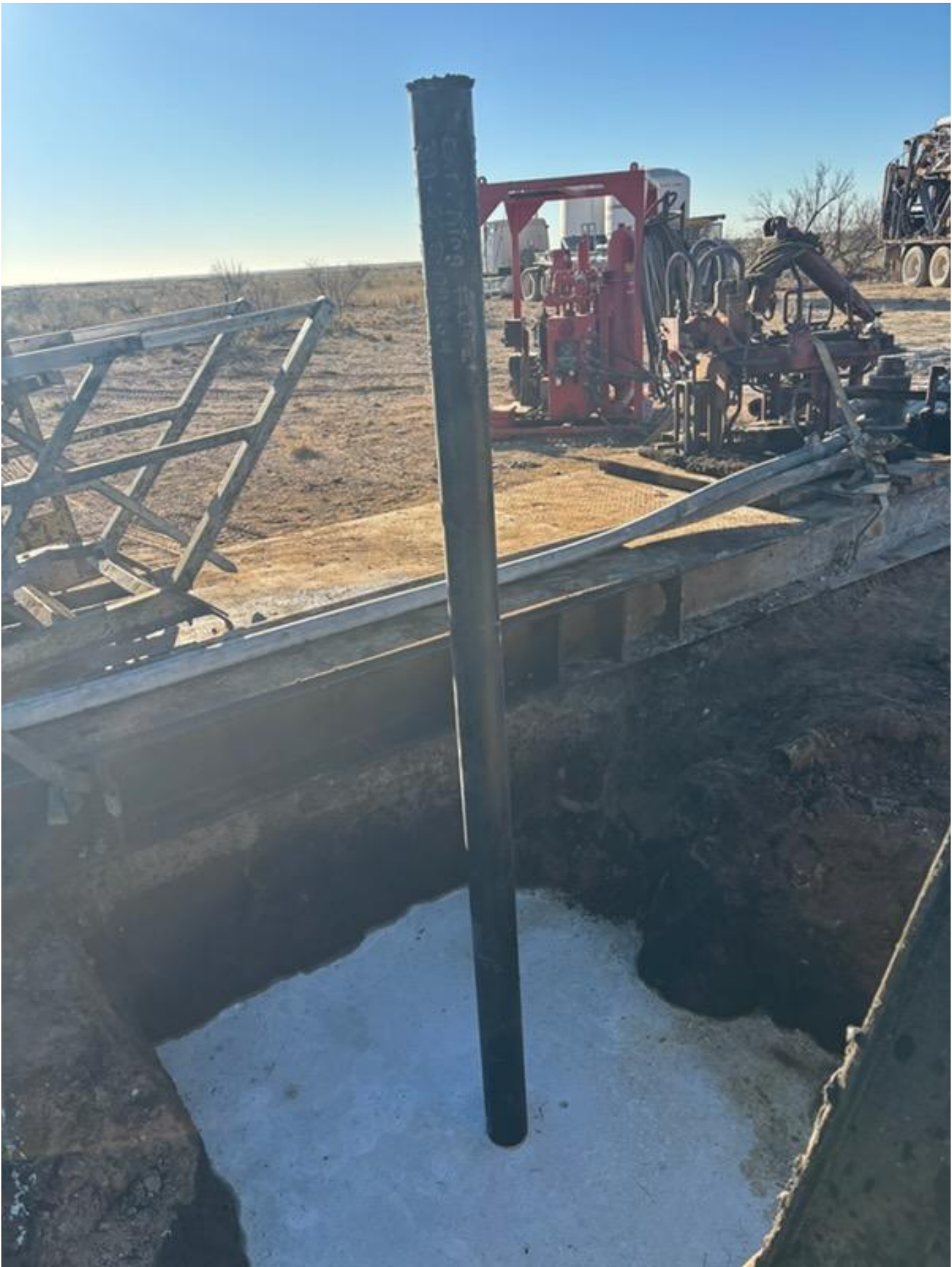
Figure 1: Marker