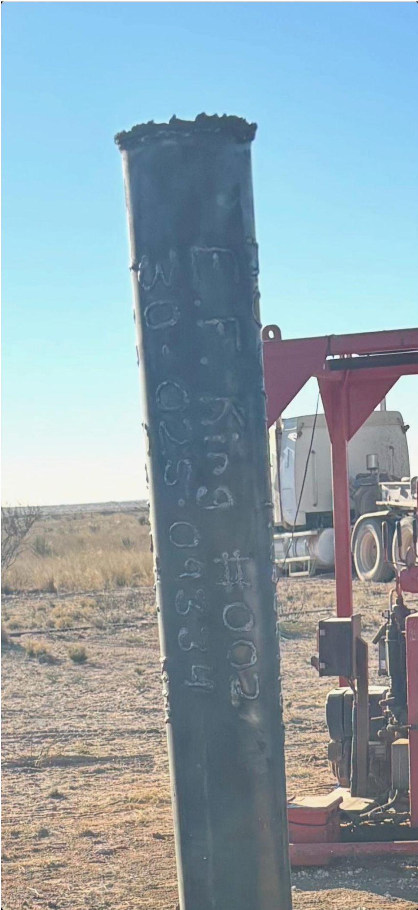
Figure 6: API