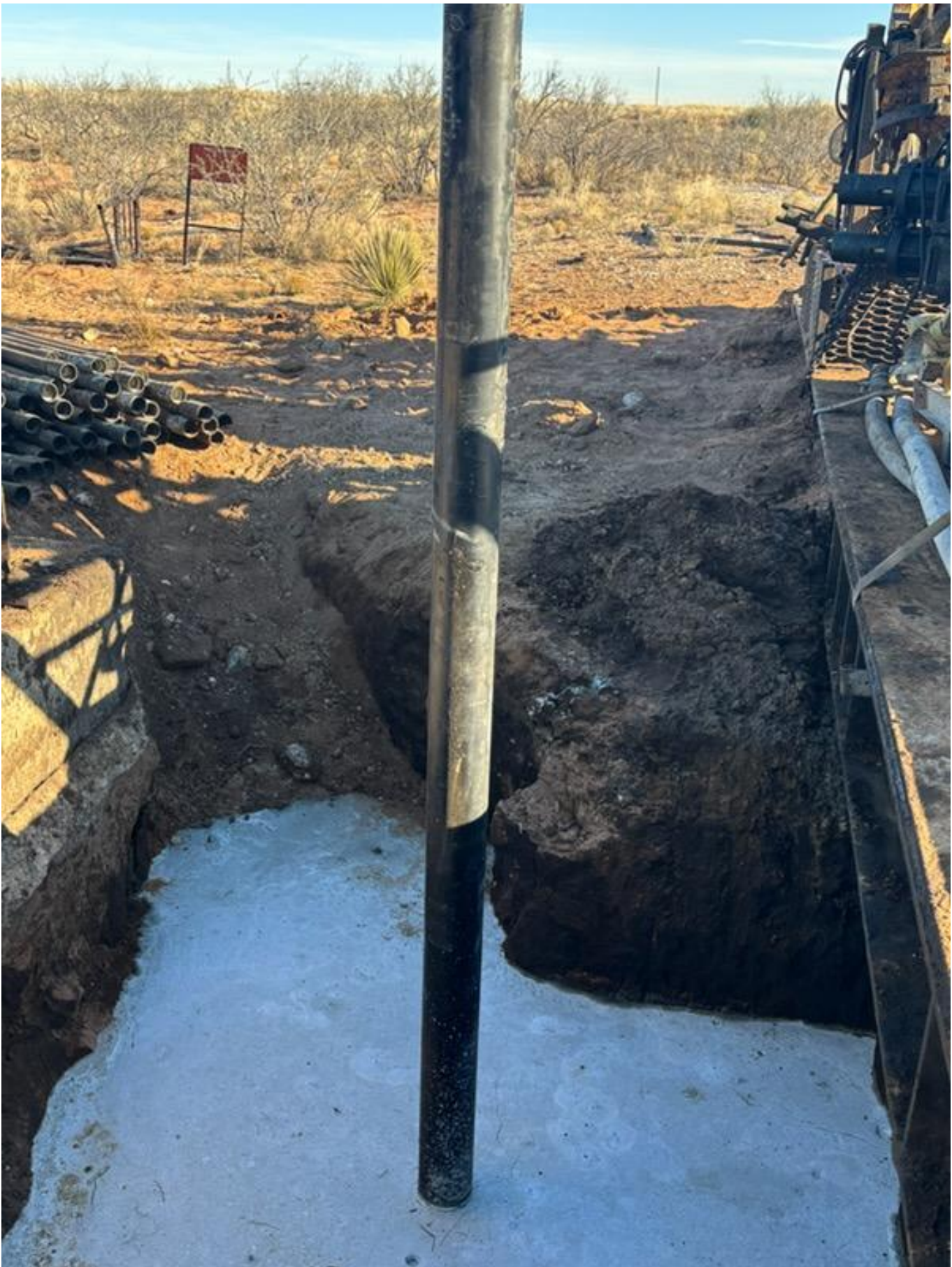
Figure 3: Marker III