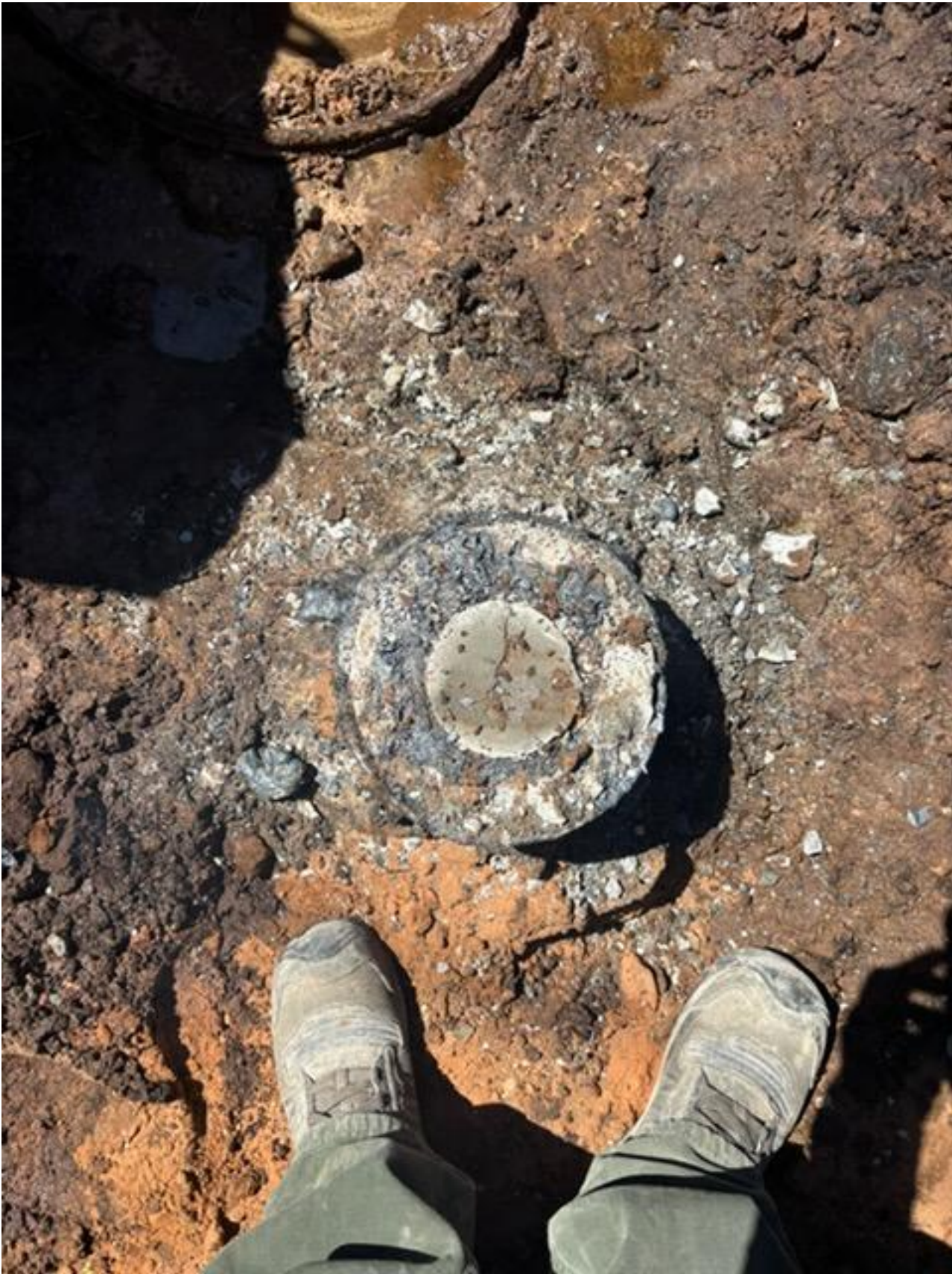
Figure 4: Cut Off