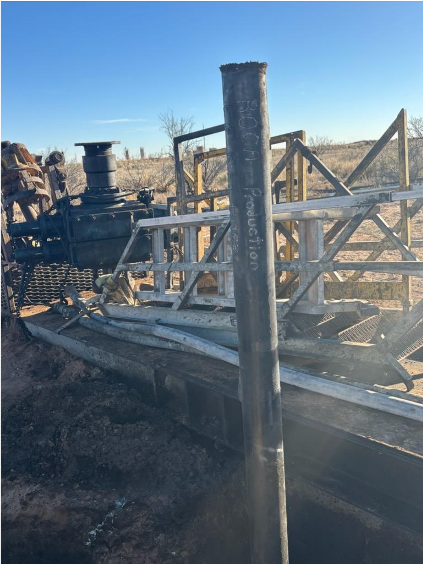
Figure 2: Marker II