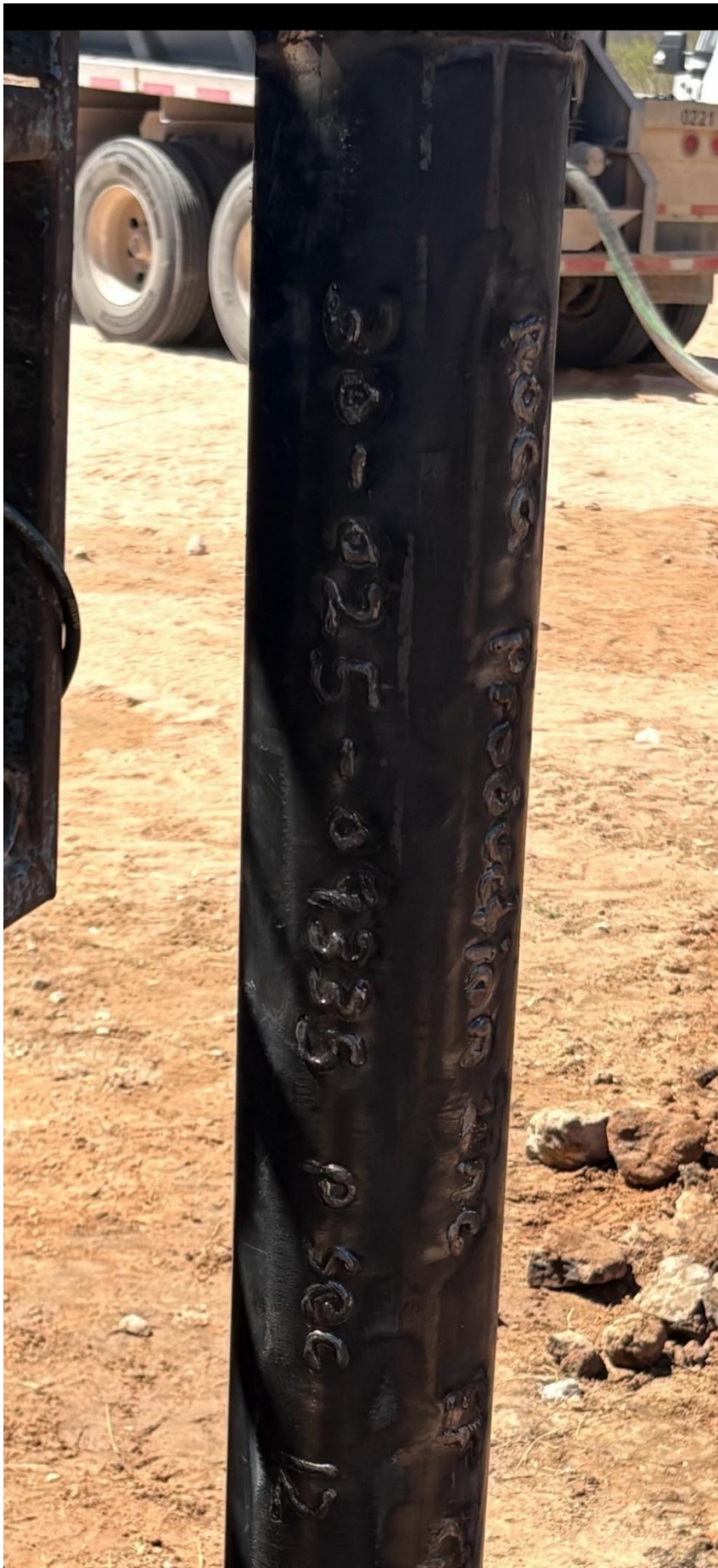
Figure 5: Marker II