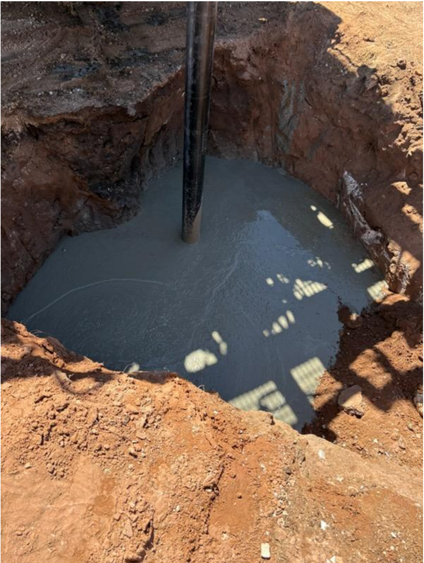
Figure 3: Top Off