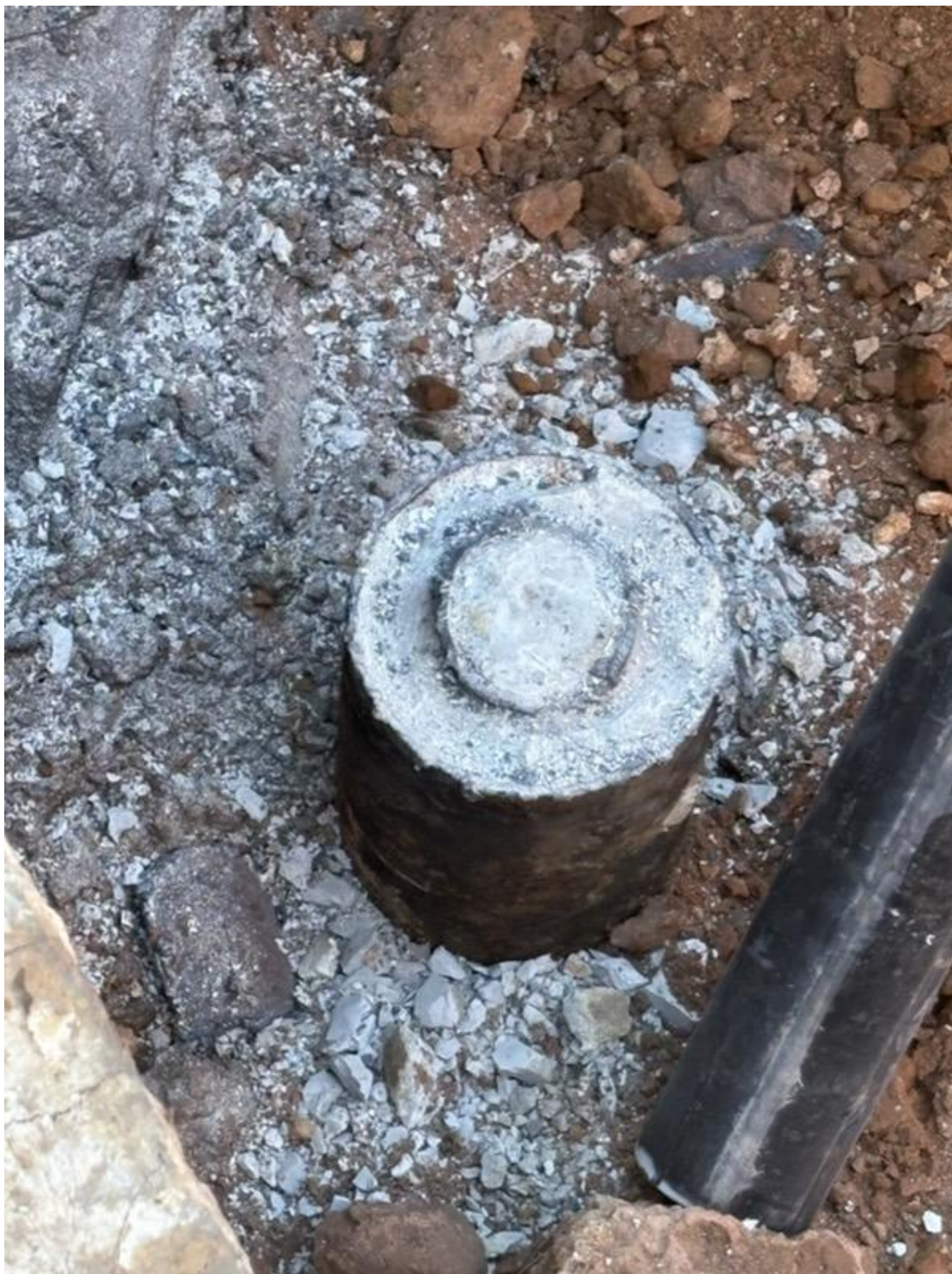
Figure 1: Cut Off