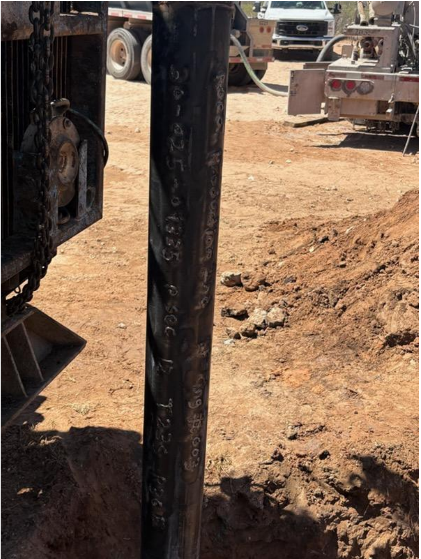
Figure 4: Marker