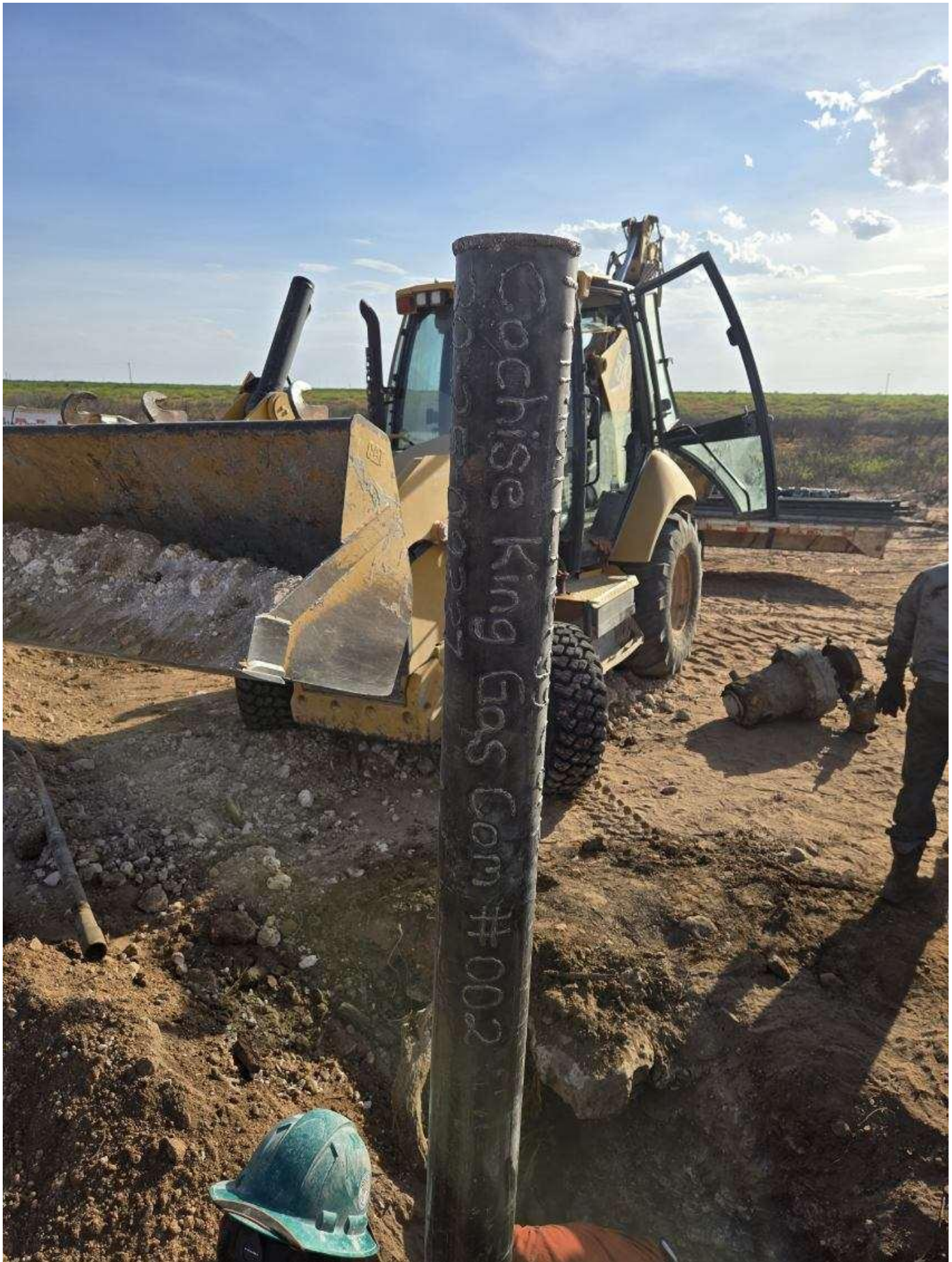
Figure 2: Marker II