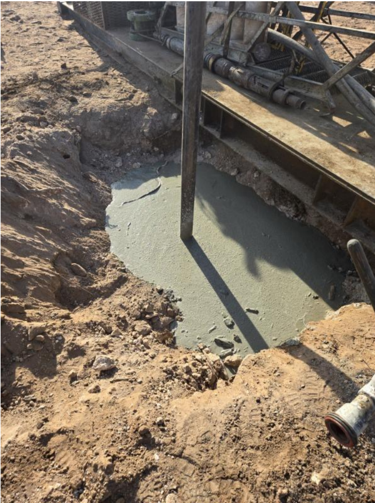
Figure 4: Top Off