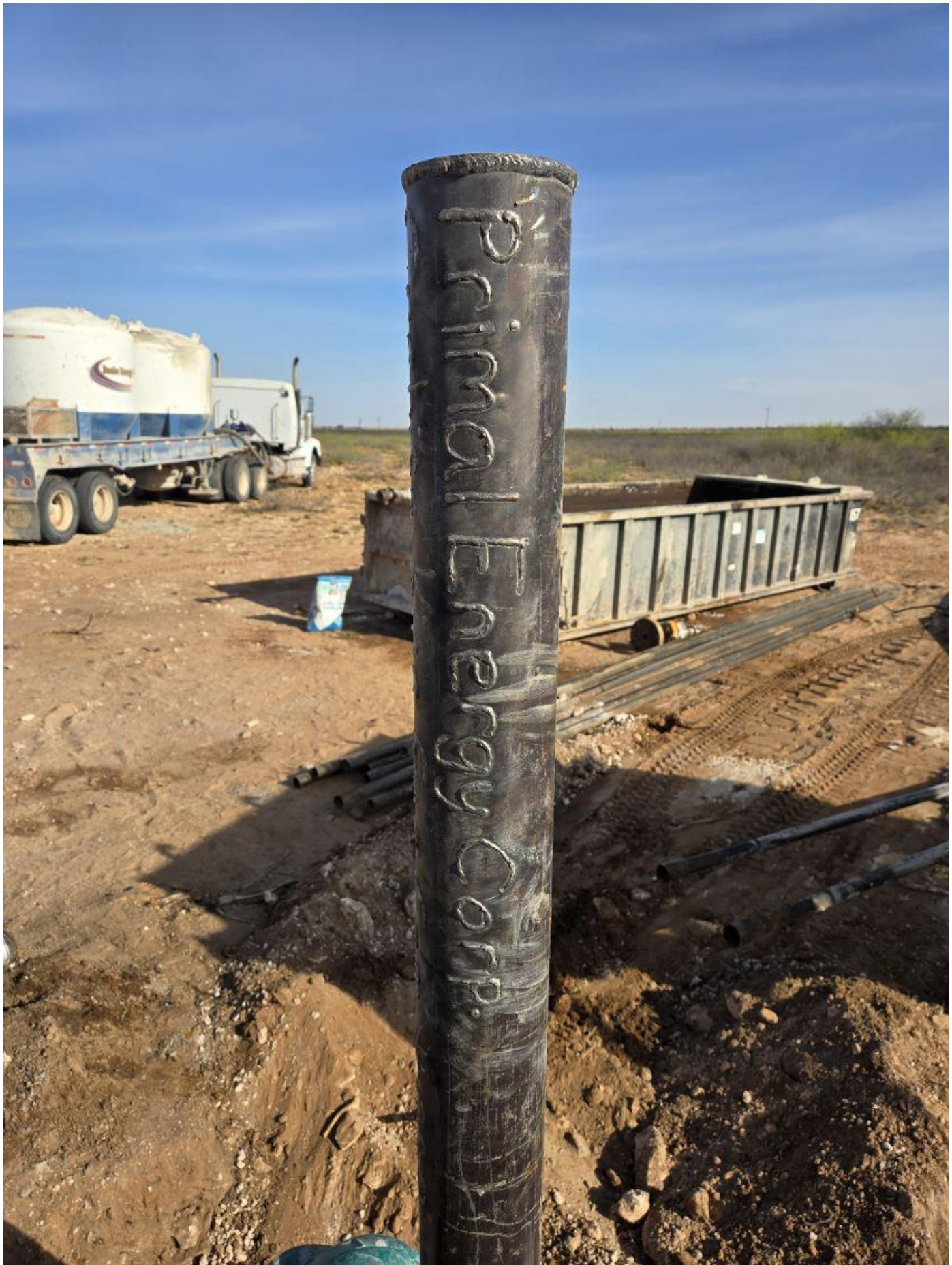
Figure 1: Marker