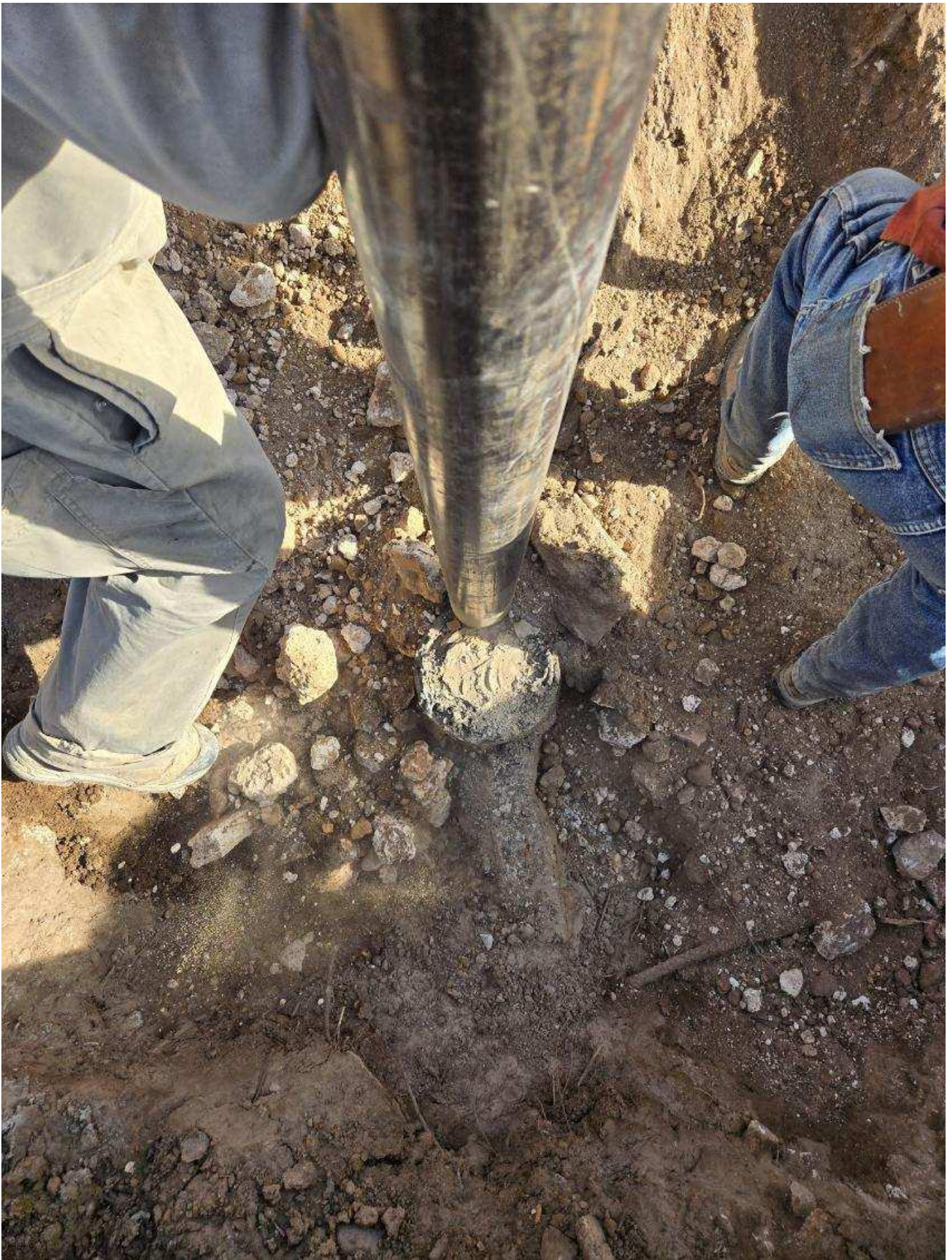
Figure 6: Cut Off