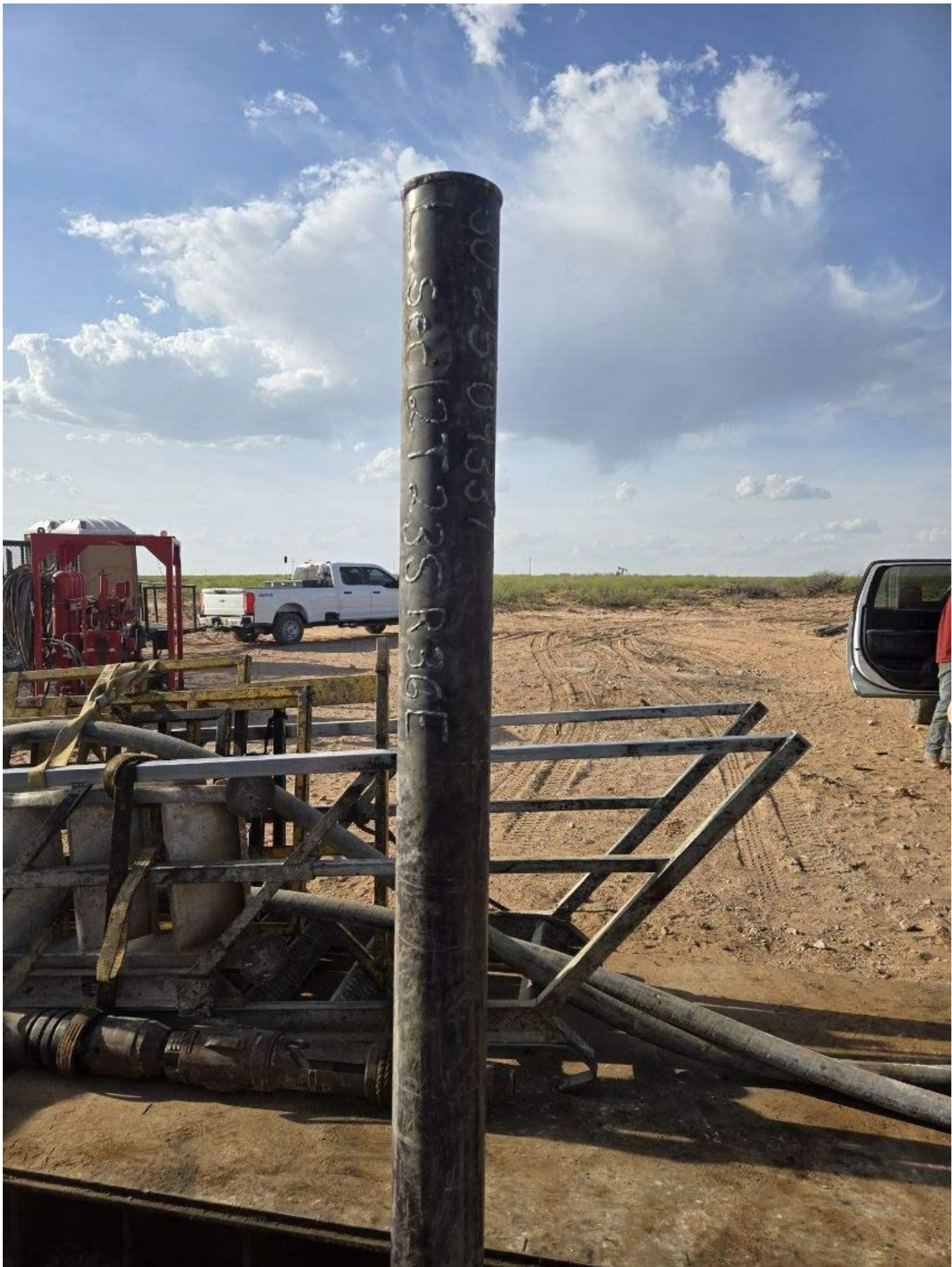
Figure 3: Marker III