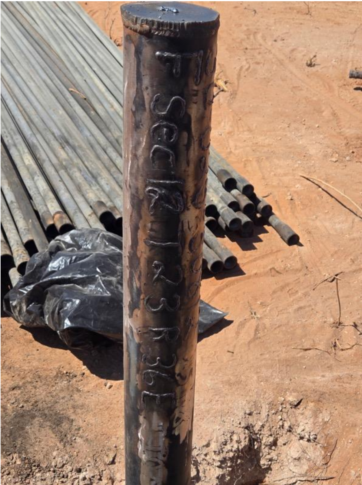
Figure 1: Marker