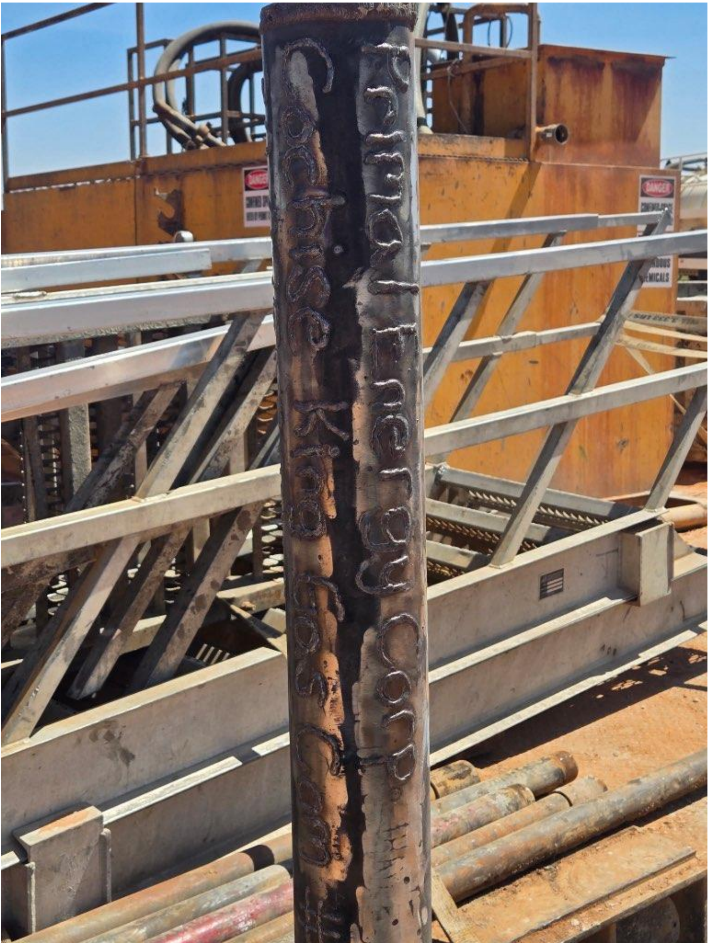
Figure 3: Marker III