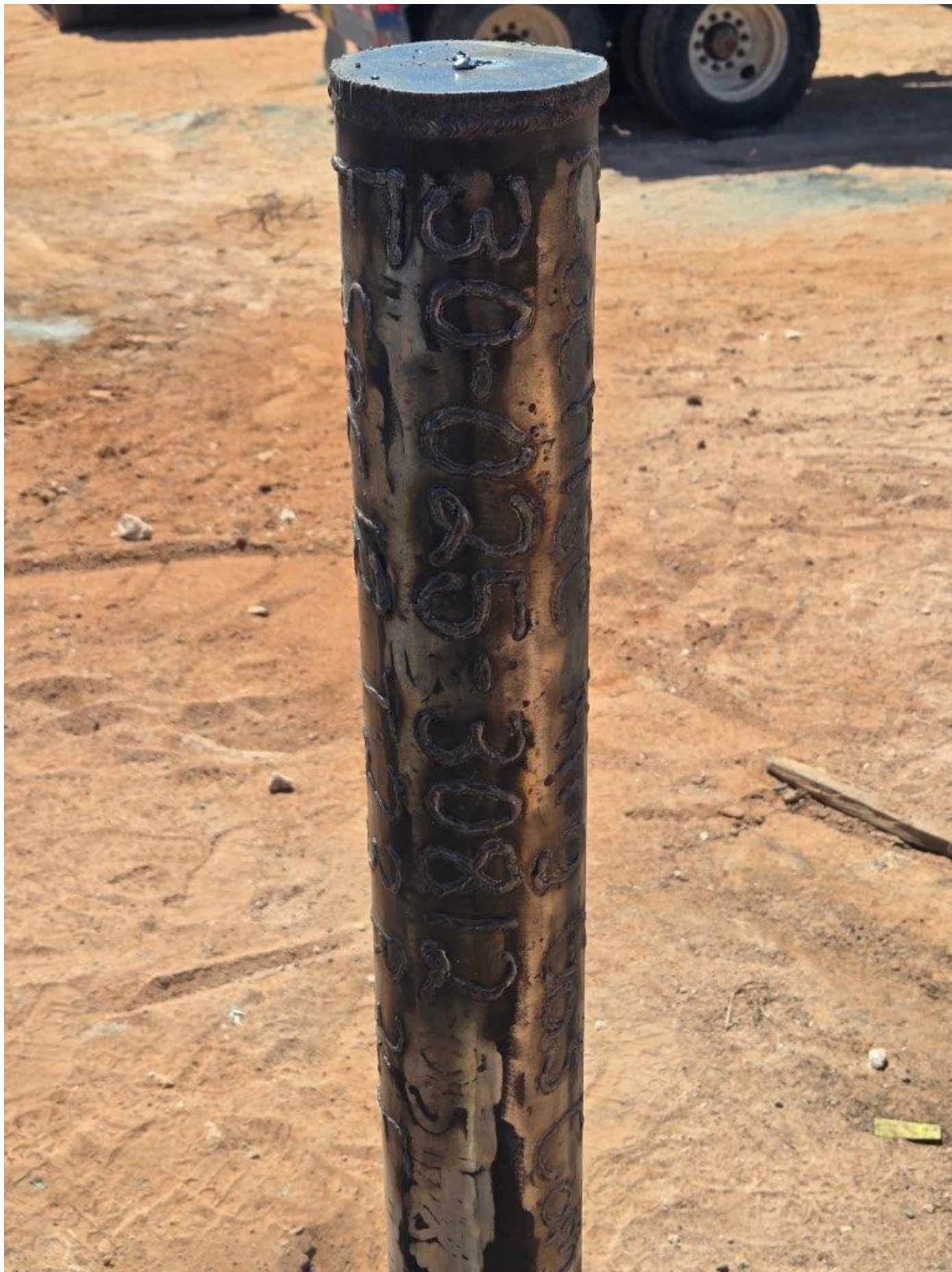
Figure 2: Marker II