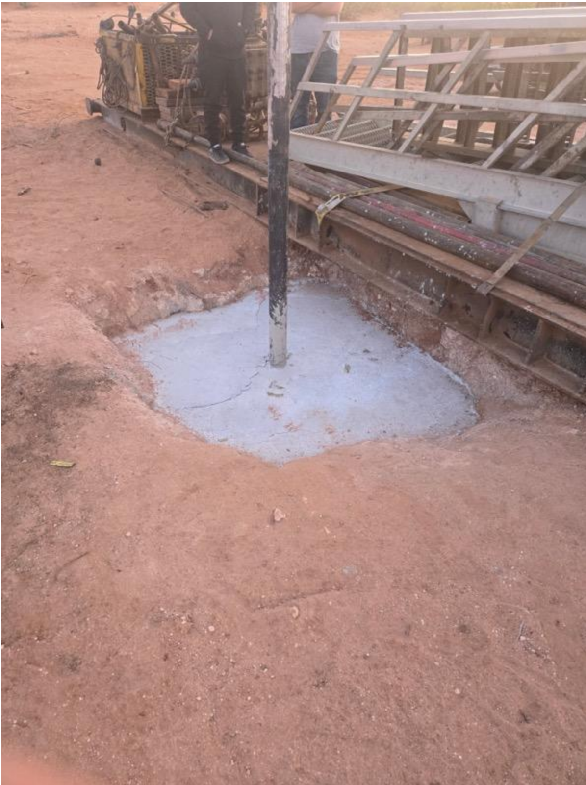
Figure 4: Top Off