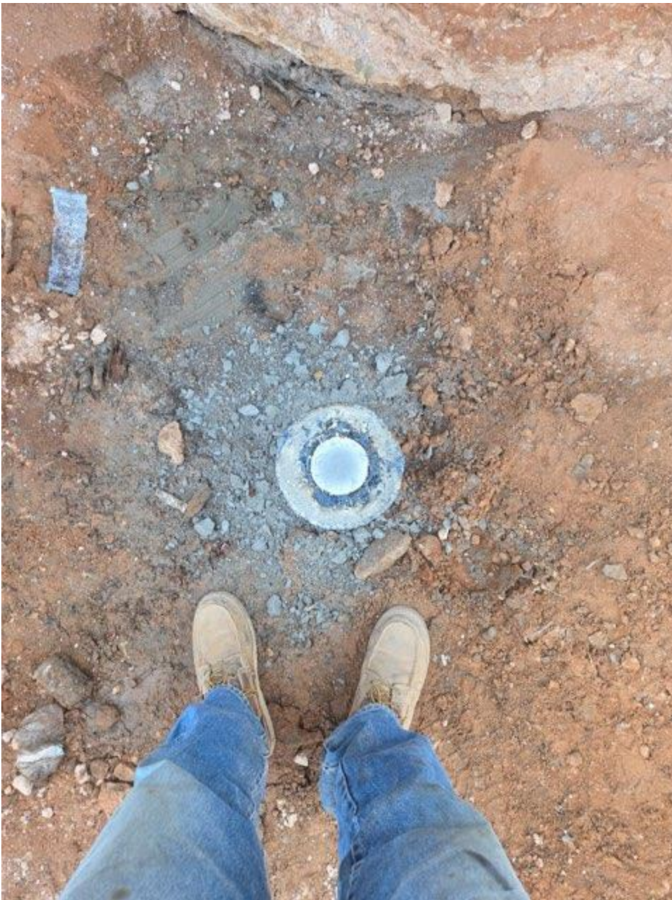
Figure 6: Cut Off