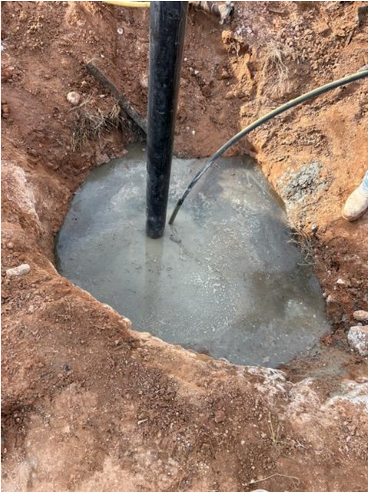
Figure 3: Top Off II