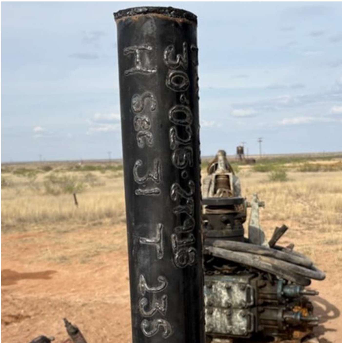
Figure 5: Marker Detail