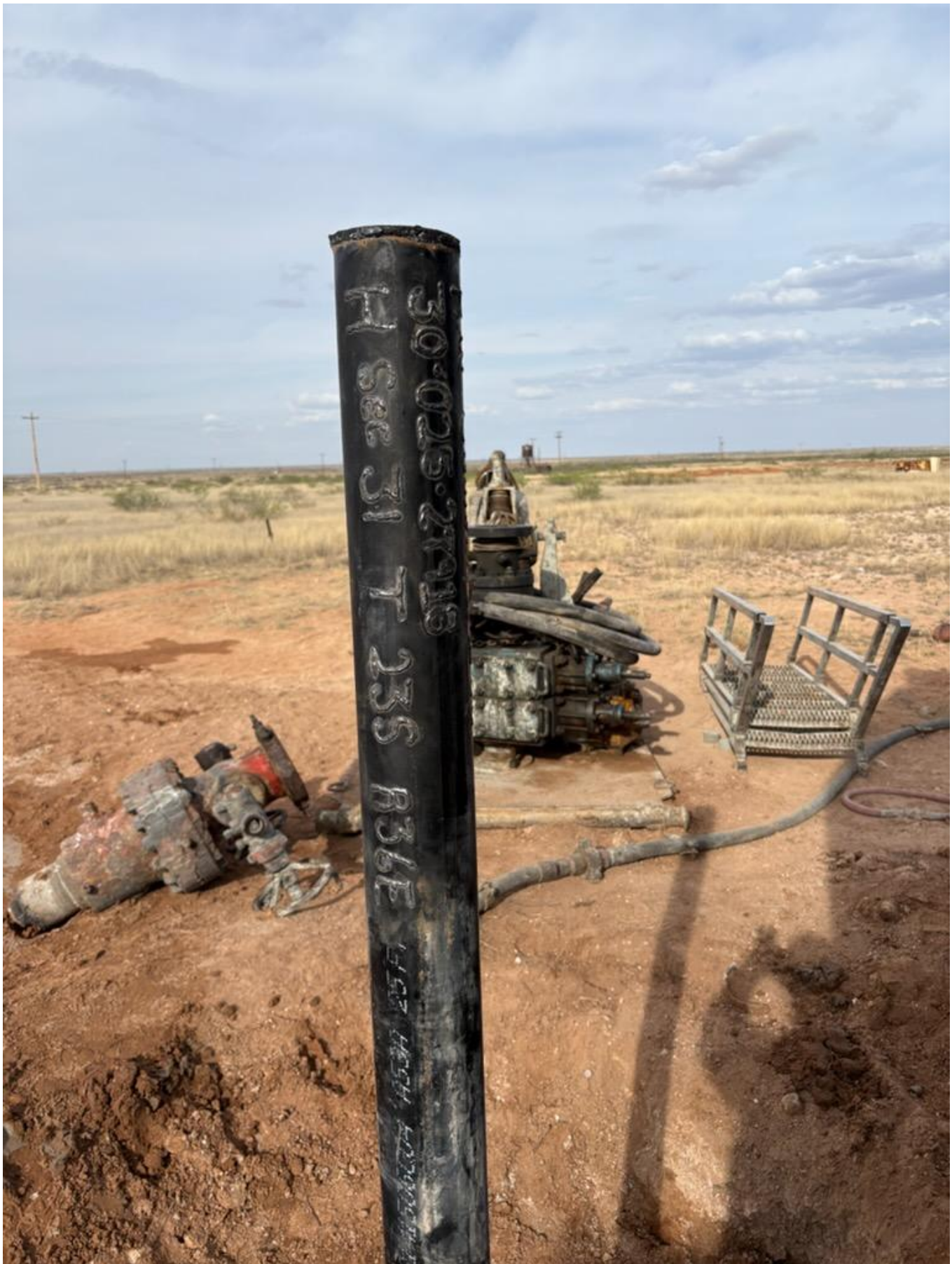
Figure 4: Marker