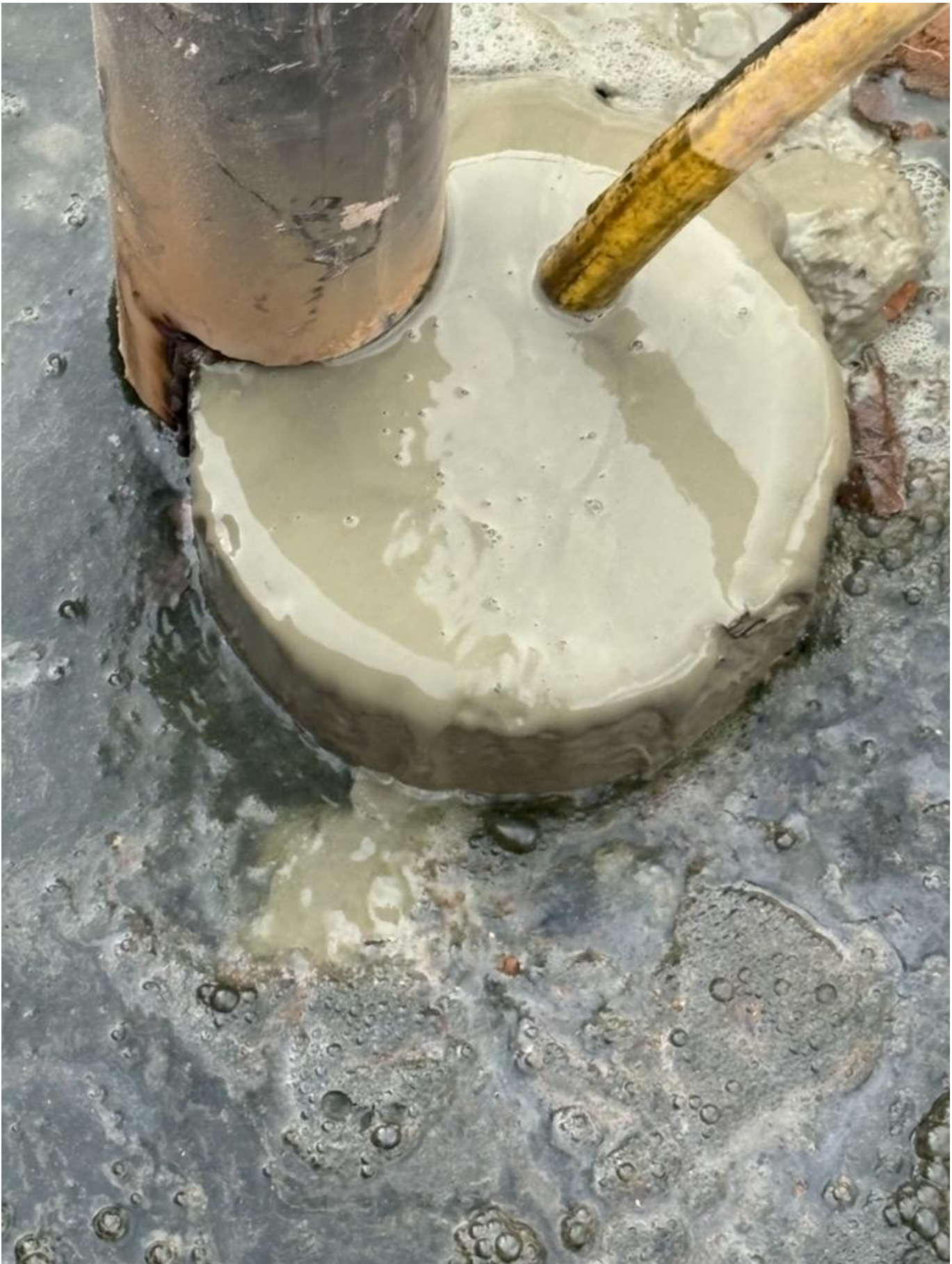
Figure 2: Top Off