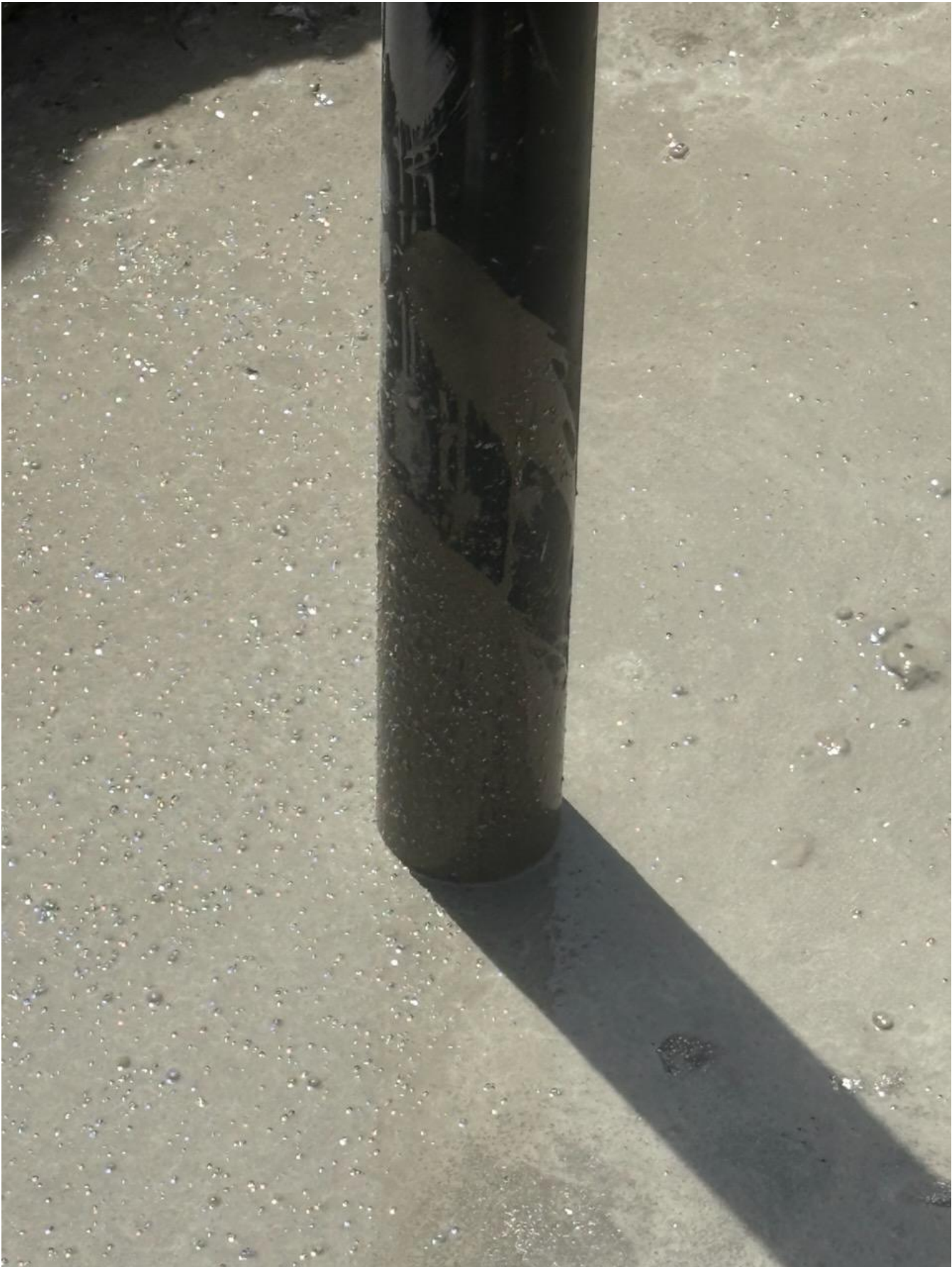
Figure 3: Top Off II