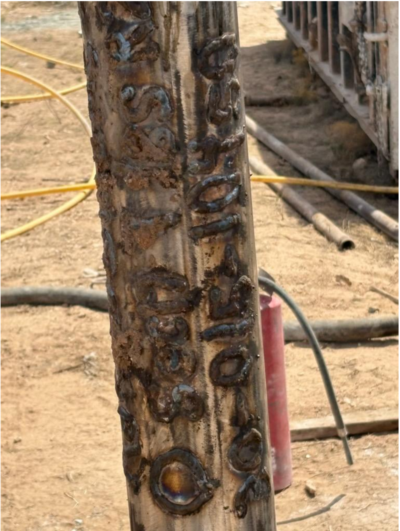
Figure 1: API 30-015-10450