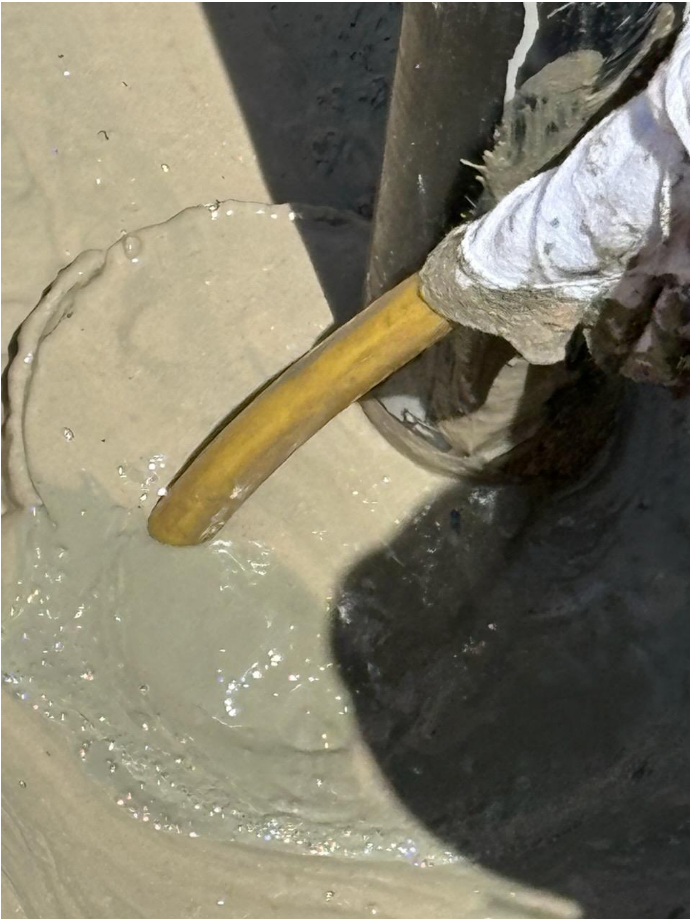
Figure 2: Top Off