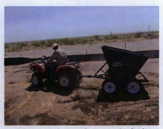
Spreading amendments, facing north 5/30/2013