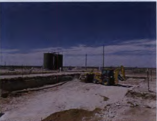
Padding the completed excavation, facing northwest 3/21/2013