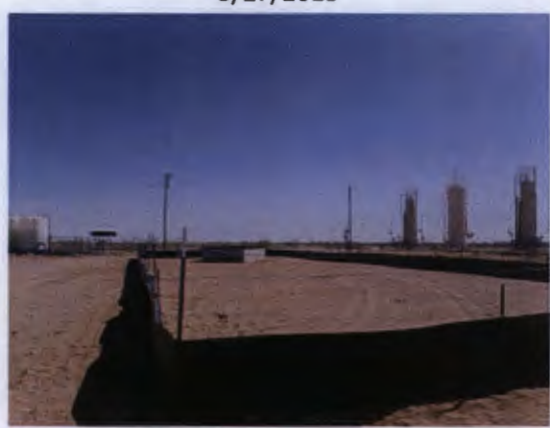
Silt net installed, facing south