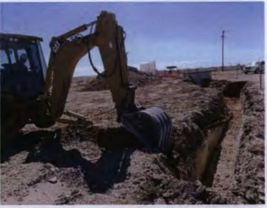
Excavating, facing south