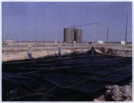
Installing the 20-mil, reinforced liner at approximately 4.5 ft bgs, facing northwest 3/27/2013