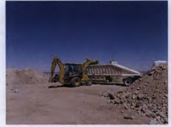
Hauling off spoil pile, facing east