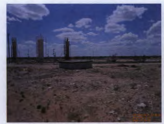
Site prior, facing west