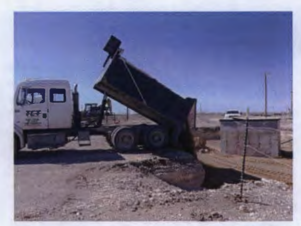
Hauling in blow sand, facing south 3/25/2013