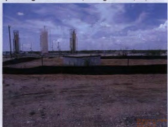
Site complete with vegetation starting to grow, facing west 7/31/2013