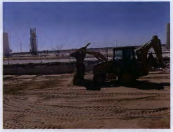
Padding excavation, facing west