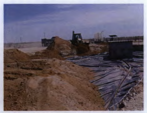
Backfilling, facing east