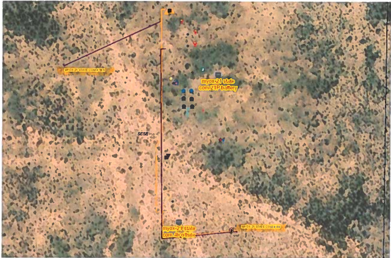
MYOX 21 STATE COM 4H & 58H