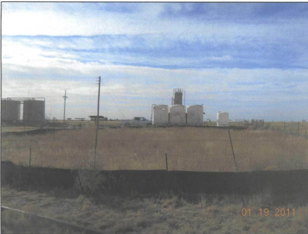
Figure 6 – Vac K-35-1 view south across affected surface following surface restoration, January 2011.