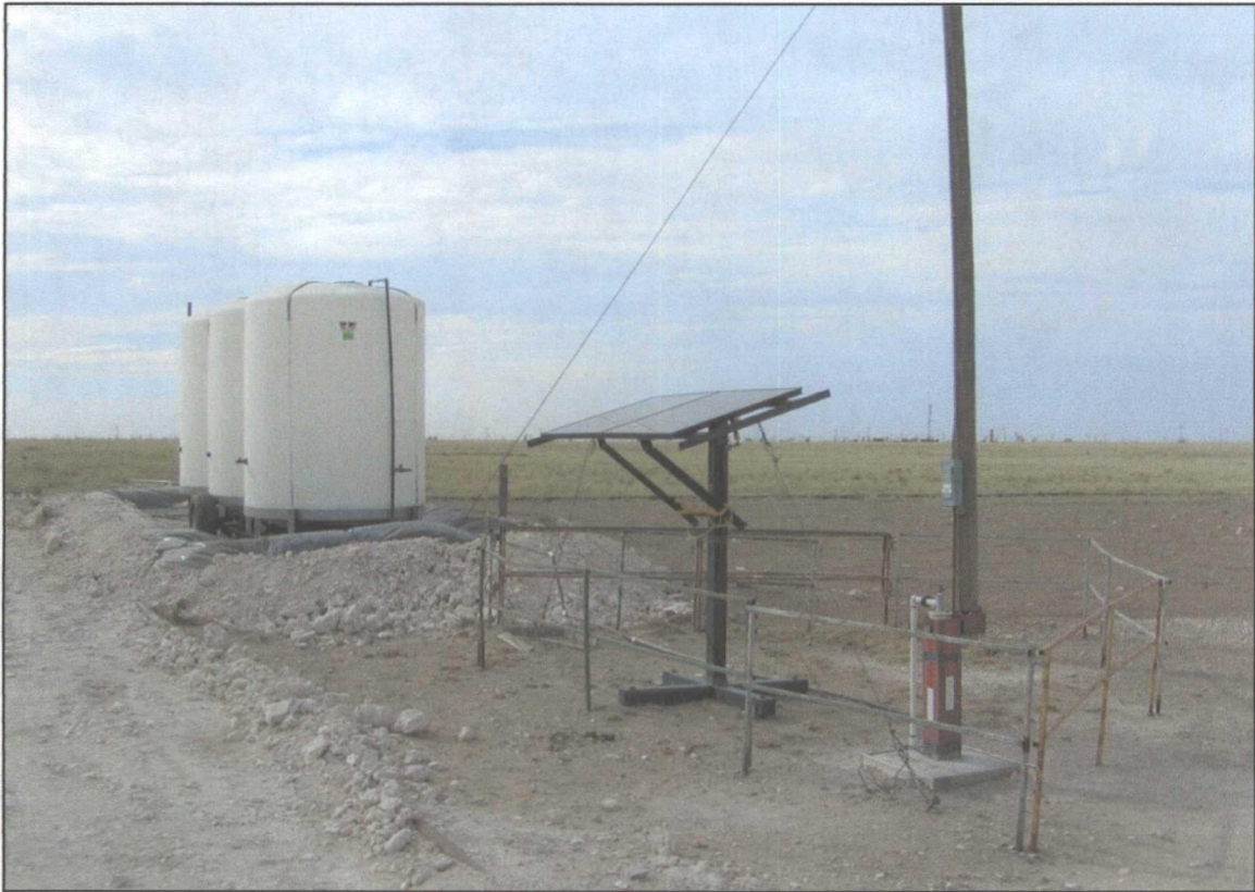
Figure 3 – Vac K-35-1 solar-powered groundwater recovery system.