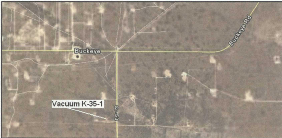
Figure 1 – Vac K-35-1 location.