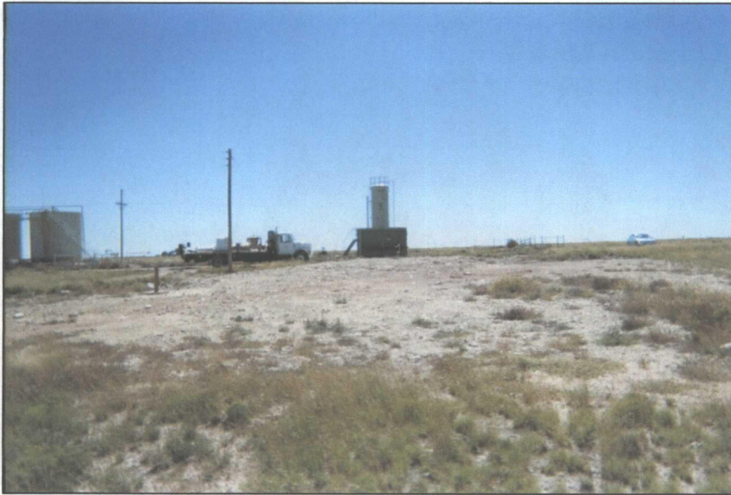
Figure 5 – Vac K-35-1 view south across affected surface before restoration efforts, October 2006.