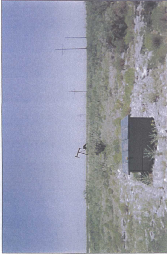
undisturbed junction box