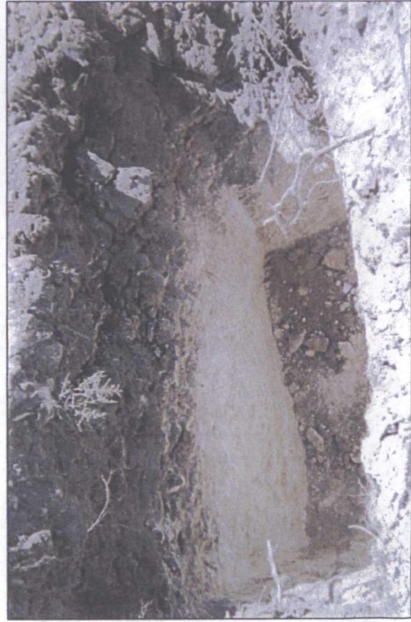
delineation trench at former box site