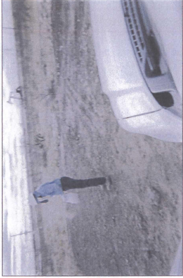
seeding backfilled site