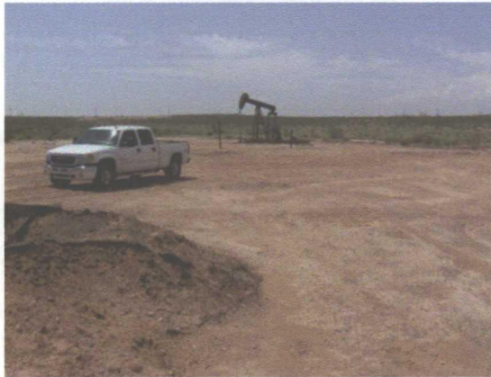
Photograph 3. Area Around Pit #1

contamination. The area will then be regraded so as to divert water runoff, thereby preventing erosion of the downgradient road.