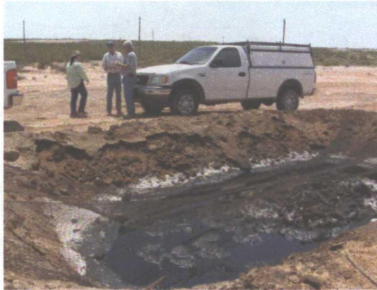
Photograph 1. Pit #1 on Ramapo #1 Site