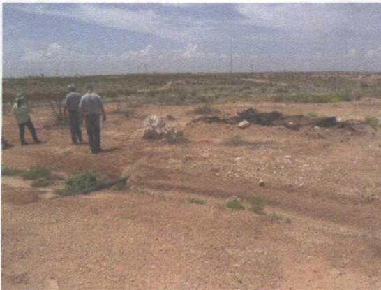
Photograph 4. Area Around Pit #2

The soil in the area around Pit #2 (see Photograph 4 below) is contaminated with chloride and hydrocarbons. RESPEC will oversee the removal of this contaminated soil to a depth of 1 to 2 feet. The contaminated soil will be removed from the site and taken to a waste facility approved by the OCD and will be replaced with soil free from contamination. The area will then be regraded so as to divert water runoff, thereby preventing erosion of the road. In the process of soil removal and regrading, RESPEC will make sure that the two buried pipelines in this area (one possibly for fresh water) are not damaged or disturbed. Photograph 5 below shows an exposed pipeline. The area around Pit #2 will be seeded with grass and watered.