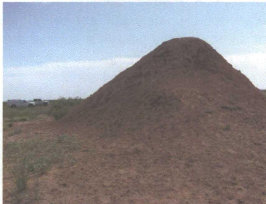
Photograph 8. Stockpile of Soil for Backfill

Both pits will be backfilled with soil from an existing stockpile on the site (see Photograph 8 below). The roadway will be restored by means of a grader. All barren areas, including the backfilled pits, will be seeded with grass and watered.