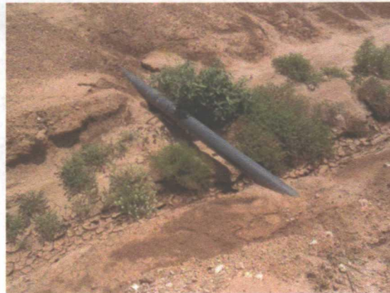
Photograph 5. One of Two Buried Pipelines