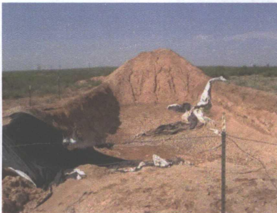
Photograph 6. Primary Pit

The West White Ranch #2 site is on gated private property belonging to Mr. Clay Boyd (reachable by telephone 432-685-1022 and by e-mail at c777boyd@aol.com ). The site is located at H-1-12S-28E 1836 FNL, 660 FEL, in Chaves County, east-southeast of Roswell, south of U.S. Highway 380 to Tatum. On the site are a primary (main) pit, which measures approximately 90 feet by 50 feet at the surface (see Photograph 6 below), and an emergency pit with a surface area of approximately 100 square feet (see Photograph 7 below). There are also roadways that may require some work with a grader to make them suitable for truck traffic.