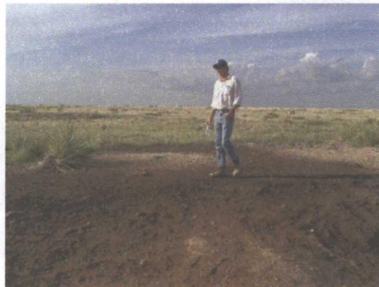
Photograph 10. Contaminated Soil at Pogo State #2 Site

Contaminated soil around the pit and elsewhere on the site (see Photograph 10 below) will be removed to a depth of 1 to 2 feet. The contaminated soil will be removed from the site and taken to a waste facility approved by the OCD. The area will then be regraded, seeded with grass, and watered.