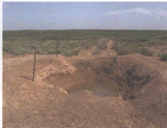
Photograph 7. Emergency Pit

RESPEC will delineate the soil contamination with OCD-recommended field testing. The levels of contamination will, of course, determine the amount of soil to be removed (see Task 12 below).