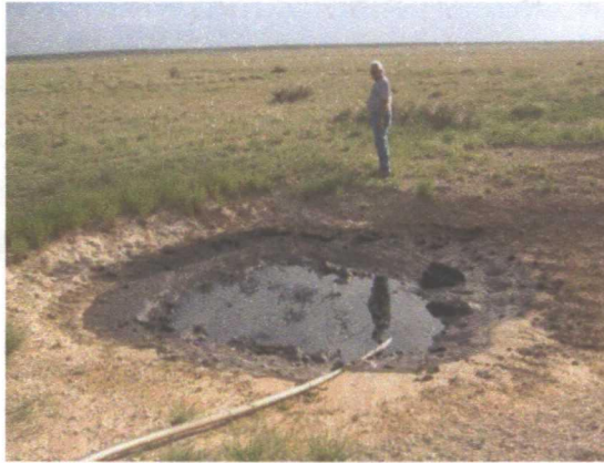
Photograph 9. Shallow Pit at Pogo State #2 Site