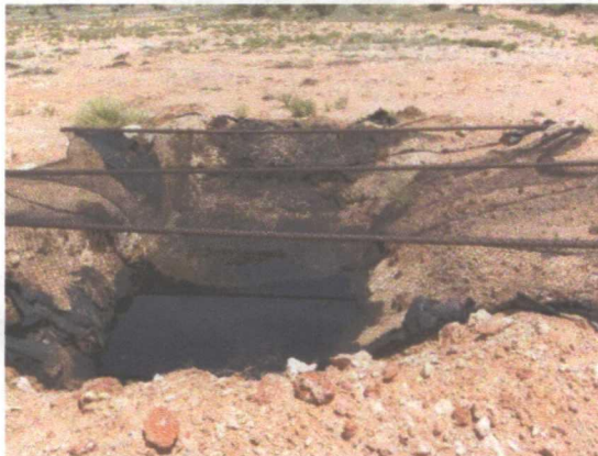
Photograph 2. Pit #1 on Ramapo #1 Site

Pit #2 (see Photograph 2 below) measures approximately 20 feet by 20 feet at the surface and has an unknown depth. RESPEC's subcontractor will muck out Pit #2 to a depth of 8 to 10 feet and backfill it with soil free from contamination. All contaminated soil will be removed from the site and taken to a waste facility approved by the OCD.