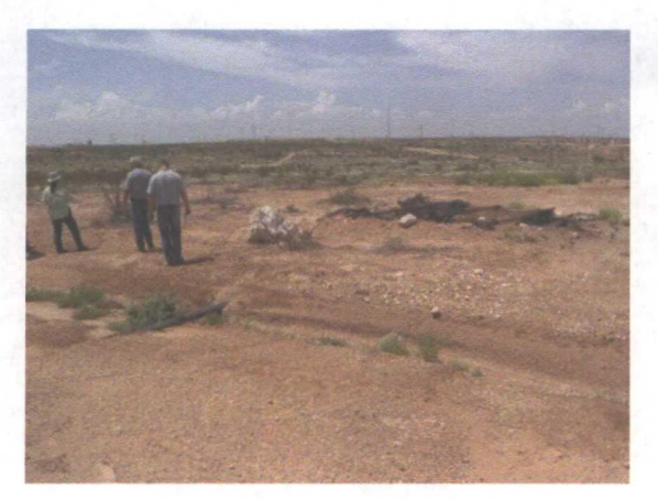
Photograph 4. Area Around Pit #2

The soil in the area around Pit #2 (see Photograph 4 below) is contaminated with chloride and hydrocarbons. RESPEC will oversee the removal of this contaminated soil to a depth of 1 to 2 feet. The contaminated soil will be removed from the site and taken to a waste facility approved by the OCD and will be replaced with soil free from contamination. The area will then be regraded so as to divert water runoff, thereby preventing erosion of the road. In the process of soil removal and regarding, RESPEC will make sure that the two buried pipelines in this area (one possibly for fresh water) are not damaged or disturbed. Photograph 5 below shows an exposed pipeline. The area around Pit #2 will be seeded with grass and watered.