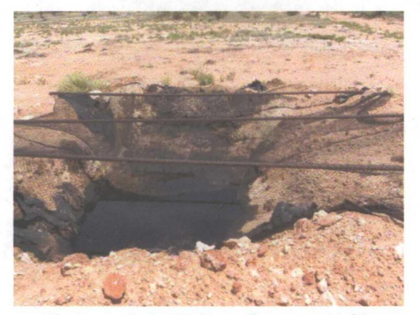
Photograph 2. Pit #1 on Ramapo #1 Site

Pit #2 (see Photograph 2 below) measures approximately 20 feet by 20 feet at the surface and has an unknown depth. RESPEC's subcontractor will muck out Pit #2 to a depth of 8 to 10 feet and backfill it with soil free from contamination. All contaminated soil will be removed from the site and taken to a waste facility approved by the OCD.