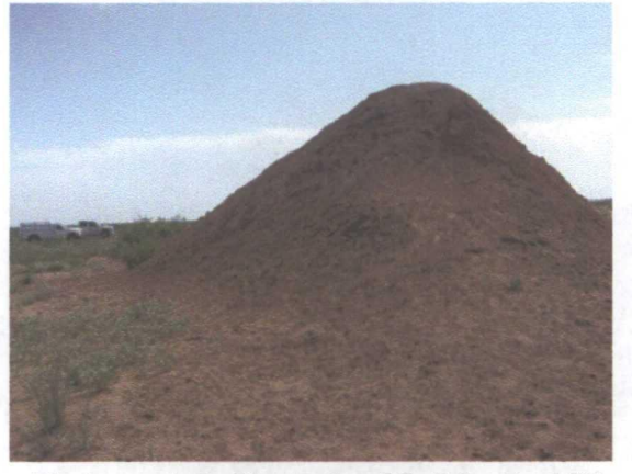
Photograph 8. Stockpile of Soil for Backfill

Both pits will be backfilled with soil from an existing stockpile on the site (see Photograph 8 below). The roadway will be restored by means of a grader. All barren areas, including the backfilled pits, will be seeded with grass and watered.