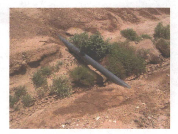
Photograph 5. One of Two Buried Pipelines