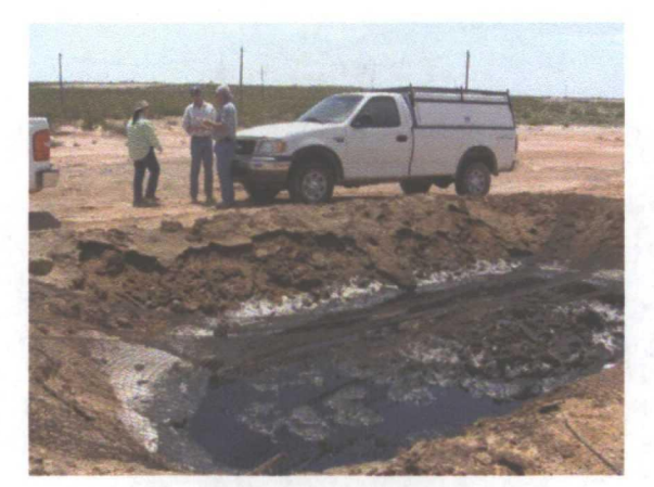
Photograph 1. Pit #1 on Ramapo #1 Site