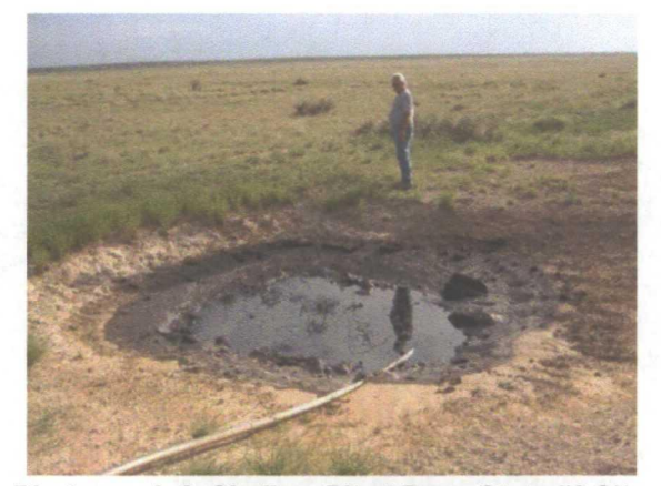
Photograph 9. Shallow Pit at Pogo State #2 Site