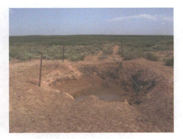
Photograph 7. Emergency Pit