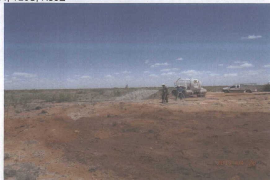
Watering seeded site, facing northeast