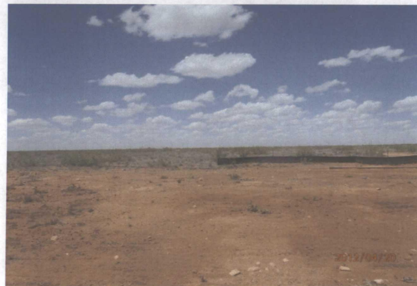
Site complete, facing north