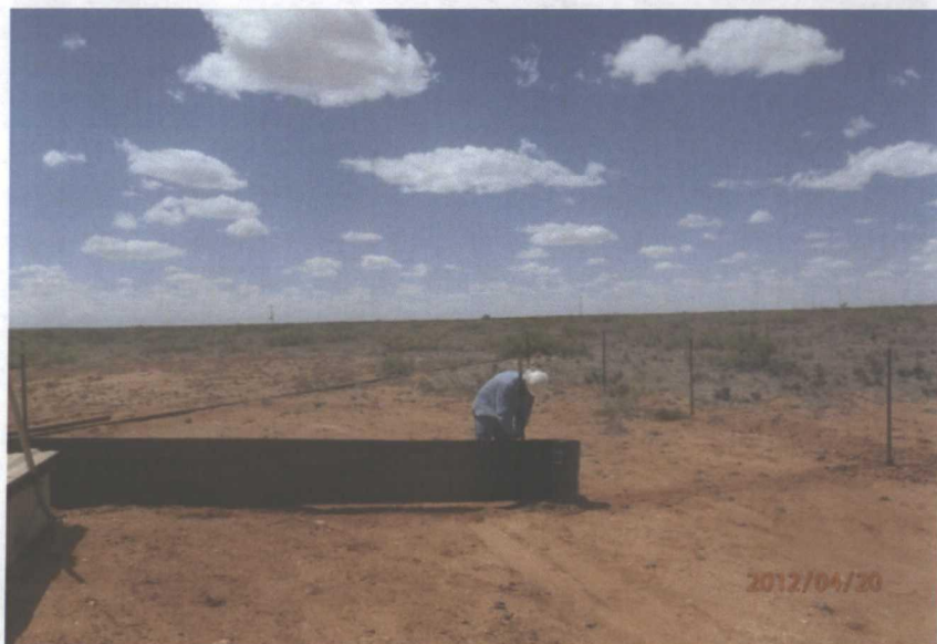
Installing silt net fence, facing west