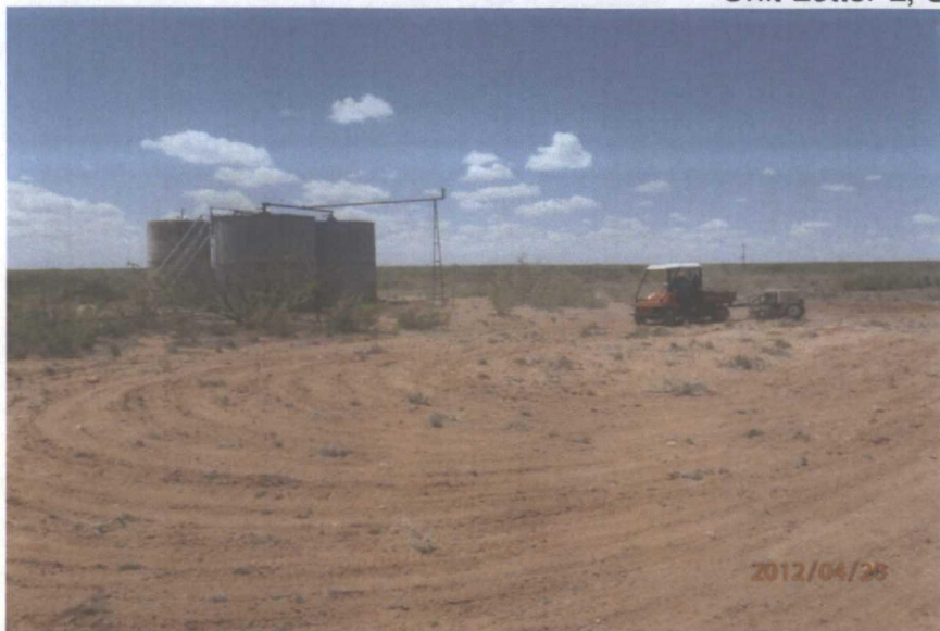
Seeding and tilling site, facing southwest