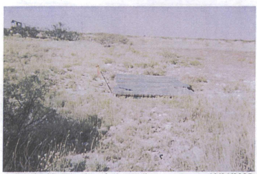
undisturbed junction box, facing north