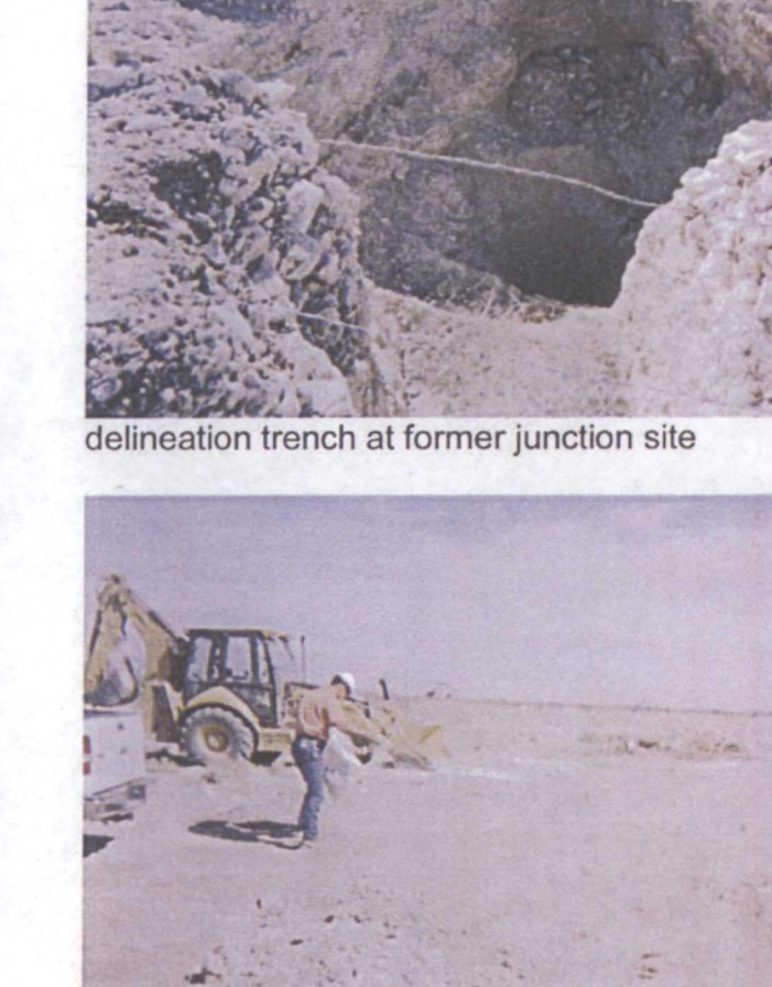
spreading clean, imported soil on site