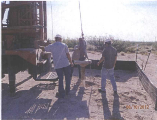
Pulling MW-1, facing east