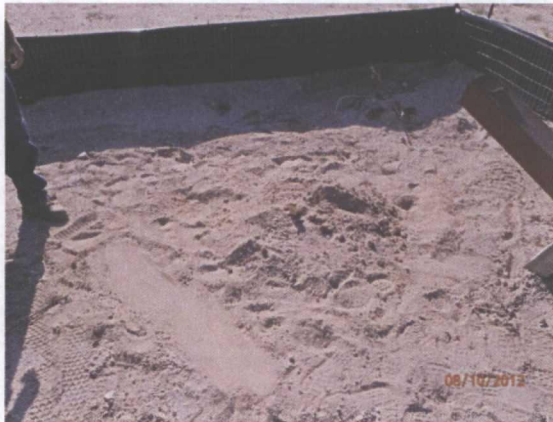
Completed MW-1, facing east