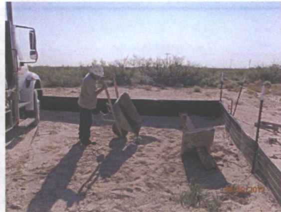
Plugging MW-1 with a 1-3% bentonite/concrete slurry, facing east