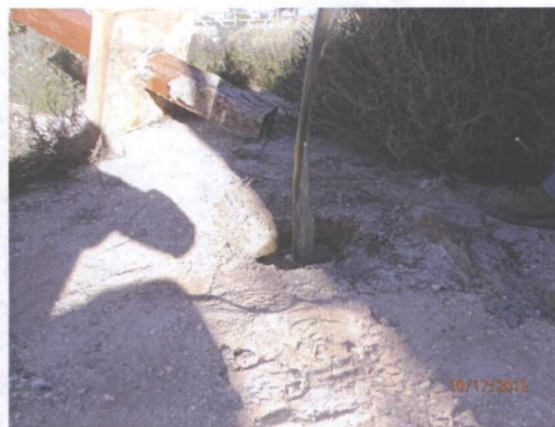
Plugging MW-1 with a 1-3% bentonite/concrete slurry with a 3 ft concrete cap