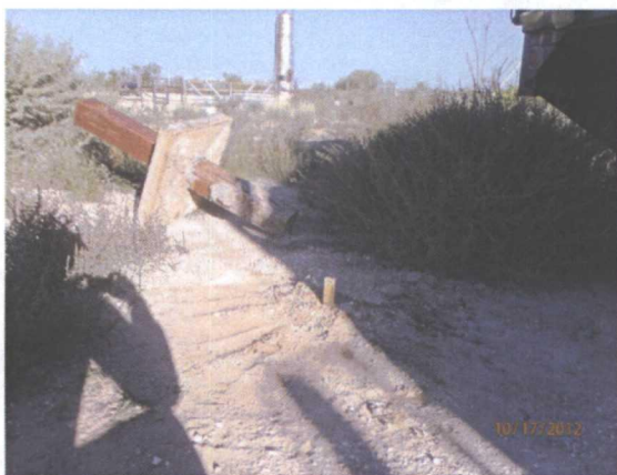
Plugged and abandoned MW-1, facing west