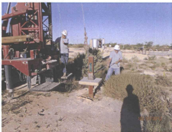
Pulling MW-1, facing west