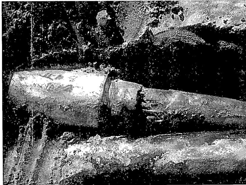
Picture 2 Failure point in flowline that caused release, Beeson F. Federal #029