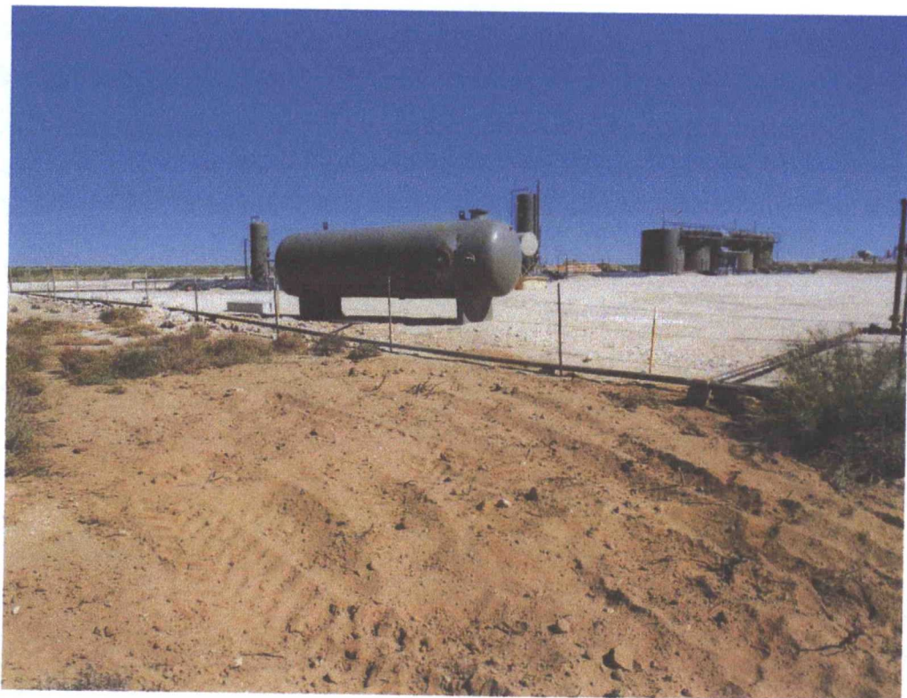
View Northeast – AH-1 backfilled