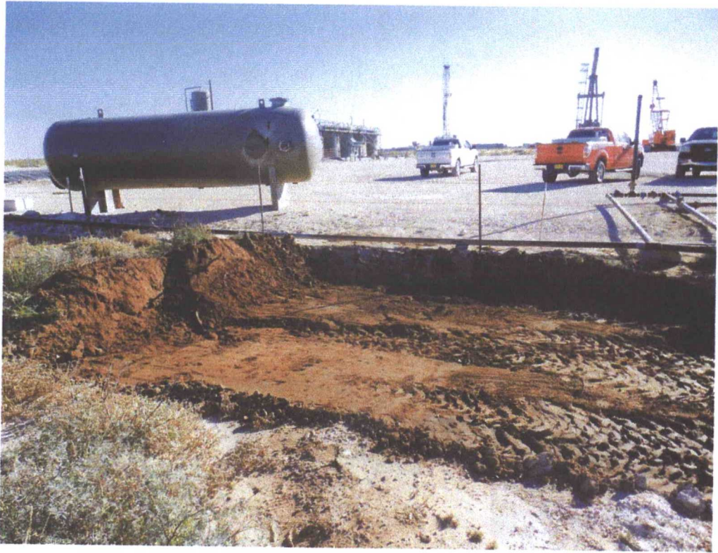
View East – AH-1 at 1.5'