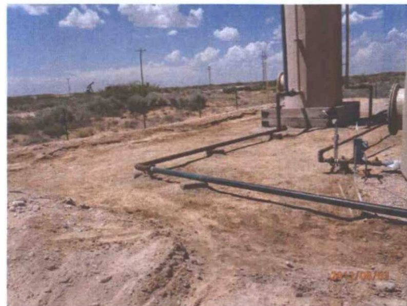
Excavation after shoveling, facing north