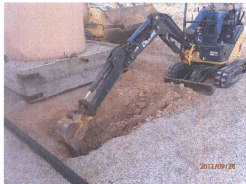
Excavating, facing south