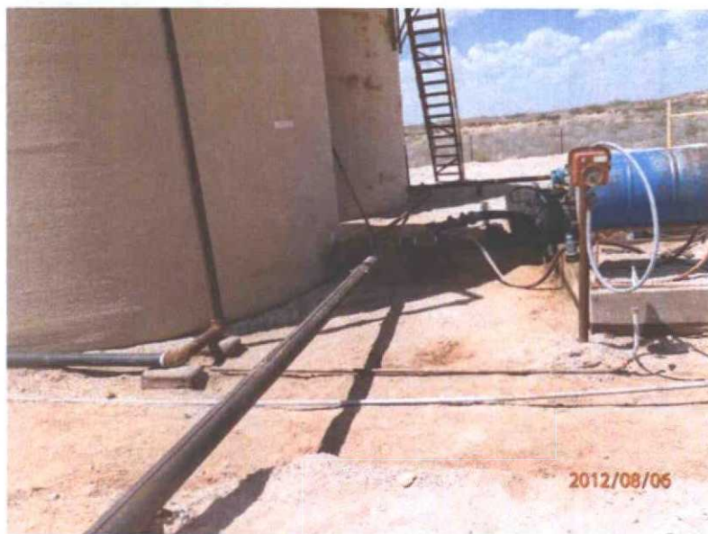
Excavation after shoveling, facing north