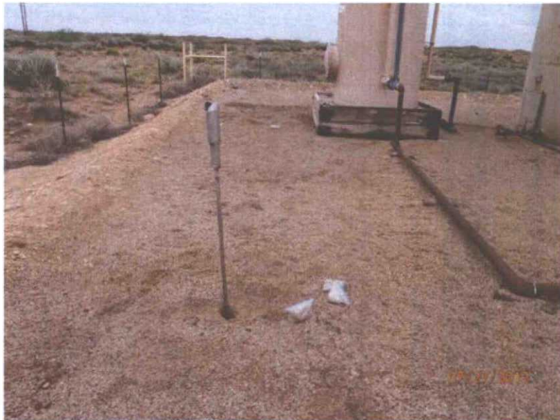
Sampling initial release, facing north