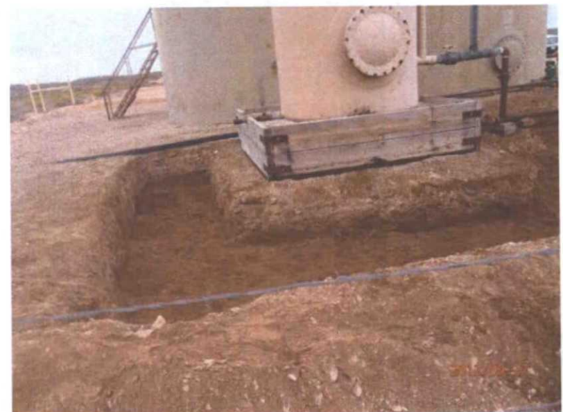
Final excavation, facing east