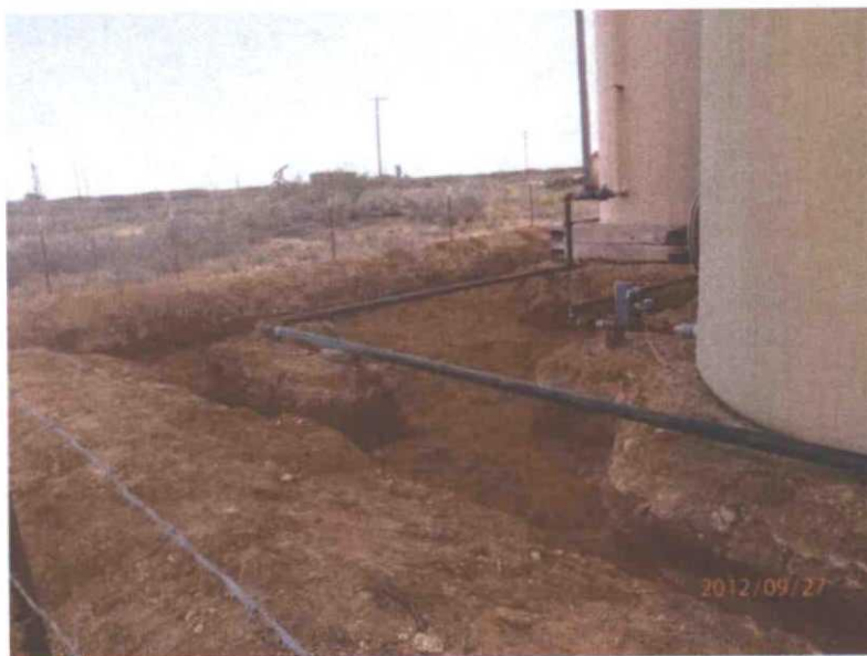
Final excavation, facing west