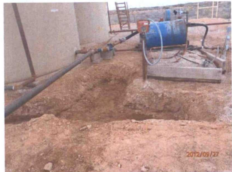
Final excavation, facing north