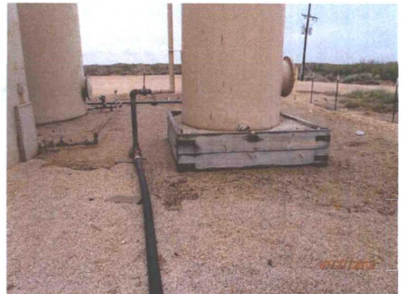
Sampling initial release, facing south