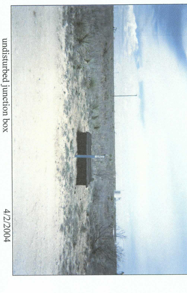
undisturbed junction box