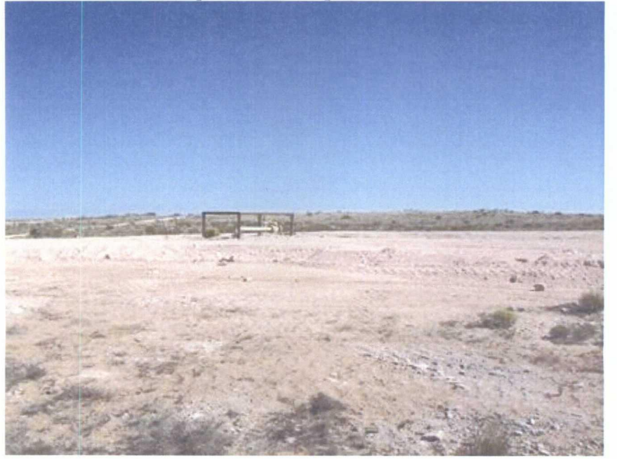
Concrete slab and conduit removed

Photographs taken on October 18, 2008-Concrete slab and conduit has been removed. Pipeline seen in photo below is active.