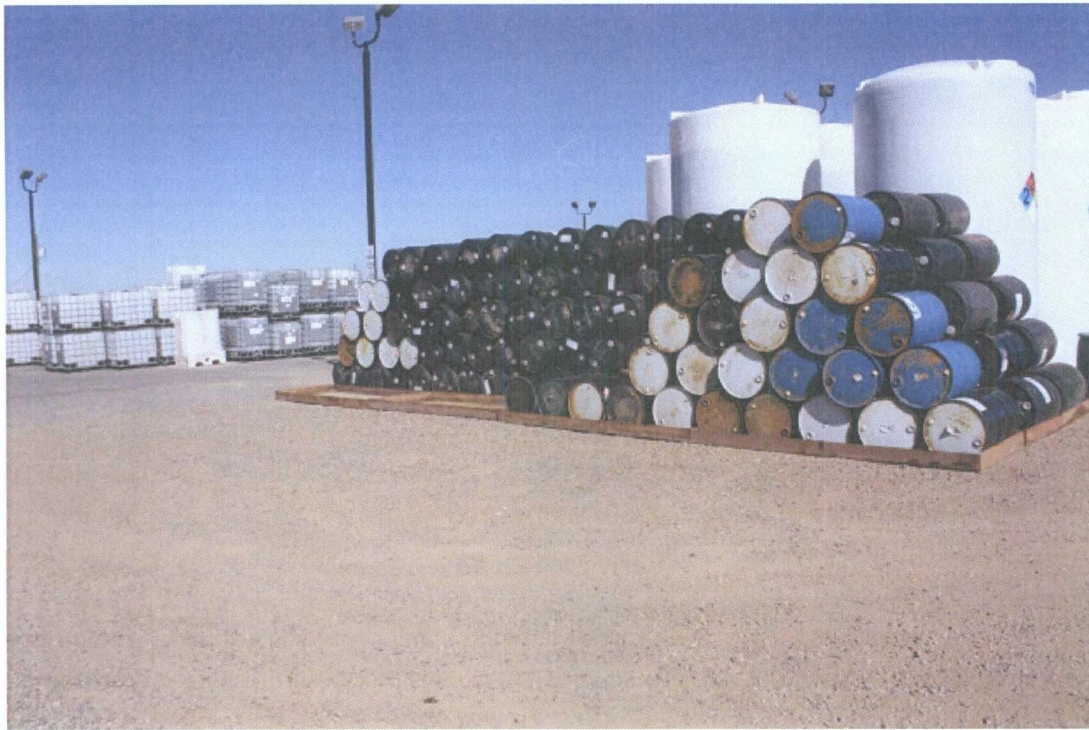
Empty drum storage area –secondary containment; April 2009 (containments purchased in June 2008)