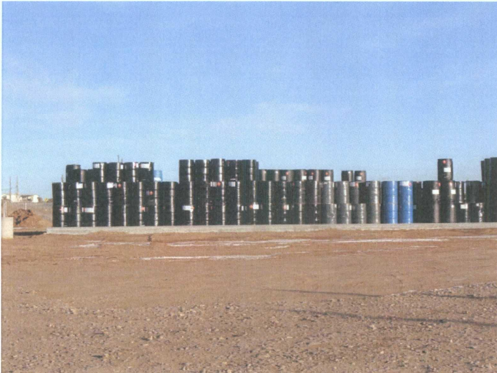
General Facility – drum storage area (curbed)