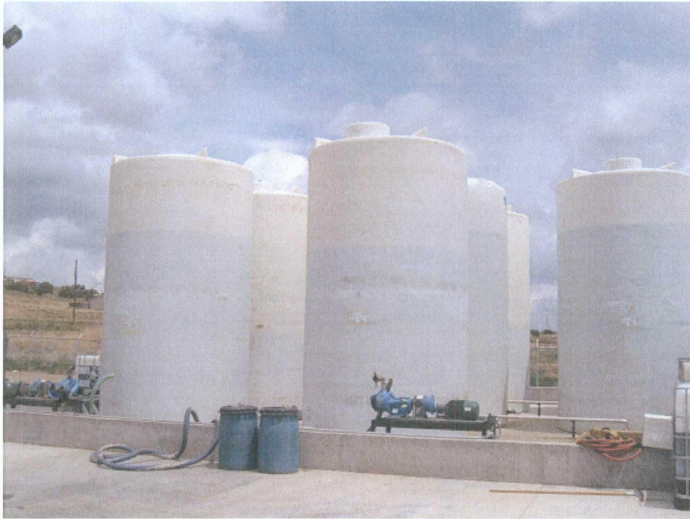
General Facility – tank storage area