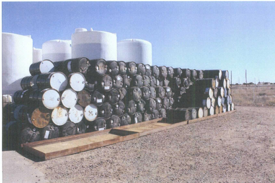
Empty drum storage area –secondary containment; April 2009 (containments purchased in June 2008)