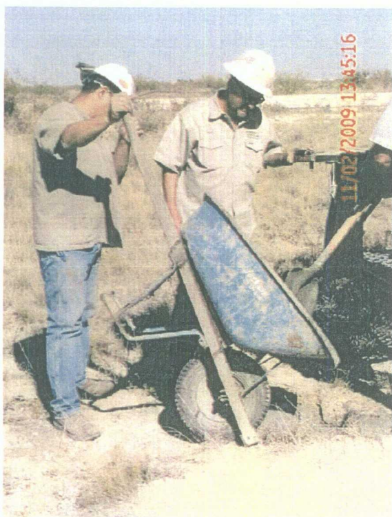
Plugging wells with a cement bentonite slurry