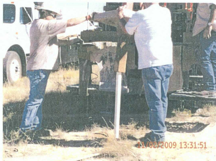
Remove casings from wells