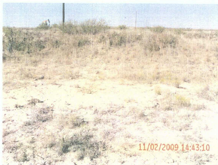
Completed plug and abandon