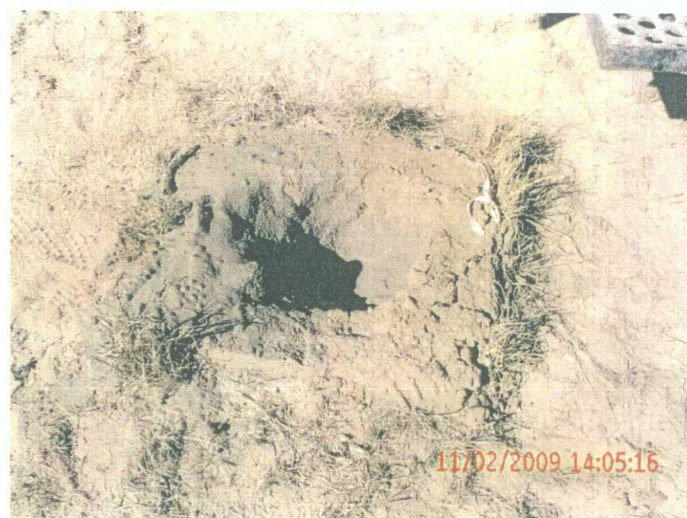
Hole prior to the 3 ft cement cap