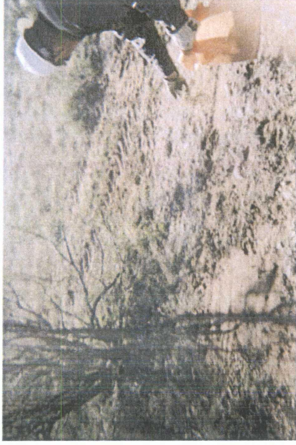
seeding backfilled site, facing south