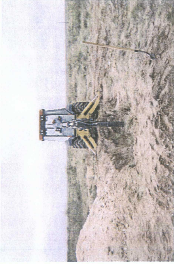
excavating at former junction site, facing south