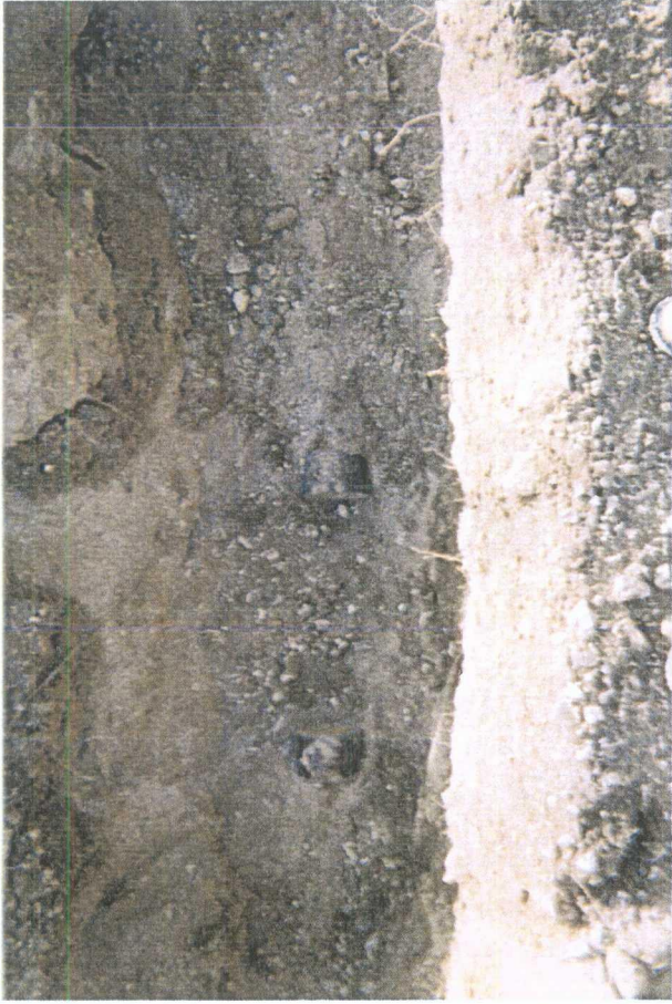
site prior to excavation, facing south