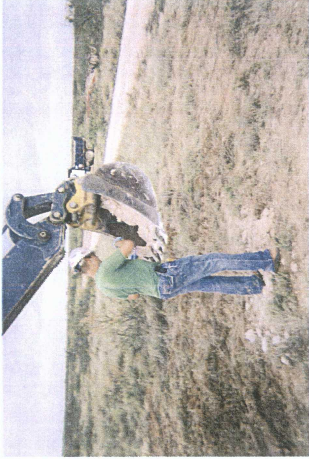
collecting a soil sample, facing west